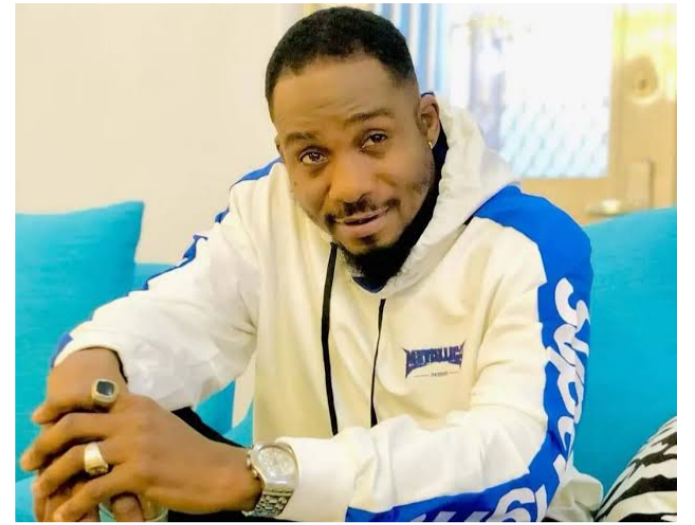
Late Junior Pope