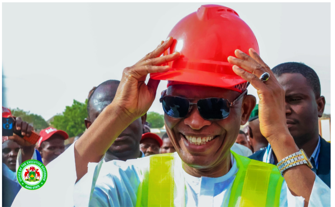
Governor Abba Kabir Yusuf laid a N15 billion three layer Interchange bridge at Kofar Dan'agundi in Kano metropolis as part of vision to enhance traffic flow in the ancient city, he visited the project site yesterday in company of some cabinet members