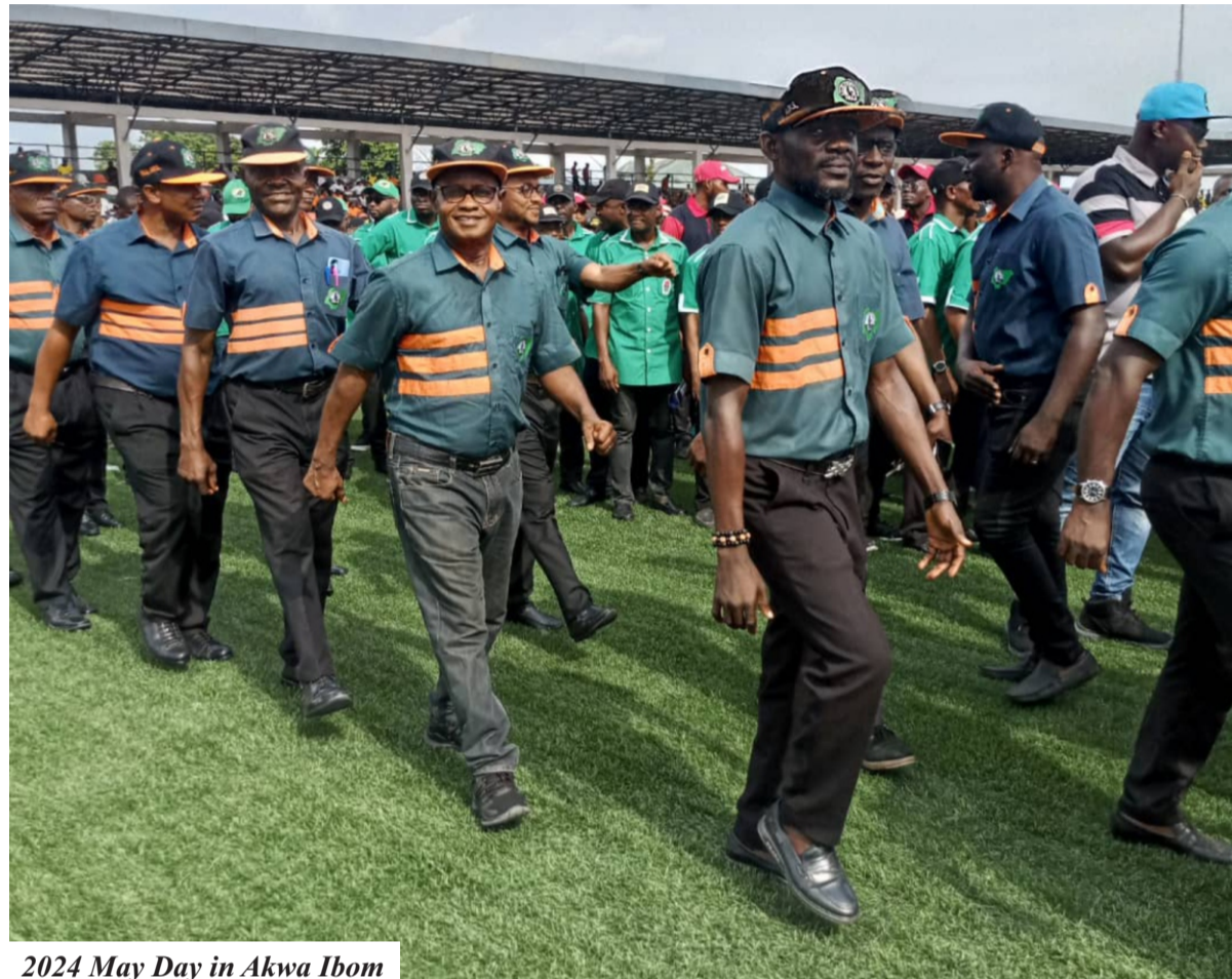
2024 May Day in Akwa Ibom

"A long term solution will be for all us to go back to the farm, and ensure that we produce food. A people that cannot feed themselves cannot boast of