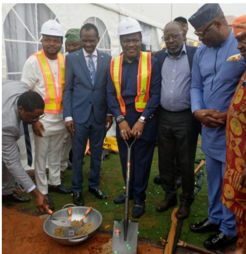
Odua Group Chairman turning the Sod

They also advised governments at all levels to devise workable mechanisms in addressing the country's foreign exchange crisis as it adversely affects the purchasing power of the people (especially the civil servants).