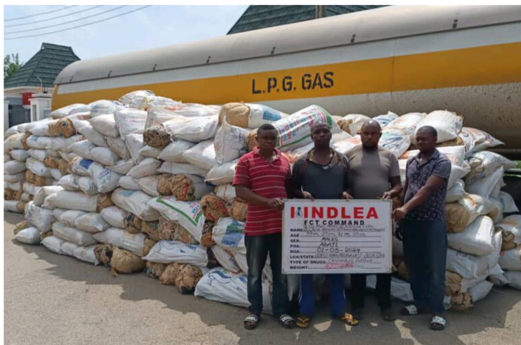
Some of the suspects and recovered items