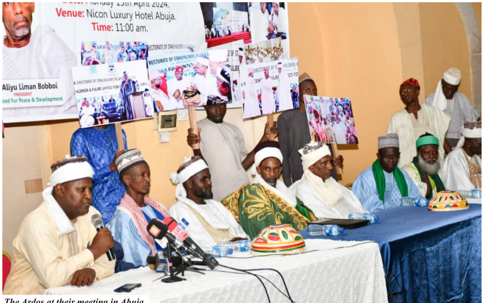
The Ardos at their meeting in Abuja

"Our recent concern is the onslaught of the FCT Minister's unilateral, unconstitutional impunity with which he