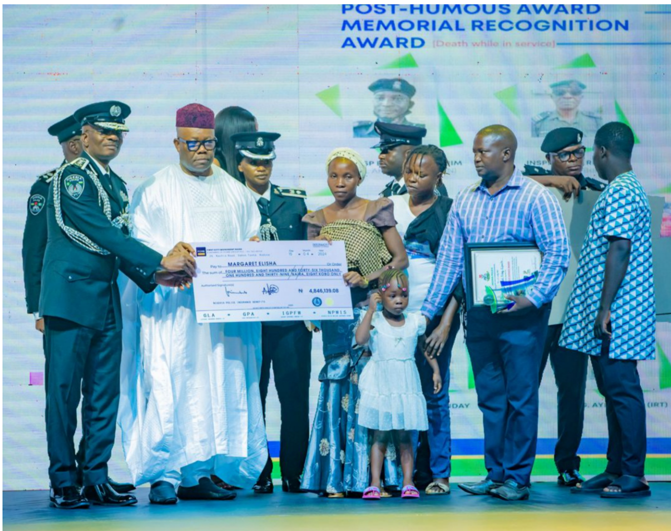
L-R; Inspector General of Police, Kayode Egbetokun, President of the Senate, Godswill Akpabio, presenting cheques to families of Police Officers, who died in the course of duty, during the maiden edition of the Nigeria Police Awards and Commendations Ceremony, held at the Transcorp Hotel, Abuja on Monday.