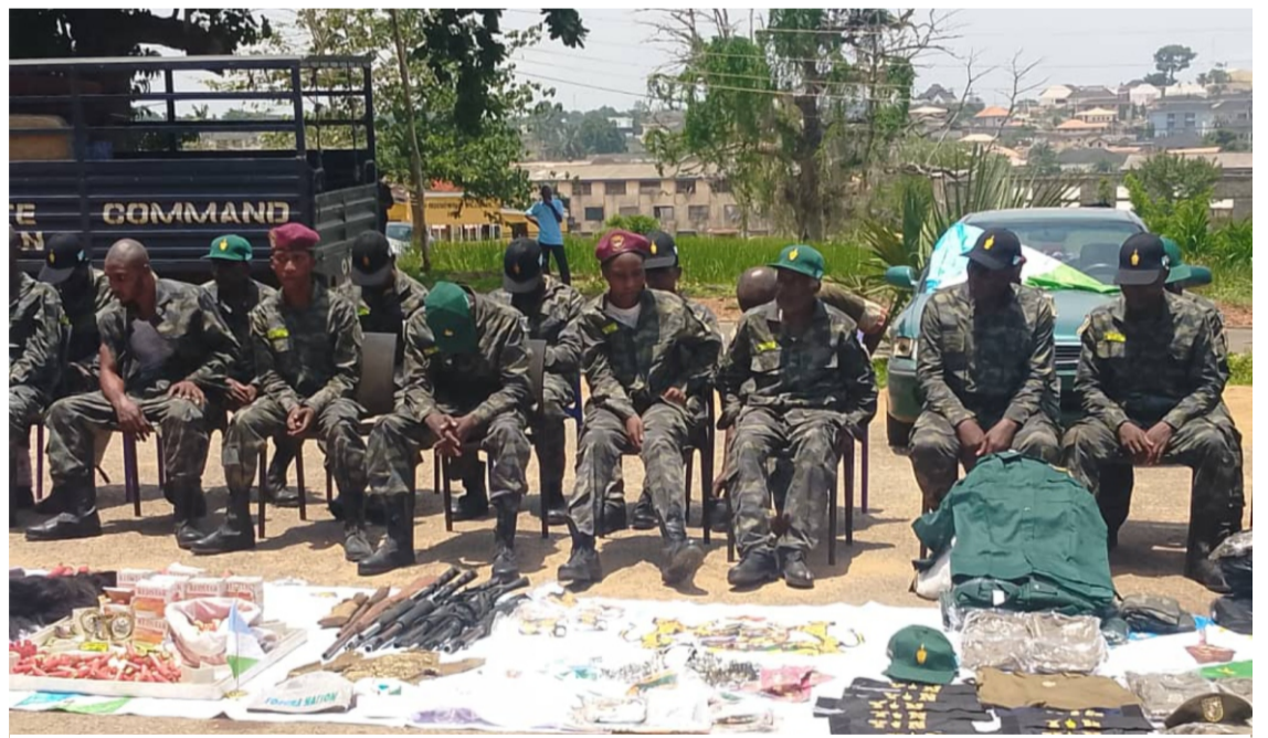
Some of the arrested Yoruba Nation Agitators at Oyo Police command headquarters in Ibadan

"A Total of (21) Twenty-One Suspects were arrested, (7) Seven rifles made up of