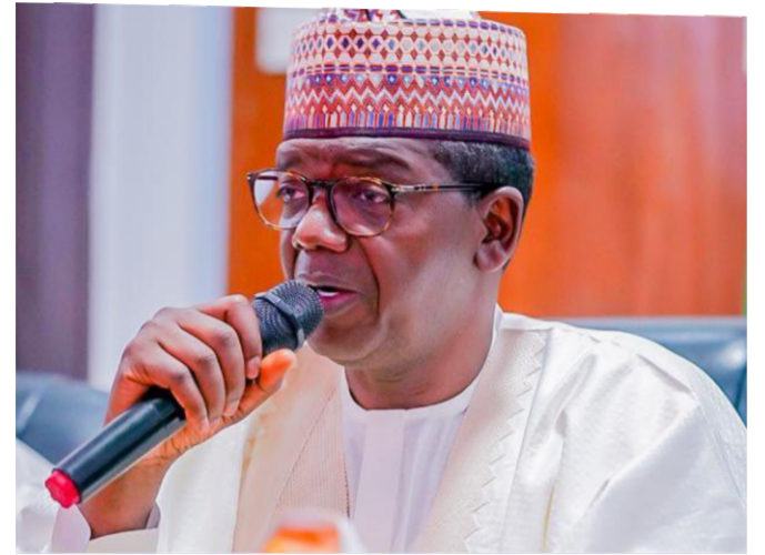
Alhaji Bello Matawalle