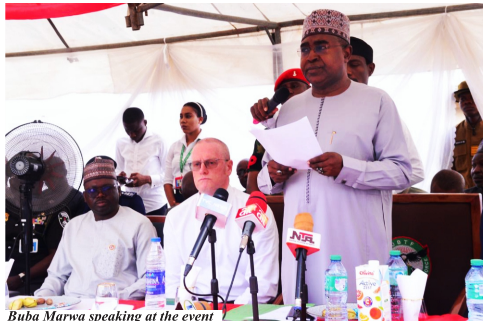
Buba Marwa speaking at the event

(7,561 tonnes) not only disrupts the flow of illegal drugs but also serves as a significant blow to the criminal networks responsible for their distribution. We have taken decisive action against illicit drug crop cultivation with our search-and-destroy campaign against cannabis plantations which have led to the destruction of 1,057.33348 hectares of cannabis farms in the past three years."