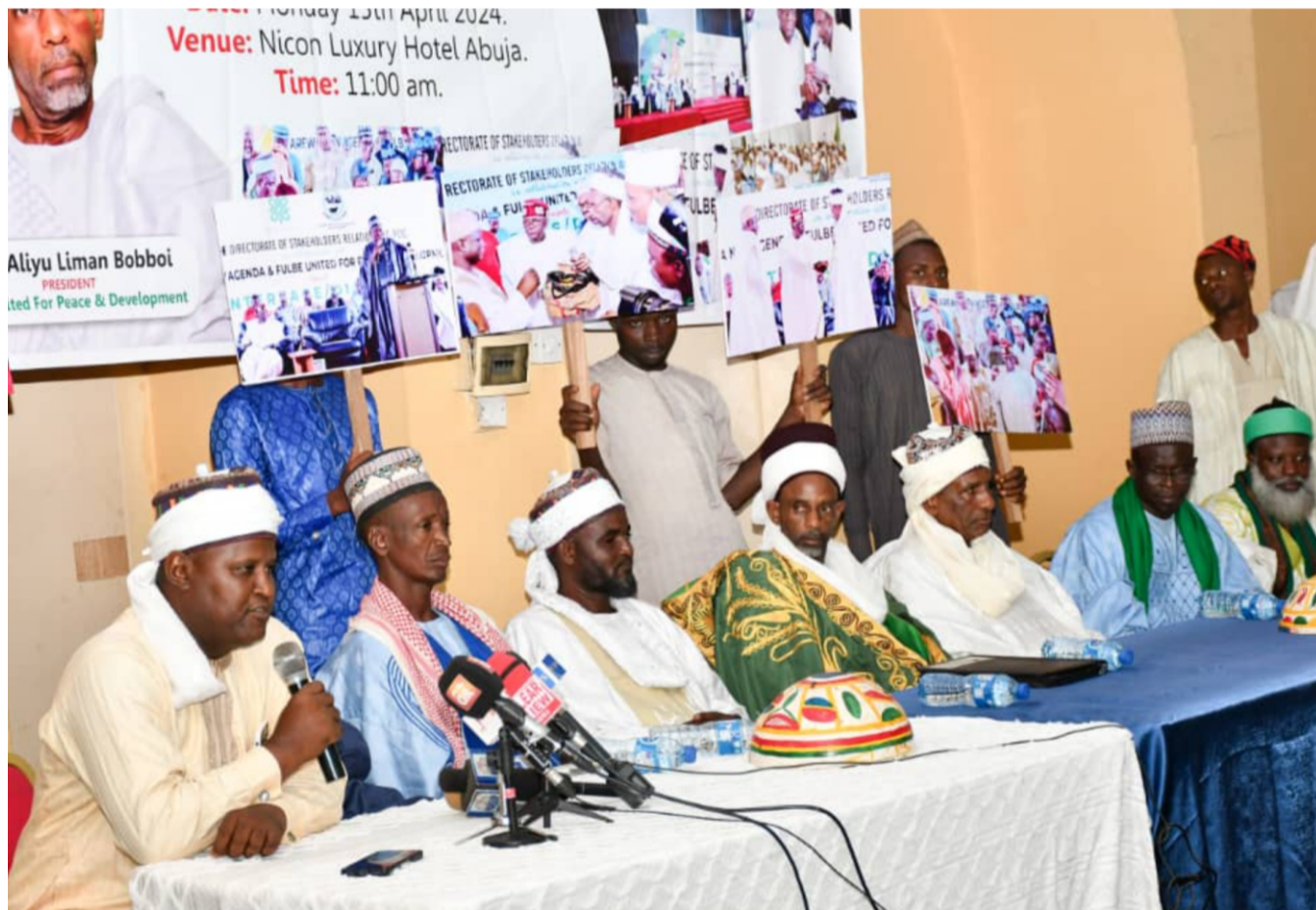
The Ardos at their meeting in Abuja