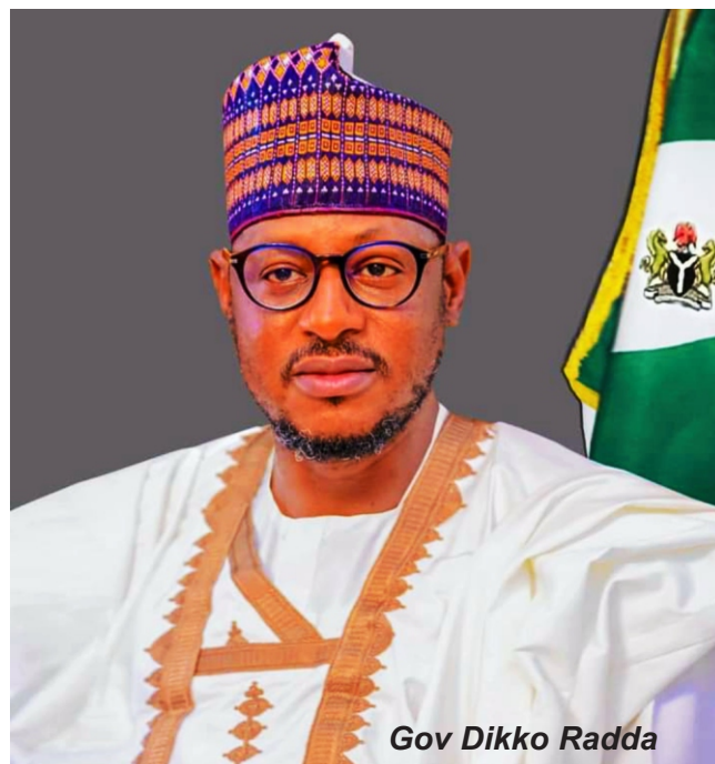
Gov Dikko Radda

equivocation, I remain steadfast in my commitment to fulfilling my entire campaign promises and steering Katsina State towards the promised land of accelerated socio-