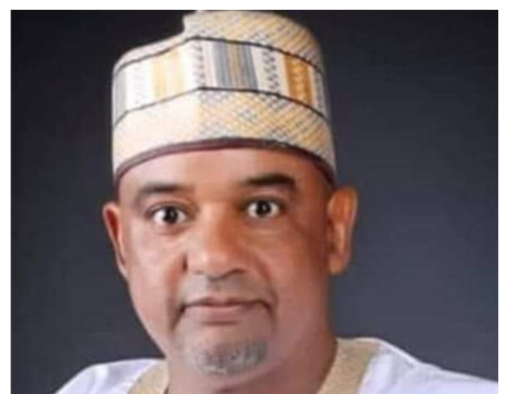
Ambassador Umar Iliya Damagum

"On behalf of the entire discipline and supporters of the party, we are confident with the leaderships of the present NWC, under Amb Umar Iliya Damagum, the Board of Trustees (BoT), and PDP Governors' Forum among others.