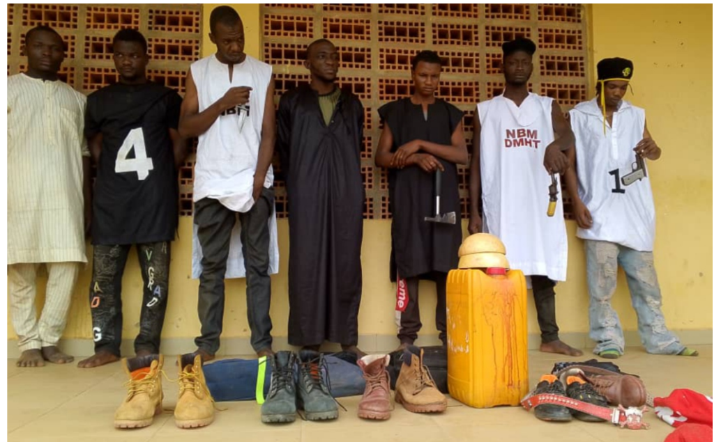
Some of the nabbed suspected ritualists

A search was conducted on their vehicle, a Lexus sedan, with registration number RSH 712 CW, where two locally made pistols, one Beretta pistol, two jacket knife, two calabashes and a jerry can,