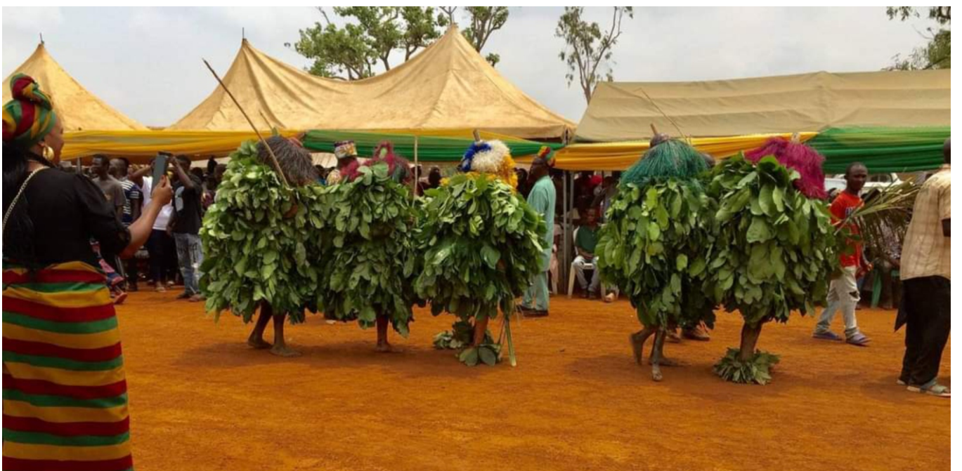
Cultural display by the Ham people of Jaba LG of Kaduna State