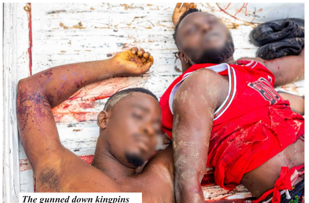
The gunned down kingpins