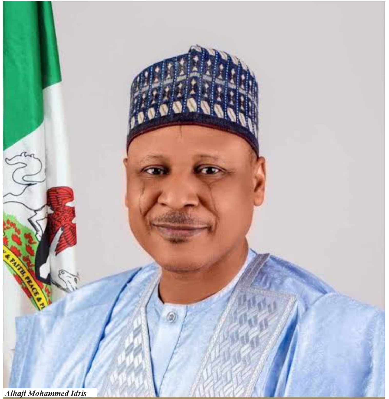
Alhaji Mohammed Idris

the chief image maker of the Bola Tinubu administration. However, in this regard, he provides the platform for fellow Ministers, who give insights on the various Ministries, Departments and Agencies under their watch. Malagi, more or less, is the conductor who mediates, calibrates and directs the choir, giving harmony in the orchestra of governance.