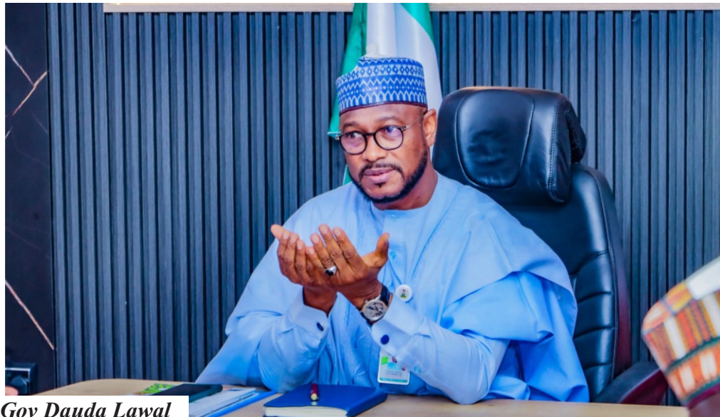
Gov Dauda Lawal

"I congratulate all Muslim communities in Zamfara, Nigeria, and around the world. May we celebrate many more Eids in good health."