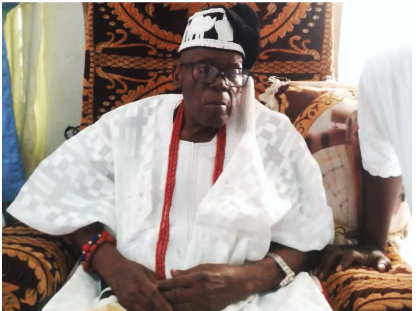
Olubadan designate, Oba Owolabi Olakulehin

Voters Didn't Have Problem With Our Party's Logo During 2023 Election, SW NNPP PRO replies Nat'l Secretary P.4