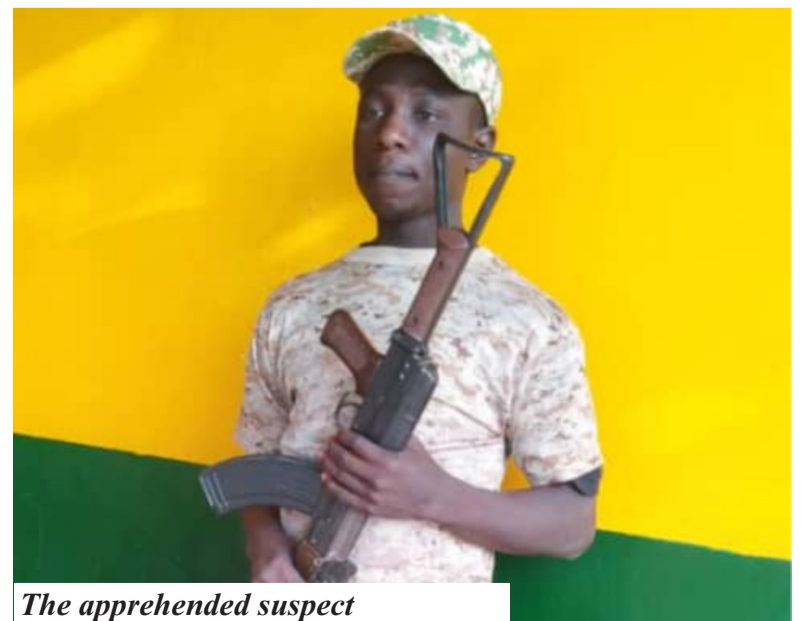
The apprehended suspect

CP Ali Audu Dabigi, according to the statement, commended the swift action of the officers involved and reiterated the command's determination to rid the state of criminal elements.