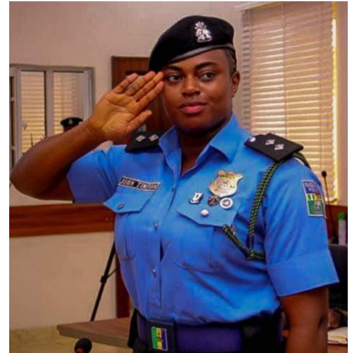
New Akwa Ibom PPRO