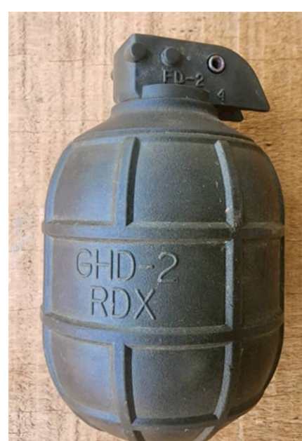
The military grade grenade recovered