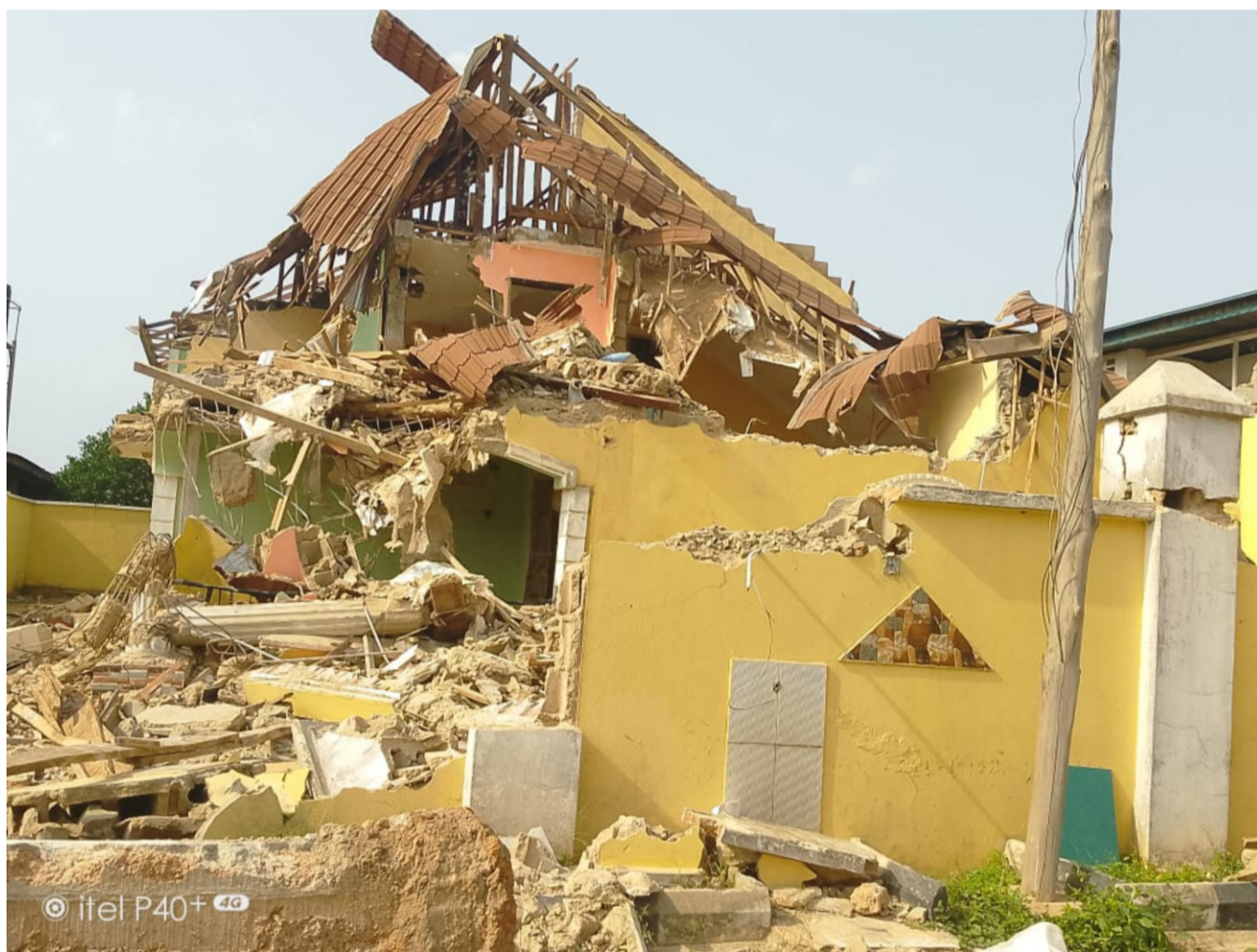
The demolished building

The Commissioner hinted that the state government has also demolished an illegal lithium processing factory Idi-Ayure road, Oluyole local government area of Ibadan.