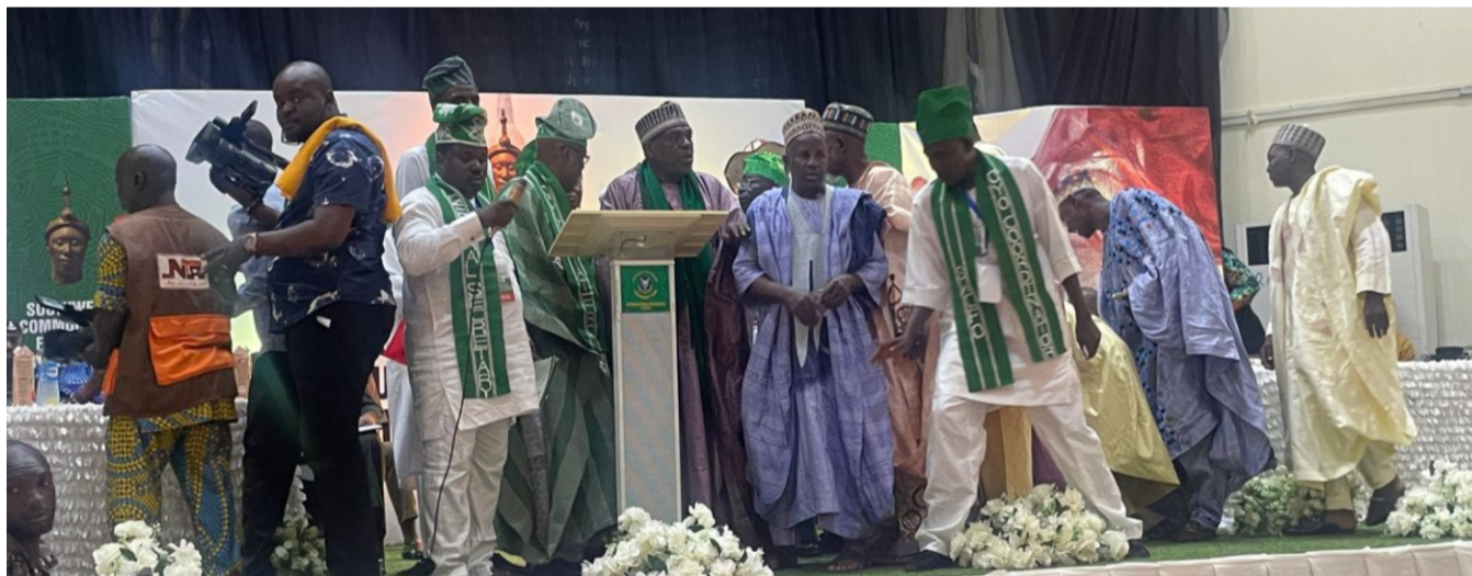
Miyetti Allah and SW Farmers leaders at the signing in Ibadan on Friday