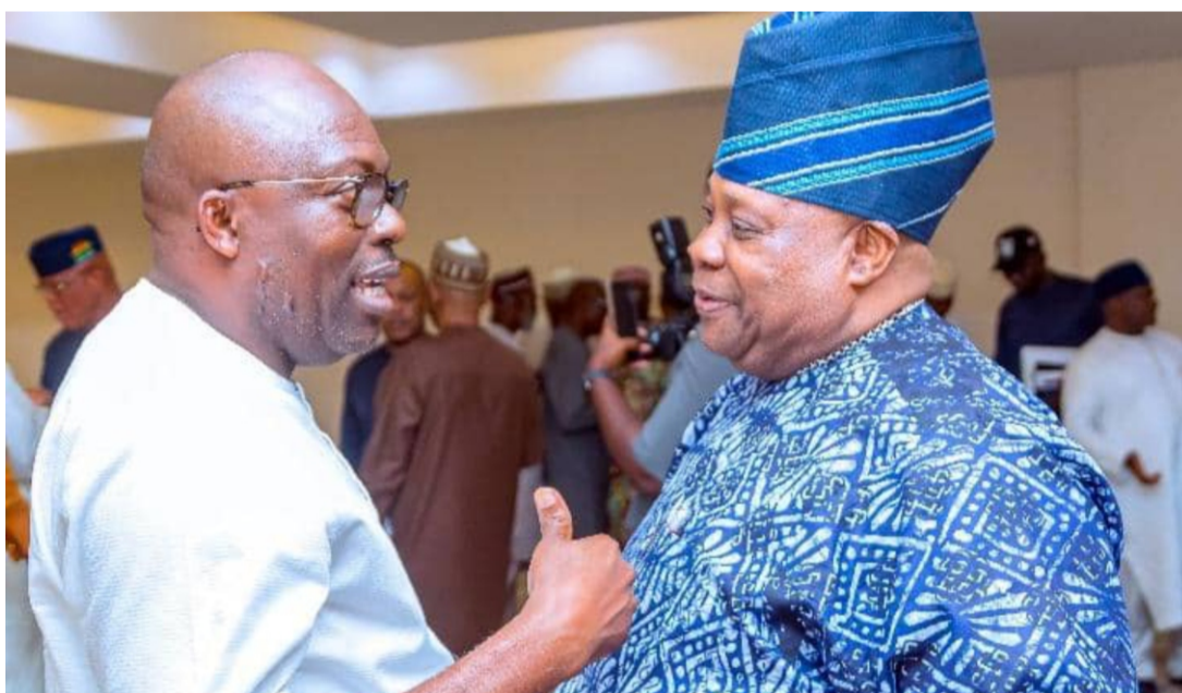
Rivers State Governor, Sir Siminalayi Fubara left and Osun State Governor, Senator Ademola Adeleke @ the 98th PDP NEC Meeting held @ the PDP National Secretariat, Wadata, Abuja on Thursday.