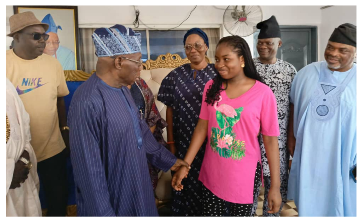
Former President Obasanjo during the visit