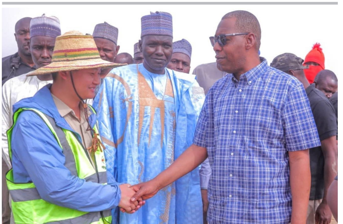
Governor, Babagana Umara Zulum in discussion with the people of Koshebe on how to resettle them, Koshebe is a community in Mafa Local Government of Borno State.

Don't Desecrate Courts While Fighting Corruption, Anti-graft CSOs Caution EFCC, Others P.3