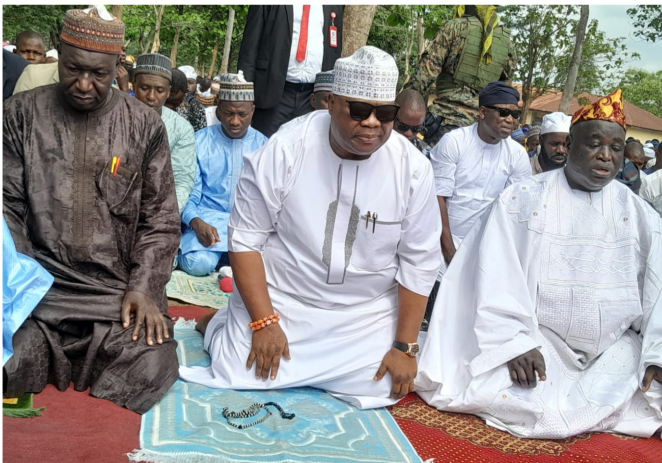
Osun State Commissioner of Police, Muhammed Umar Adah, Osun State Governor, Senator Ademola Adeleke and Timi of Edeland, Oba Munirudeen Adesola @ the 2024 Eid-el fitr held @ the Muslim Grammar School playing ground Ede, Osun State on Wednesday.

current economic hardship, which is a national problem. As you all know, the State Government in collaboration with the Federal Government are taking measures to ameliorate the situation by providing palliative items in form of foodstuffs. Let me also assure you that Government will continue to take necessary measures to bring succor to the good people of the State. Meanwhile, I want to appeal to you to see the situation as