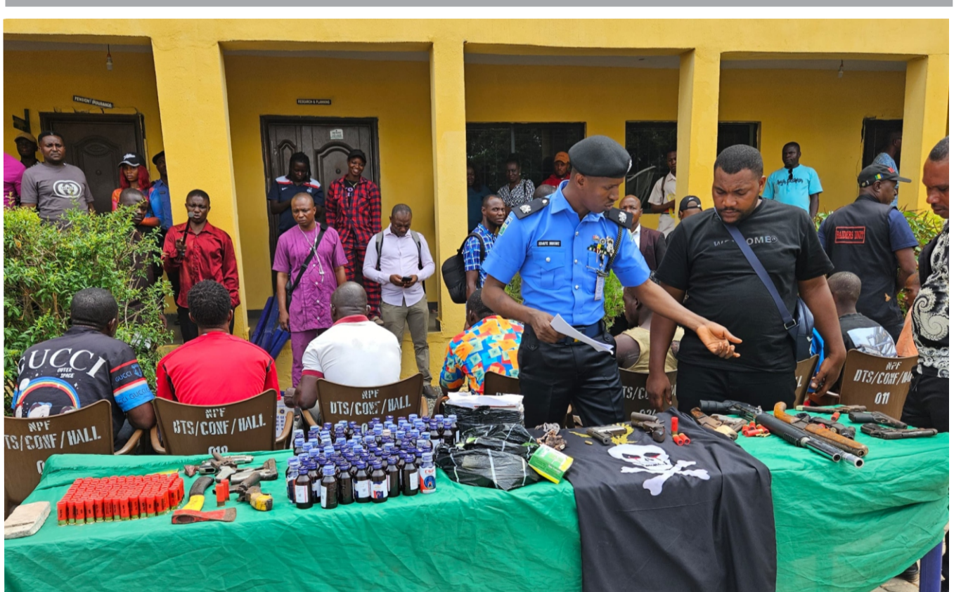
Delta PPRO at the press briefing with exhibits on display.