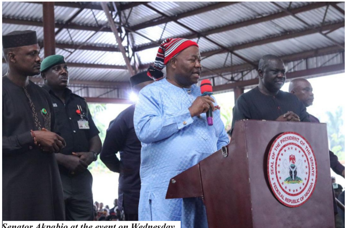
Senator Akpabio at the event on Wednesday.

The Senate President stressed, "As I am touching you now from the political angle, I will also touch the state without any political party affiliation. Most of the projects we are putting in place would be used by people resident in the state. Relax, things are getting better."