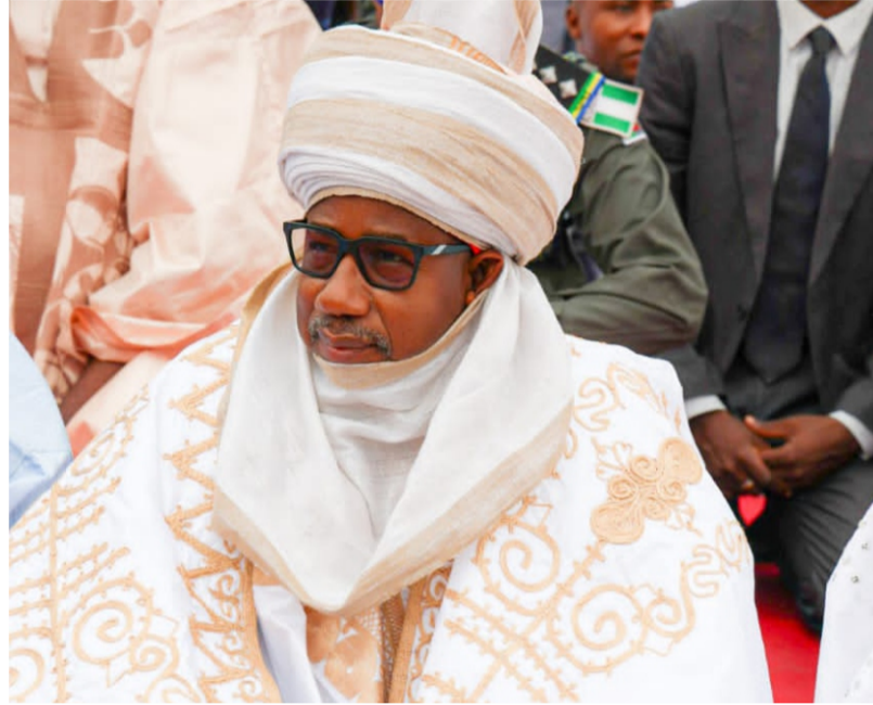
Governor Bala Mohammed of Bauchi State at Eid-el-fitr prayer ground.

"Our Government is irrevocably committed to the continued peaceful coexistence among the heterogeneous ethnic and religious groups in the State. I appeal for your continued understanding, cooperation and support