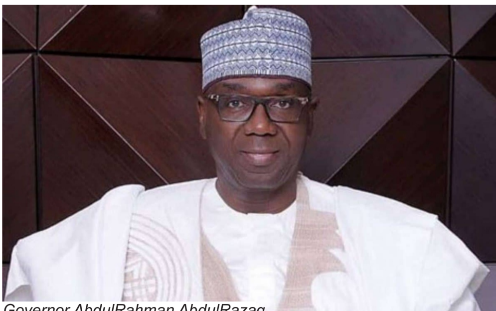
Governor AbdulRahman AbdulRazaq