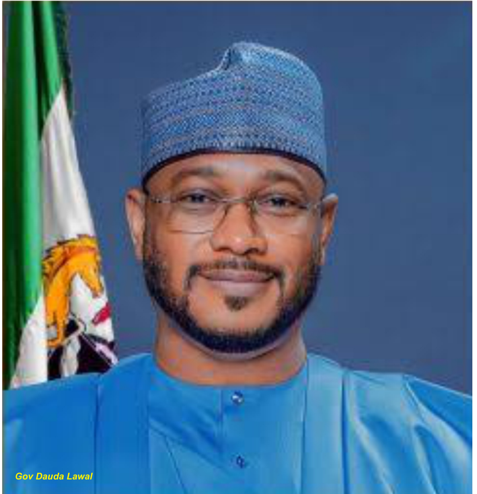
Gov Dauda Lawal

I suspect foul play and a reprisal attack of the former video of the armed bandits who had sung praising the former Governor, Muhammed Bello Mutawalle, the current Minister of Defense.