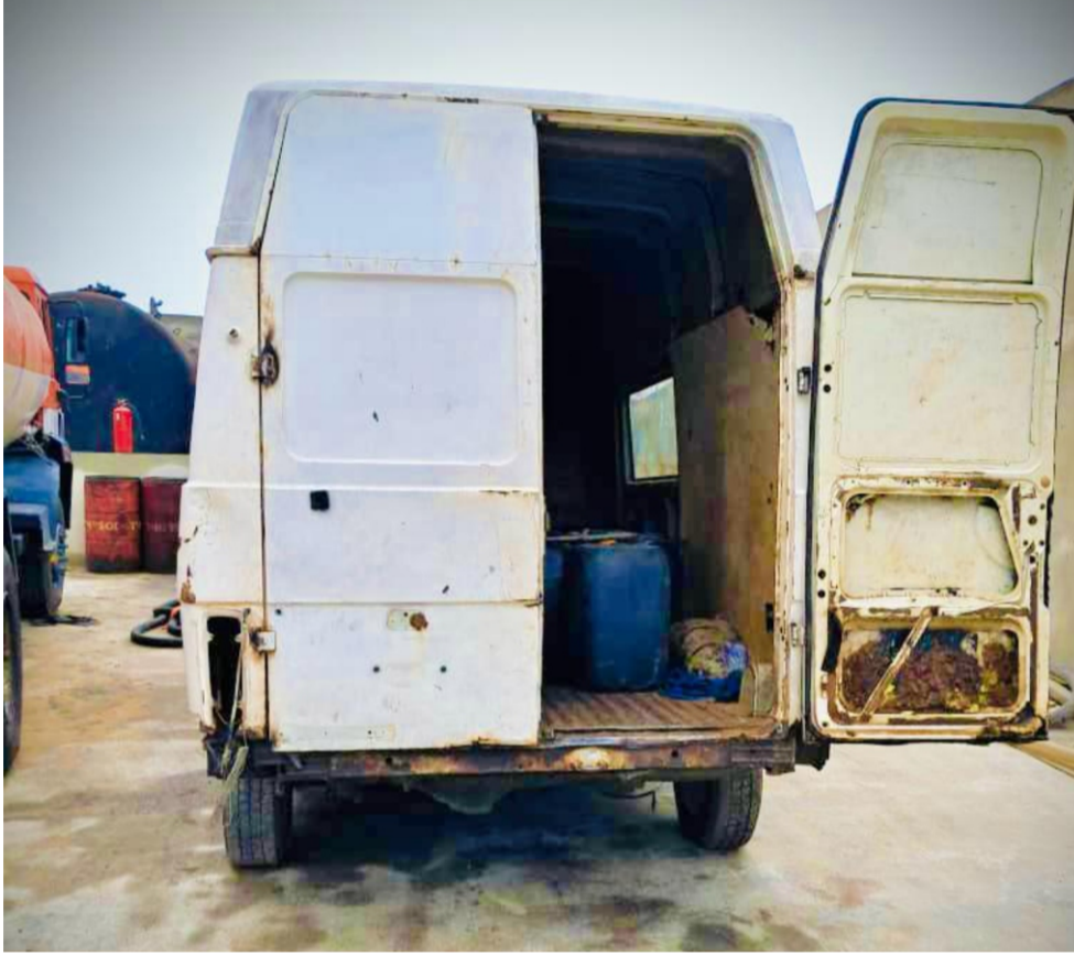
The recovered bus, tankers and Jerry cans at the illegal fuel depot

The Commander told newsmen that the NSCDC is an appropriate government agency saddled with the responsibility to