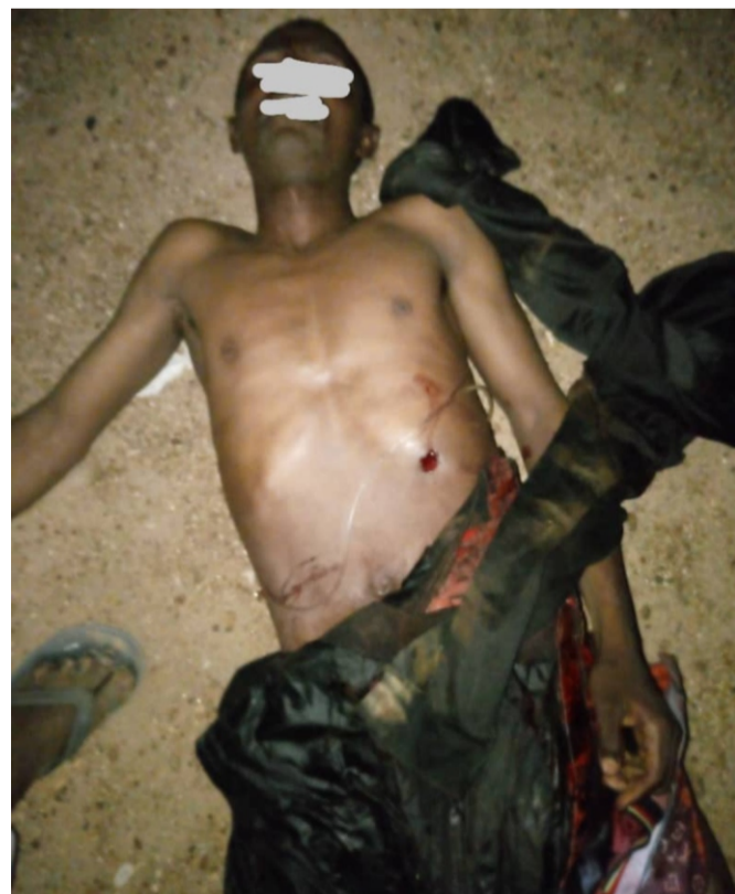
The neutralized bandit

"We went through your records and we couldn't find any of you wanting. We believe in you and we expect your full reports in 3 months time".