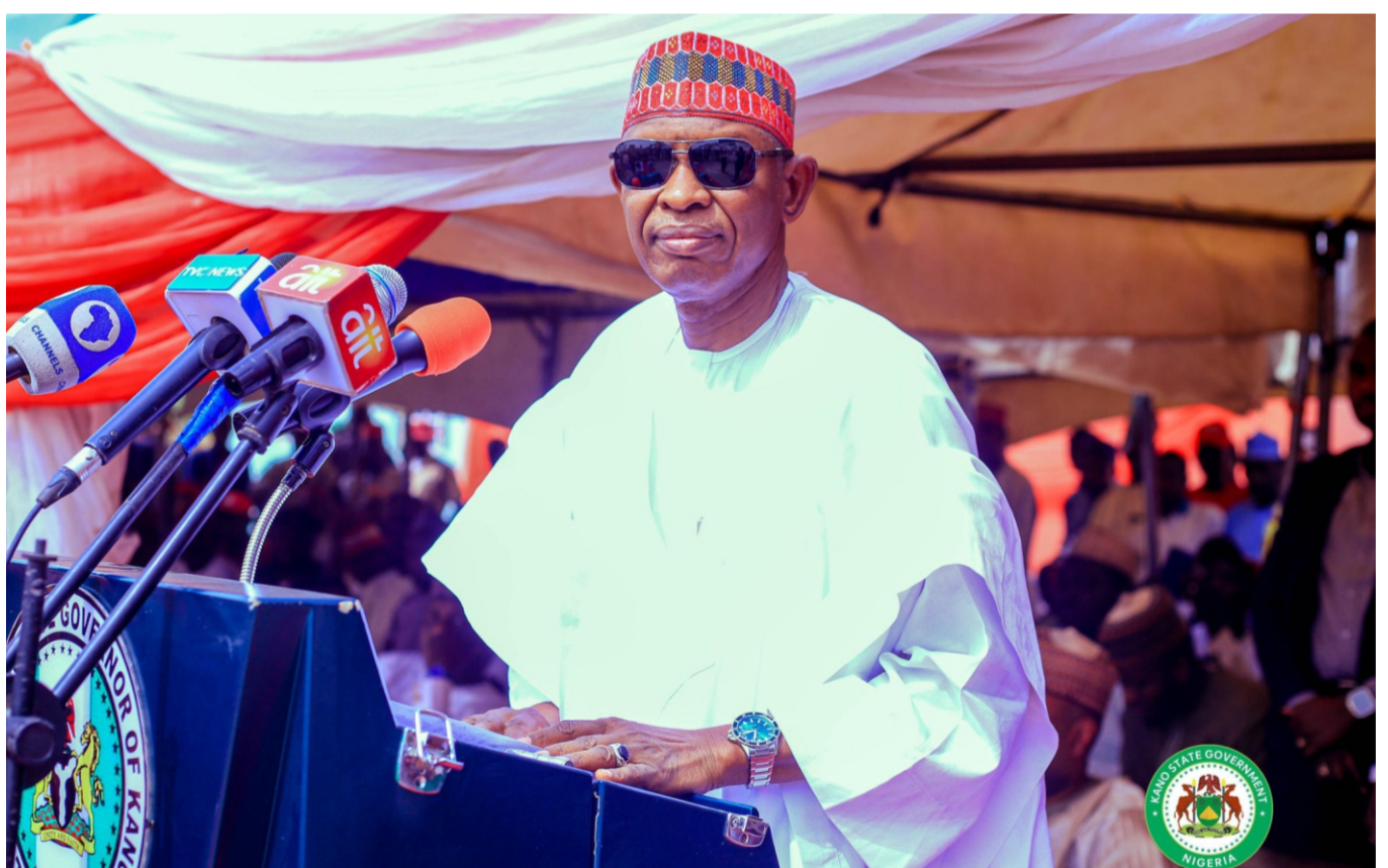
Governor Yusuf at the inauguration of the committee of inquiry in Kano

Gov Yusuf Inaugurates Commissions Of Inquiry Into Political Violence, Misappropriation Of Public Assets