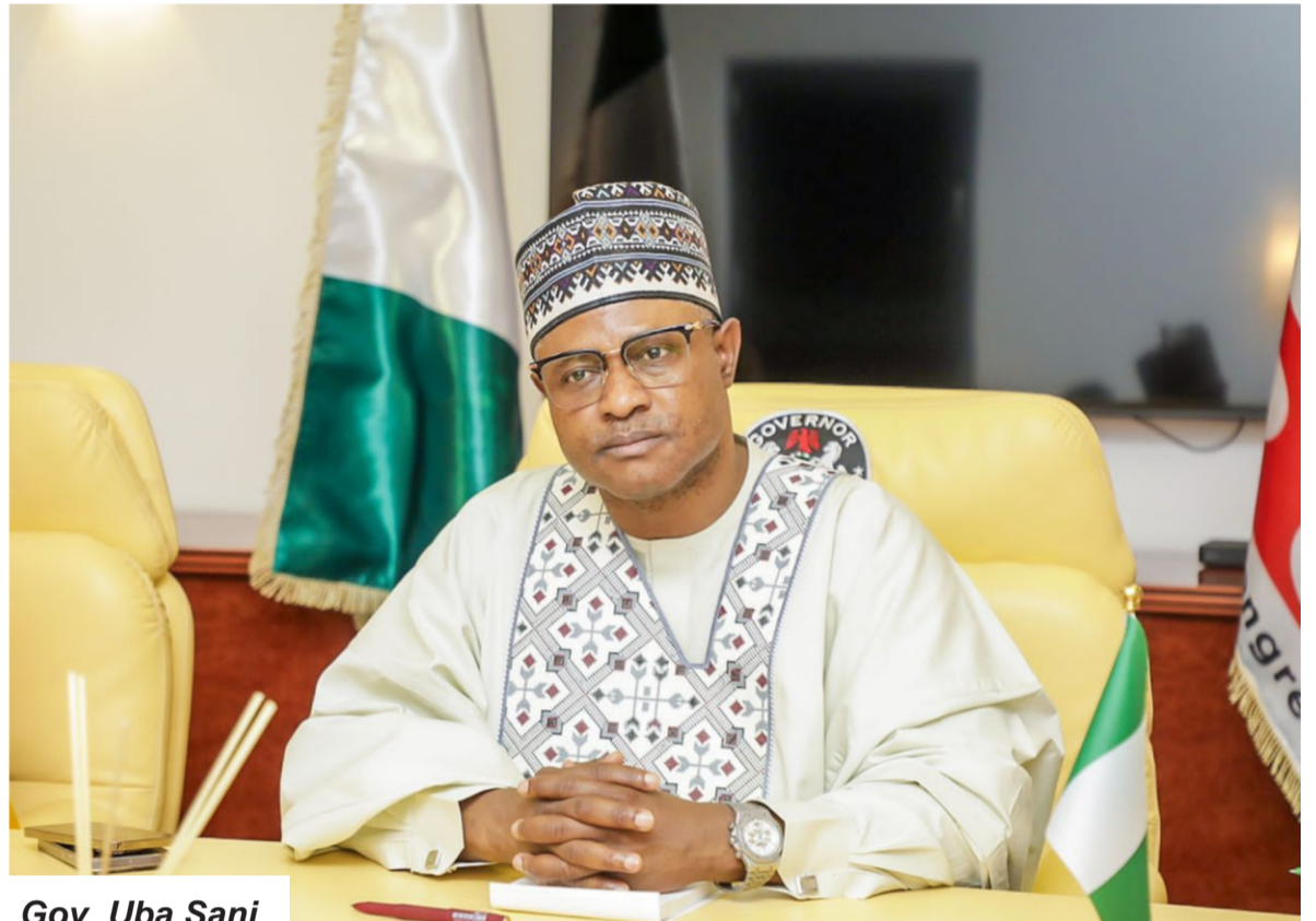
Gov Uba Sani