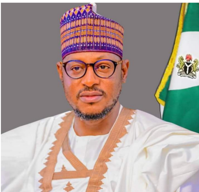
Governor Dikko Umaru Radda