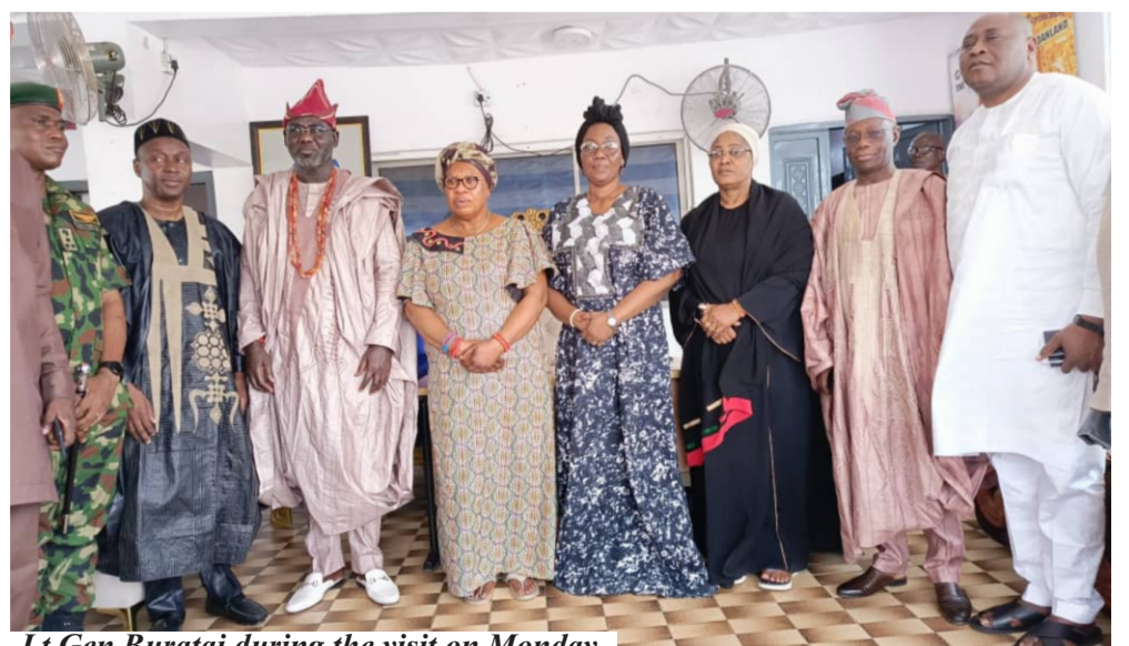
Lt Gen Buratai during the visit on Monday

The Oniroko added, " We shall forever remain grateful to him just as we implore all the people left behind not to mourn but to rejoice in the impactful and fulfilled life lived by the departed great monarch".