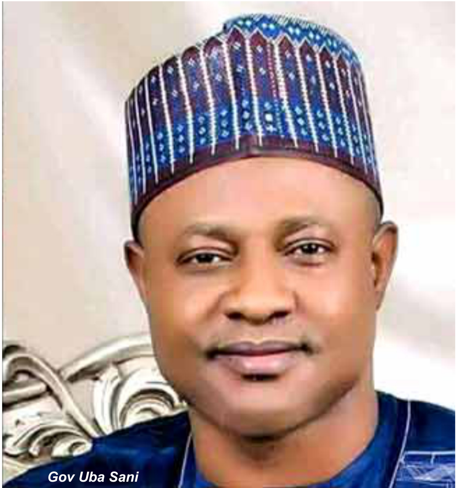
Gov Uba Sani

However, one is taken back as to why the