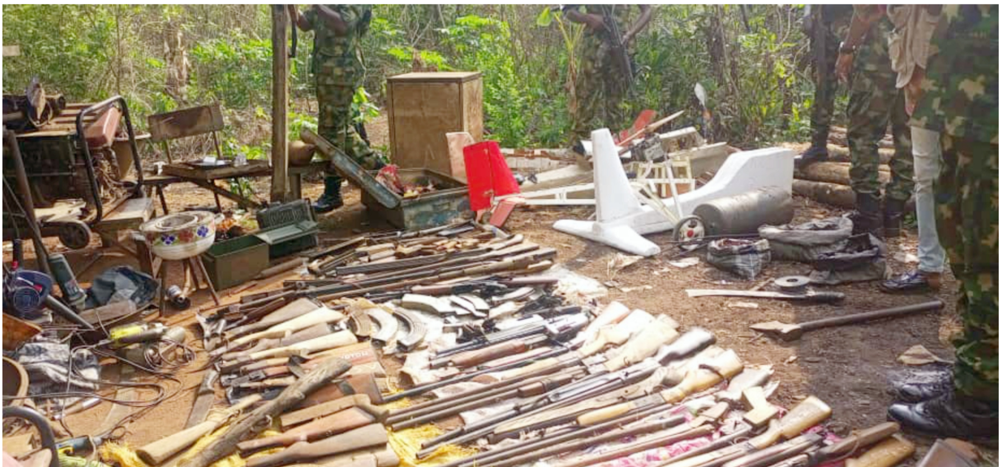
The cache of arms and ammunition discovered by the Army.