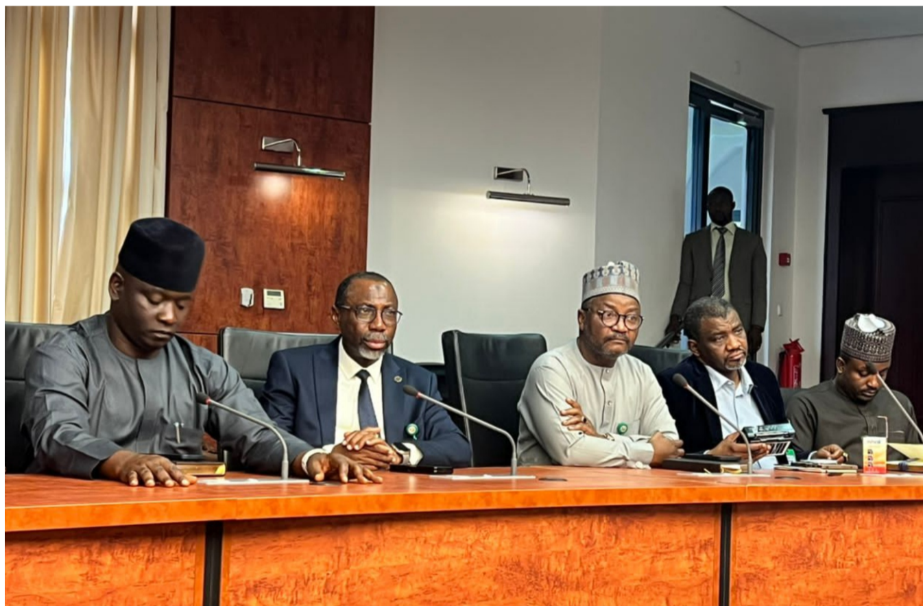
Governor Uba Sani yesterday, hosted the Hon. Minister of State for Education, Dr Yusuf Tanko at Sir Kashim Ibrahim House, the Minister and his entourage were in Kadua to sympathise with the governor following the unfortunate incident of the kidnapping of school children at Kuriga Village,

■ Decries focus of kidnappers on defenseless, innocent school children