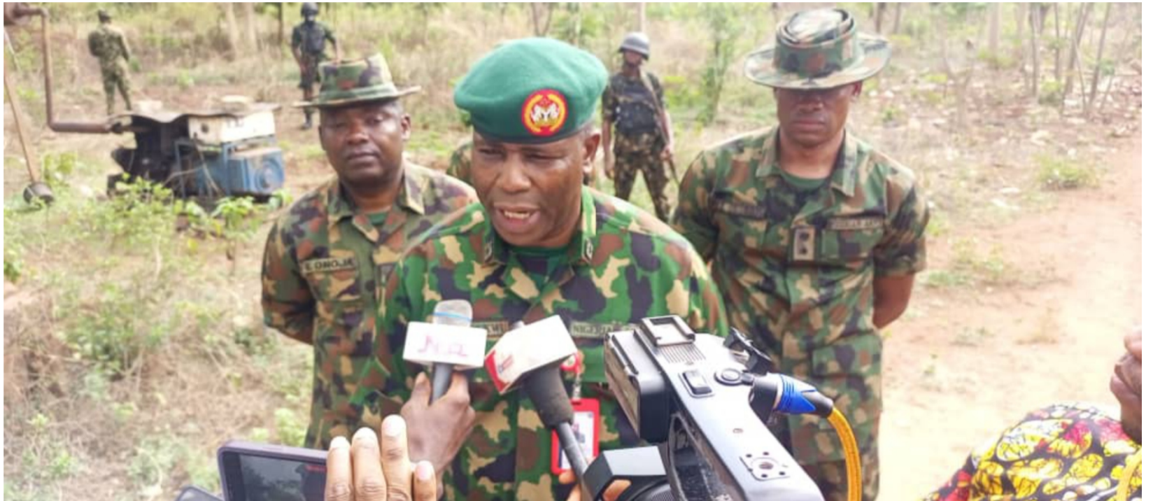
The Commander 63 Brigade, Brigadier General Ugochukwu Unachukwu, at the forest briefing newsmen

The arms factory located in a forest has a surveillance post, a generating set connected from a remote location, an oven for melting of iron and a