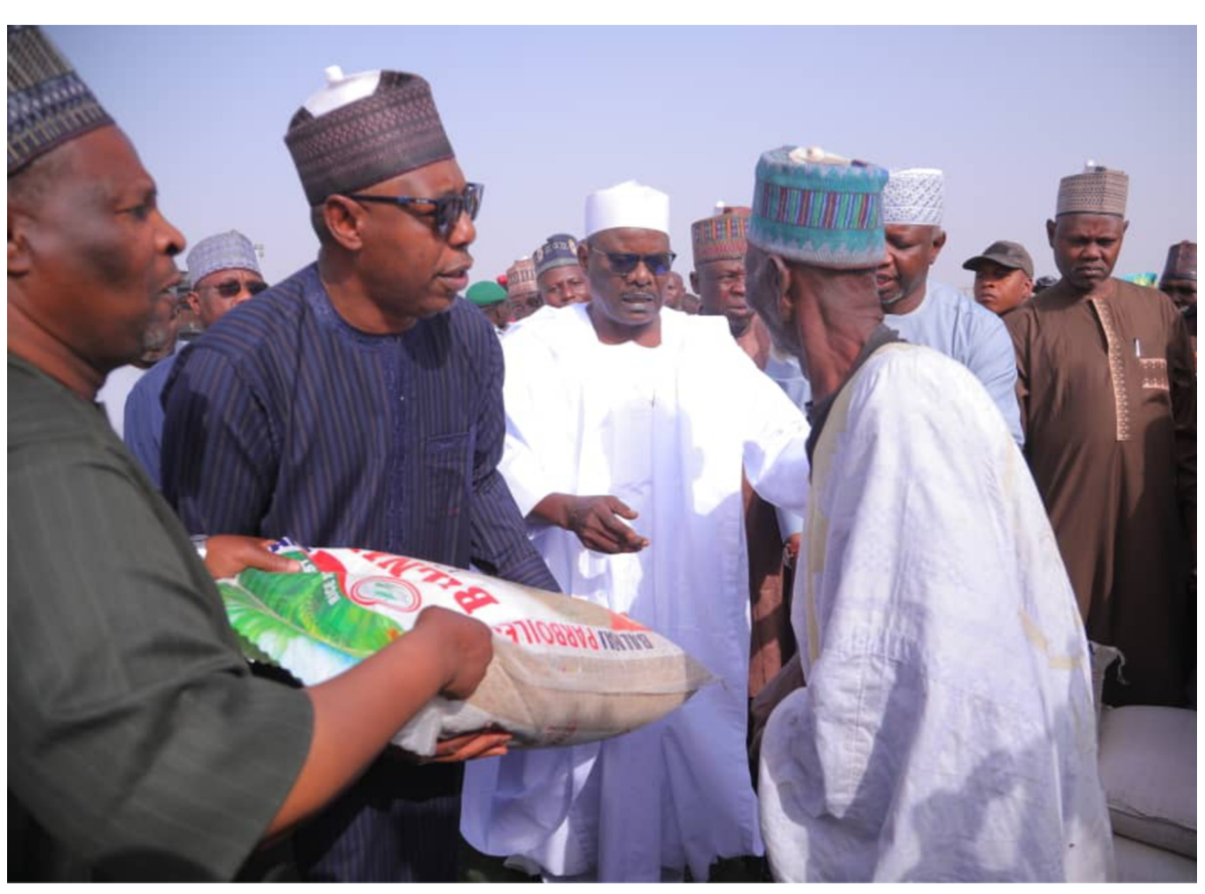
Governor, Babagana Umara Zulum, supervised the distribution of food aid to over 52,500 families

Delta Killings: Angry Soldiers Allegedly React, Burn Down Several Houses In Delta P.3