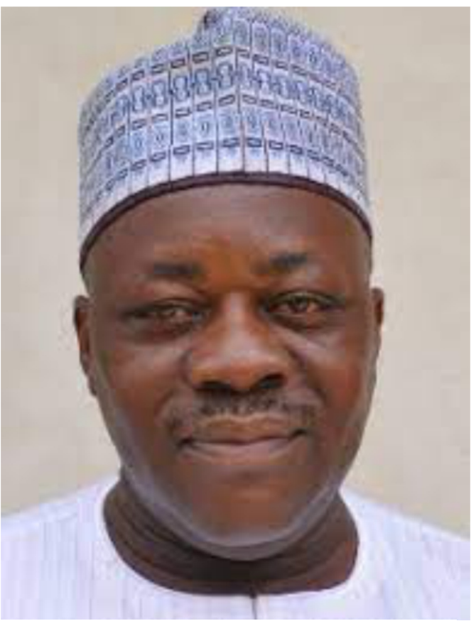
Prof Jibrin Ibrahim

This is where it becomes very disturbing, because they are aware of the criminal the allocation of projects to their nature of their acts, cover up is their constituencies, the practice has been to do approach and they are ready to deny duly