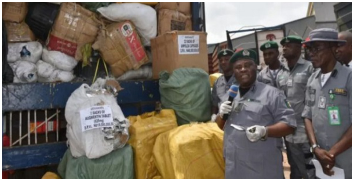
Oyo/Osun Customs Area Comptroller at the Press briefing in Ibadan