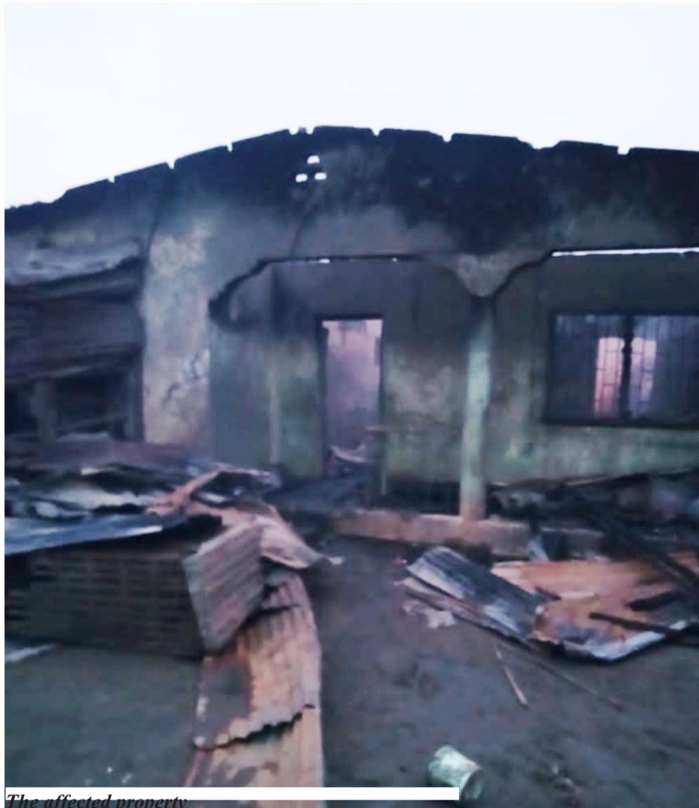
The affected property

"It was reported that the fire was caused by a candle that was lit which later melted in one of the rooms. The room caught fire and it spread to the other 10 rooms in the compound. as