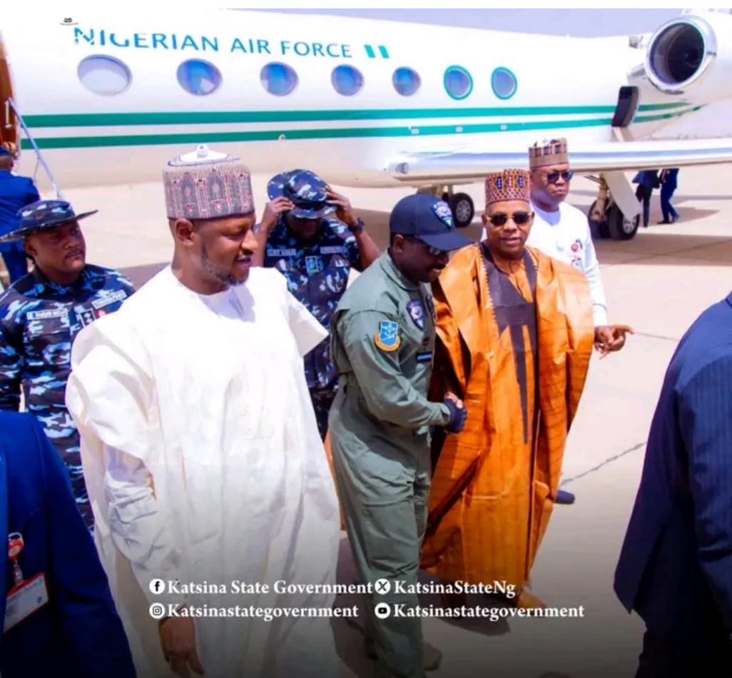
📍 Katsina State Government 📍 KatsinaStateNg © Katsinastategovernment 📍 Katsinastategovernment