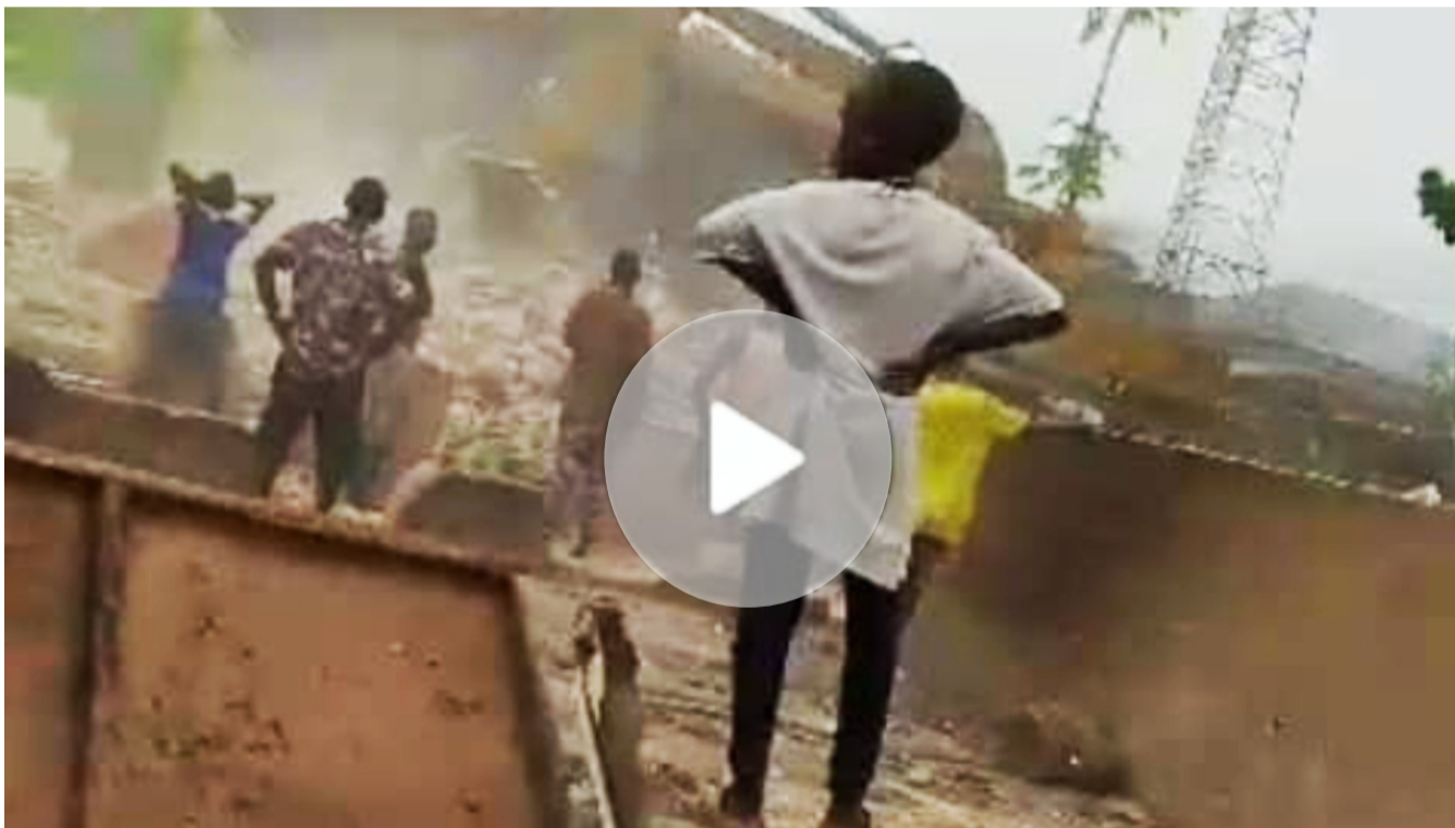
Victims watching the demolition in amazement