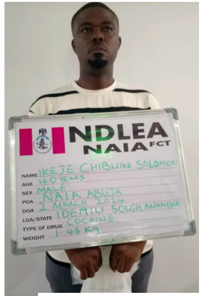
The Vietnam bound nabbed by NDLEA

Some of them include: WADA sensitisation lecture for students and teachers of Fobin Primary and Secondary School, Idiroko, Seme, Lagos; Army Barracks Grammar School, Mokola, Ibadan, Oyo state; State Model Secondary School, Awka, Anambra state; Government Girls Secondary School, Okumgba-Ama, Ogoloma, Okrika, Rivers state and leaders and residents of