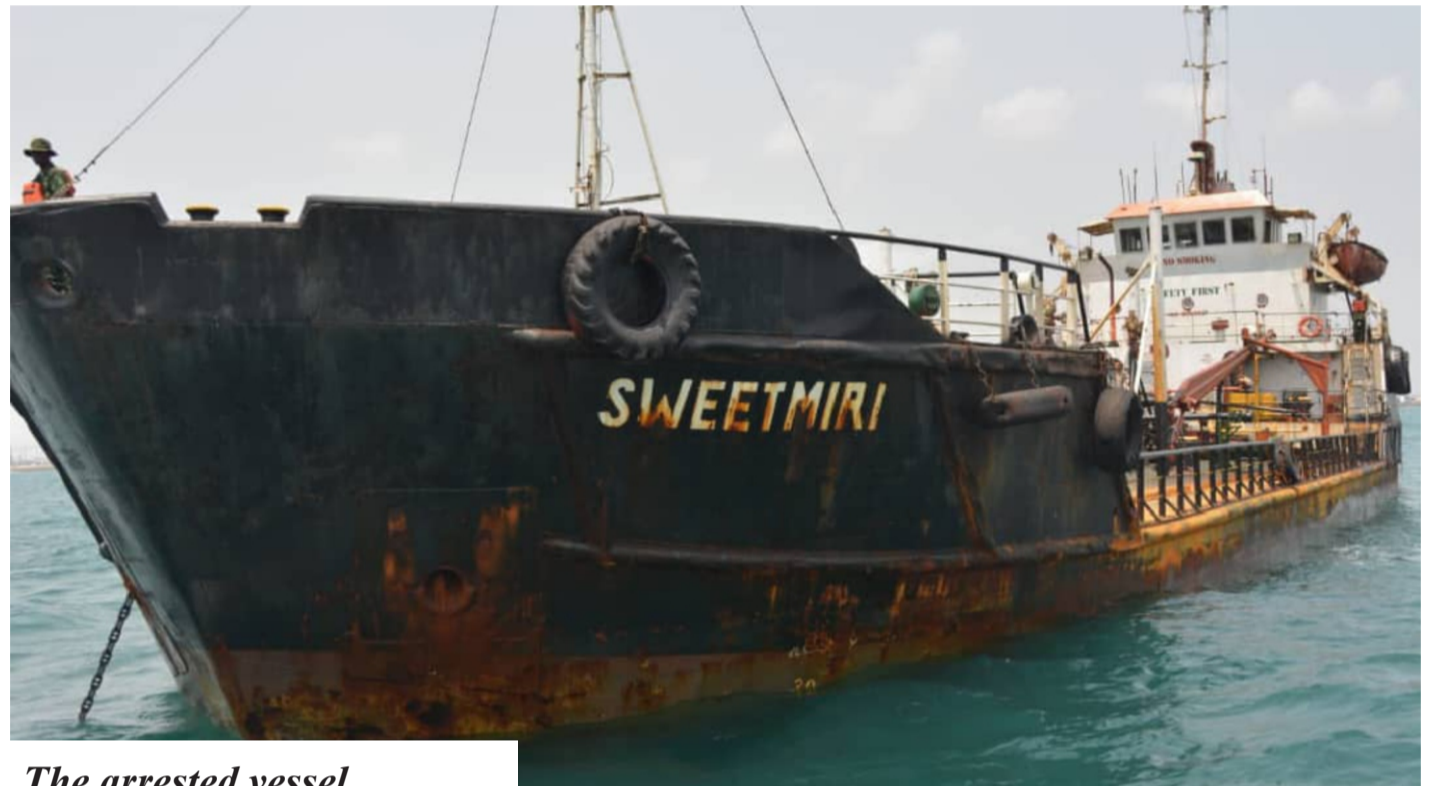
The arrested vessel