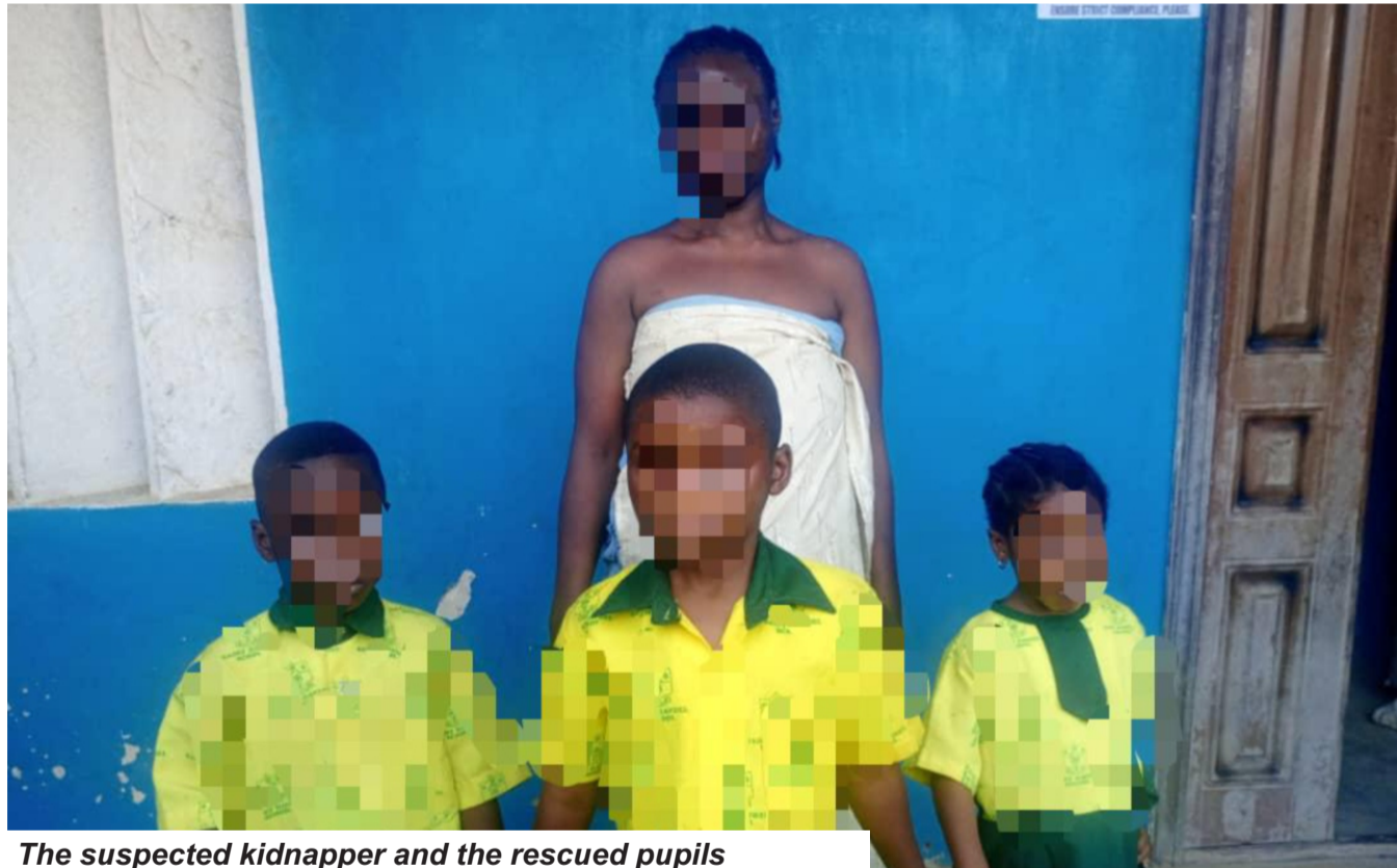
The suspected kidnapper and the rescued pupils

"I therefore, call on us to endeavour to be steadfast in prayers for our country in this holy Month of dawn to dusk fast," he added.