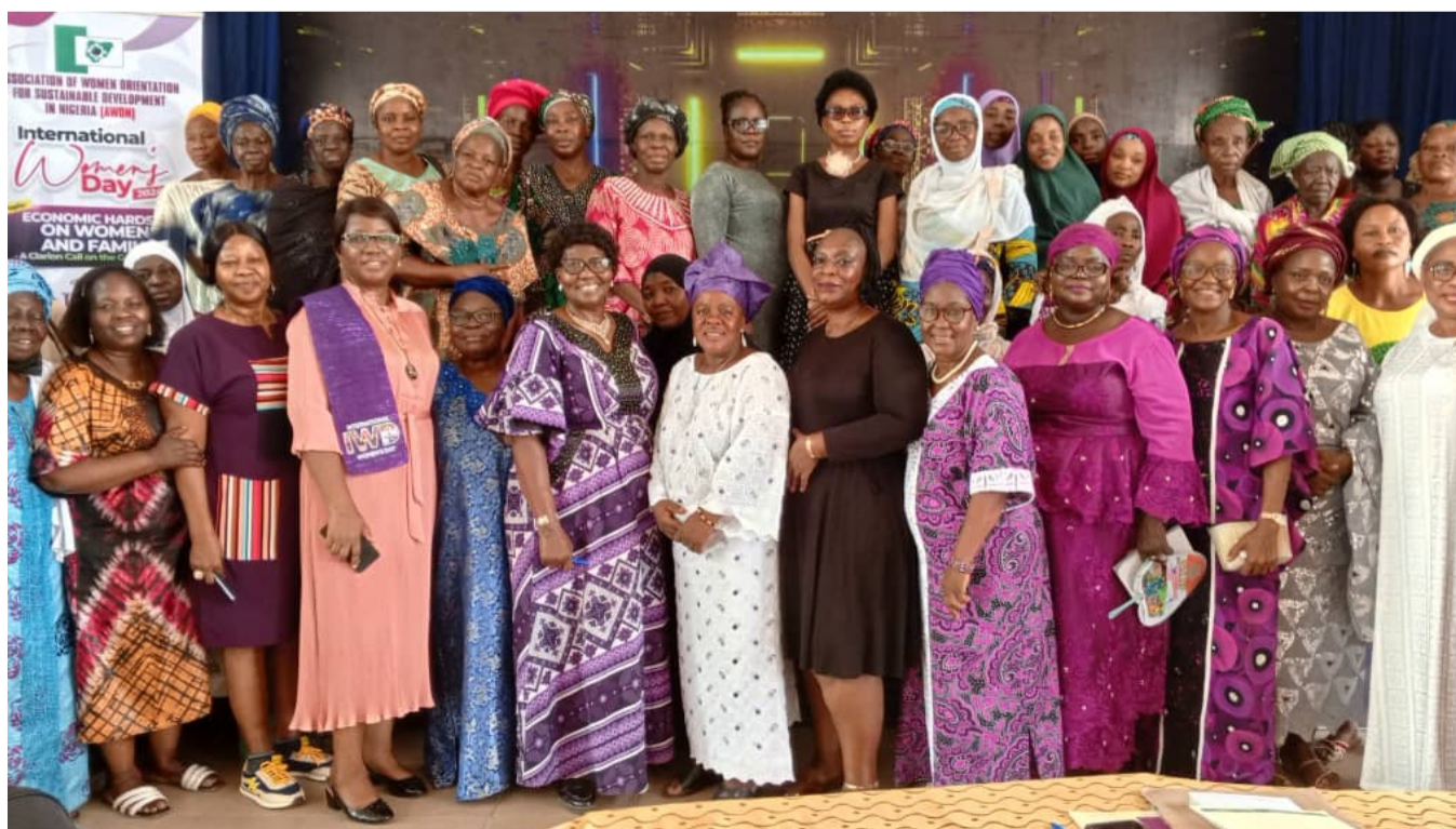
Some of the participants of the AWON event in a group photograph