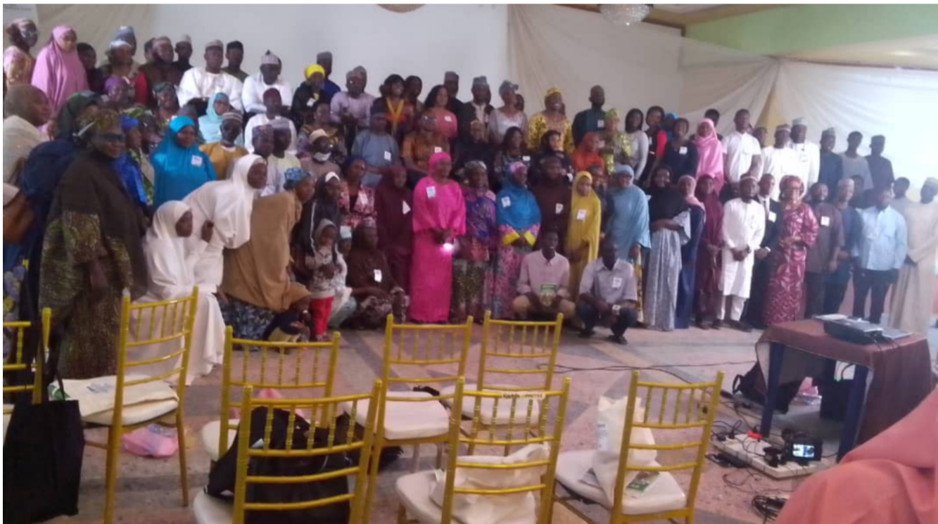
Oyo NSCDC Arrests 72-yr Old, 6 Others Over Alleged Harmful Traditional Practices, Defilement, Others

The study, which will capture 2100 in-school children and 1,700 out-of-school children, will be conducted in North Central (Abuja), North West (Kano), Southwest (Lagos) and South South (Port Harcourt)