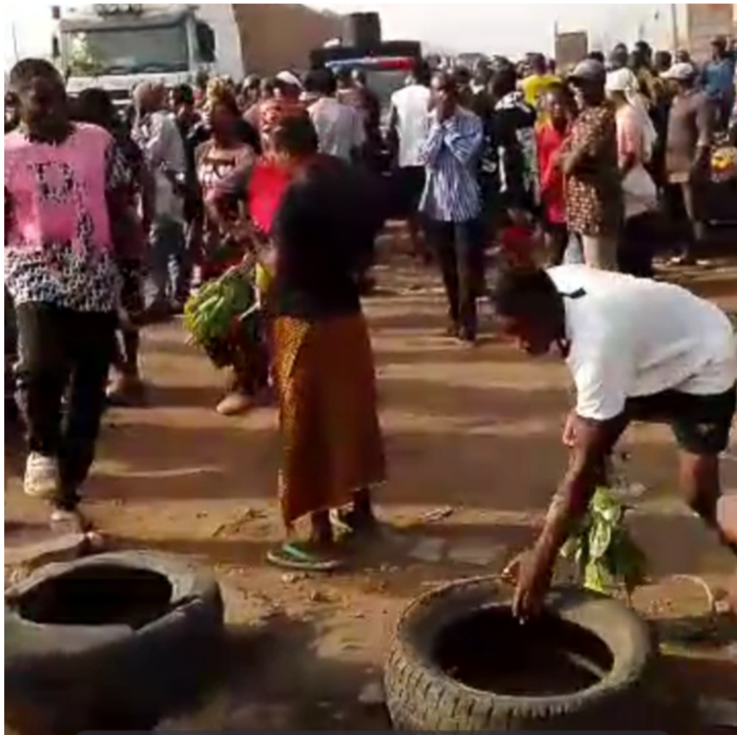
Residents of Gonin Gora in Chikun LGA, Kaduna State, members of the community occupied and blocked the Abuja-Kaduna highway yesterday.

*Govt clears highway, warns against blockade