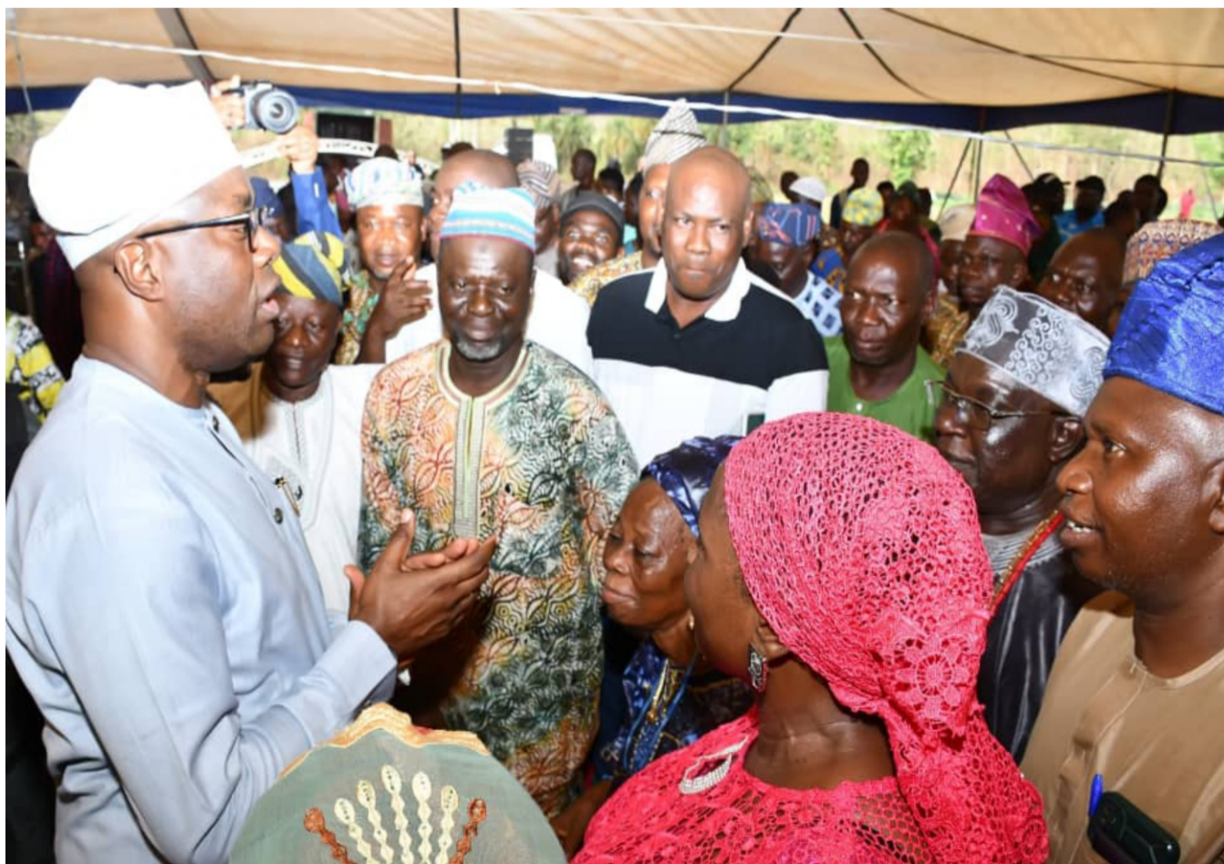
Governor Makinde at the meeting

He however, called on intending developers to ensure they get approval from the ministry before erecting structures to avoid being demolished. Similarly, containers were removed at water works axis of Abakaliki metropolis after repeated notice and warnings to that effect from government to the owners fell on deaf ears.