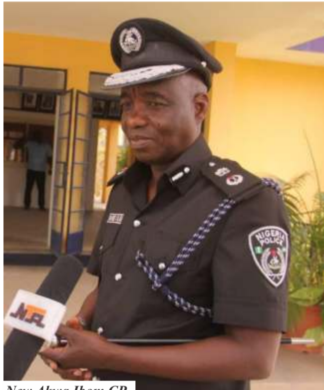
New Akwa Ibom CP

"I promise that under my watch, I will be hard on deviants within the fold of the State Command who continually bring us into disrepute and pitch us against the citizens we are paid to serve and protect. Such elements are encouraged to embrace the