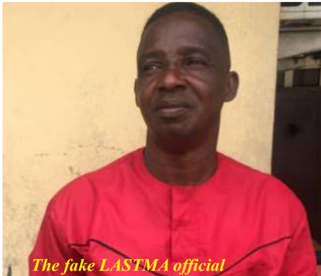
The fake LASTMA official

I Make Average Of N250,000 Per Week From Impounded Truck Owners - Fake LASTMA Official