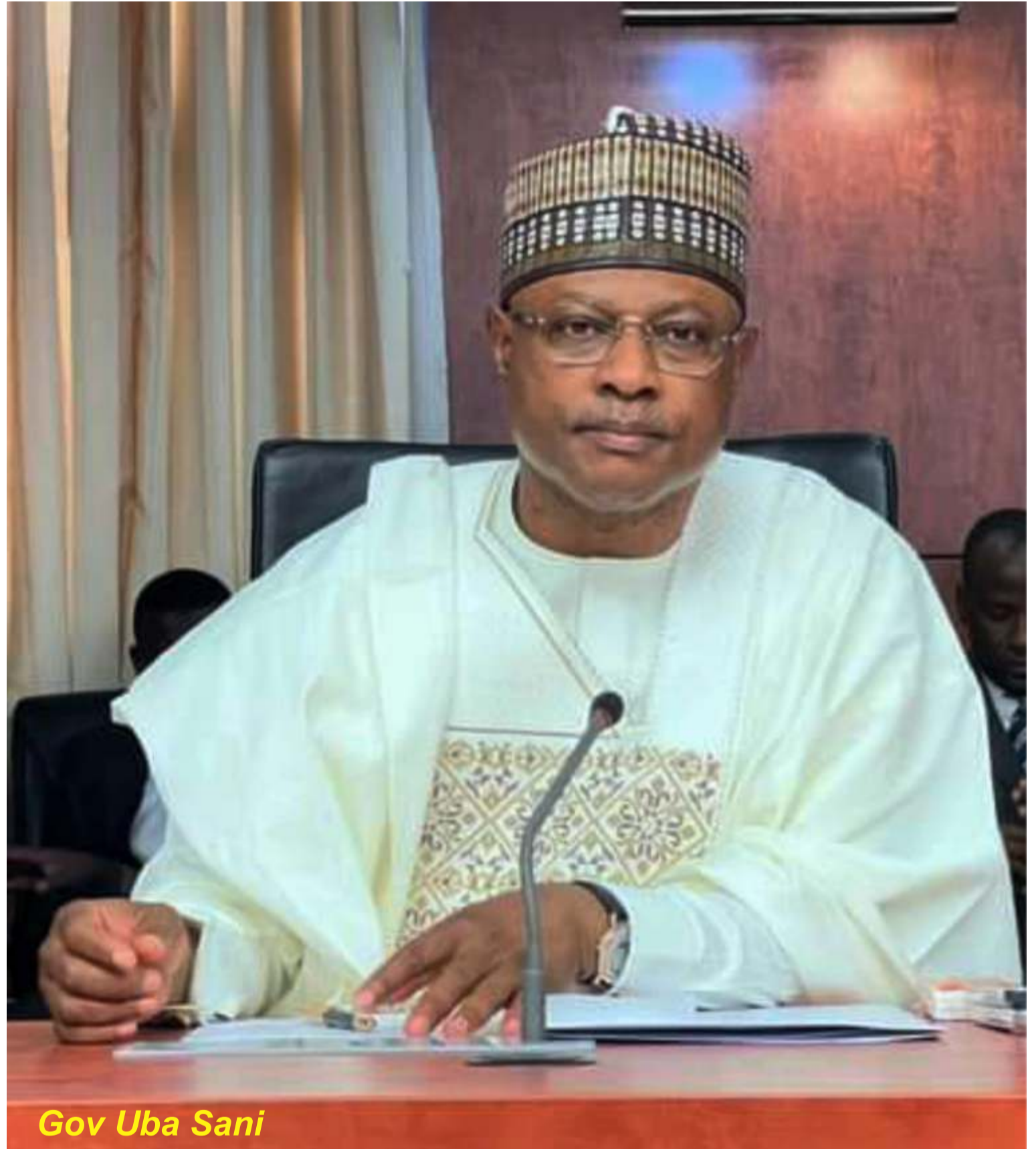
Gov Uba Sani

These unimpressive performances were evident especially in key sub-sectors with allocations above N10 billion. Note the public financial management prescribed benchmark for the first, second, third and fourth quarters are 25%, 50%, 75% and 100% performance respectively. Using this bench, the acceptable full-year performance should not be below 85%. A look at some of these key sub-sectors show that the Ministry of Education had 55.0%, Ministry of Health had 58.8%, Ministry of Public Works & Infrastructure had 56.2%, Ministry of Internal Security & Home Affairs had 66.4%, State Assembly had 39.6%, Ministry of Finance had 74.0%, Ministry of Housing & Urban Development had 68.0%, and Metropolitan Authorities had 77.7%. Above you will observe that despite the State government meeting of the benchmark allocations for education