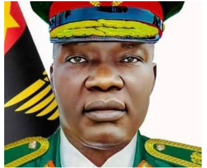
Lt.-General Taoreed Lagbaja

" If the governor could do these, poverty and hunger would be a thing of the past in Oyo state and the Pacesetter state would assume its pride of place among the comity of states in the world".