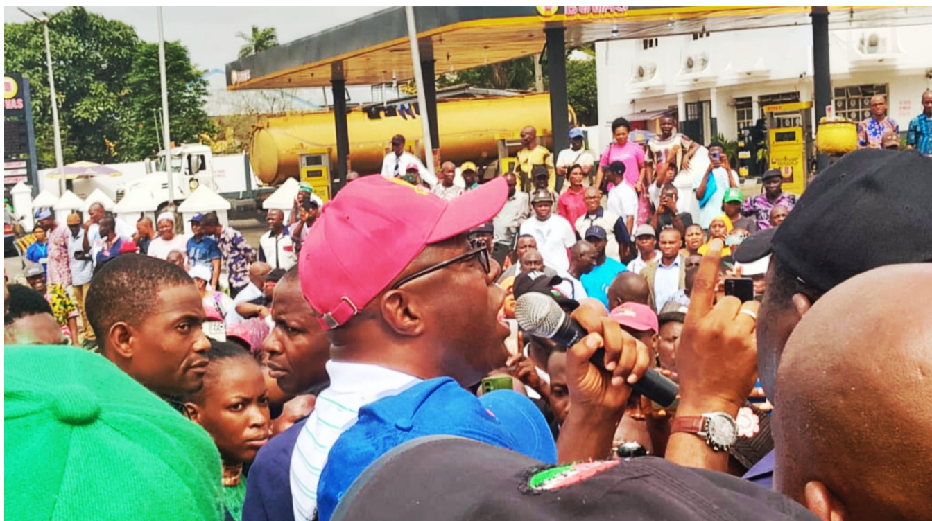
Gov Makinde addressing workers during the protests in Ibadan yesterday

Over 600 papers would be presented by both national and international scholars during the three-day conference.