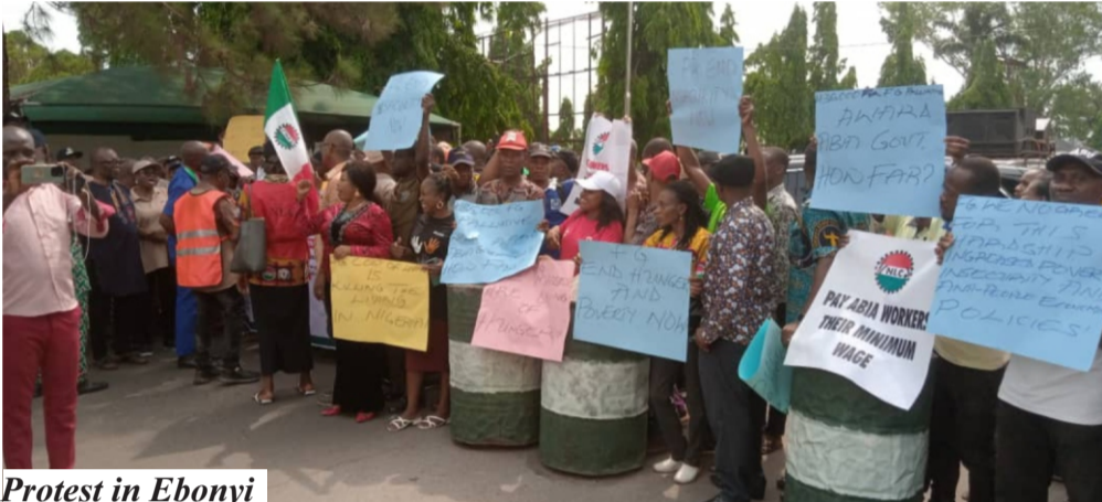
Protest in Ebonyi