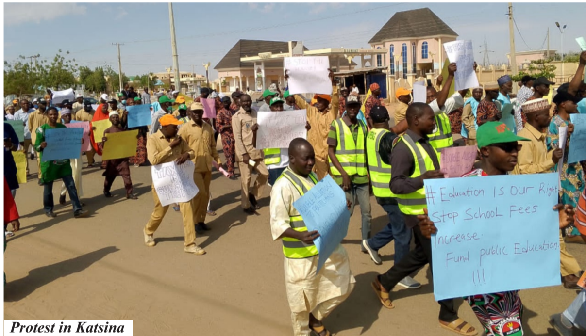
Protest in Katsina

The discussions centred on strategies and measures to guarantee a safe and orderly protest while upholding the rights of all