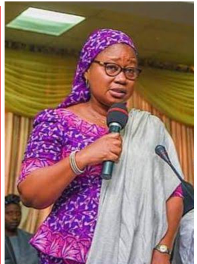
Adamawa Deputy Governor