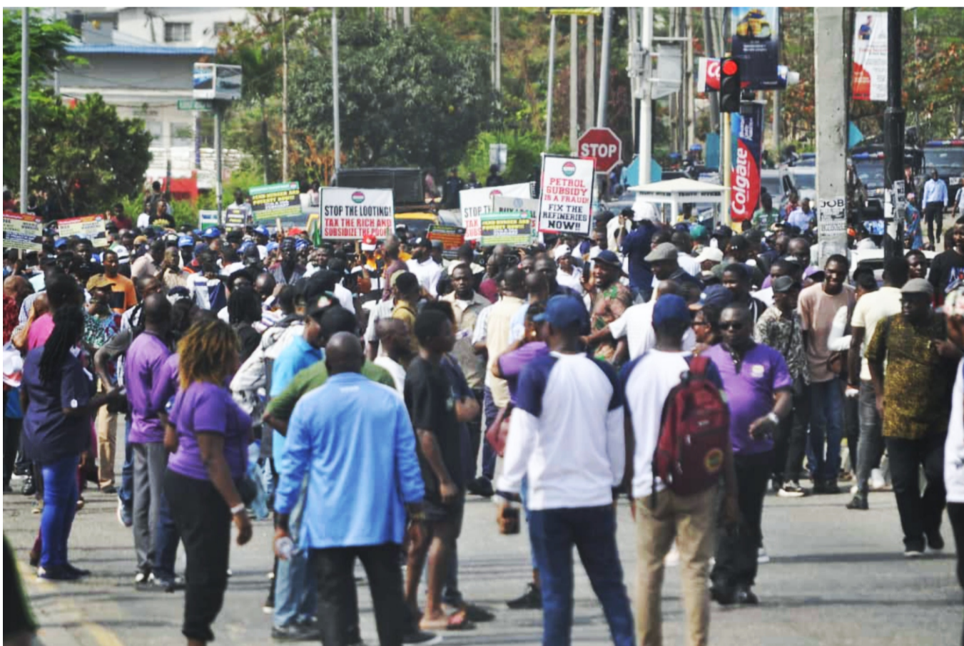
NLC protest in Lagos. February 27, 2024.

Consequently, people of the area appreciated the efforts being made by Governor Dikko Umaru Radda in the fight against terrorism and they further solicited for the deployment of security agents to the village as well as reconstruction of the only road leading to the village from Daudawa town of Faskari local