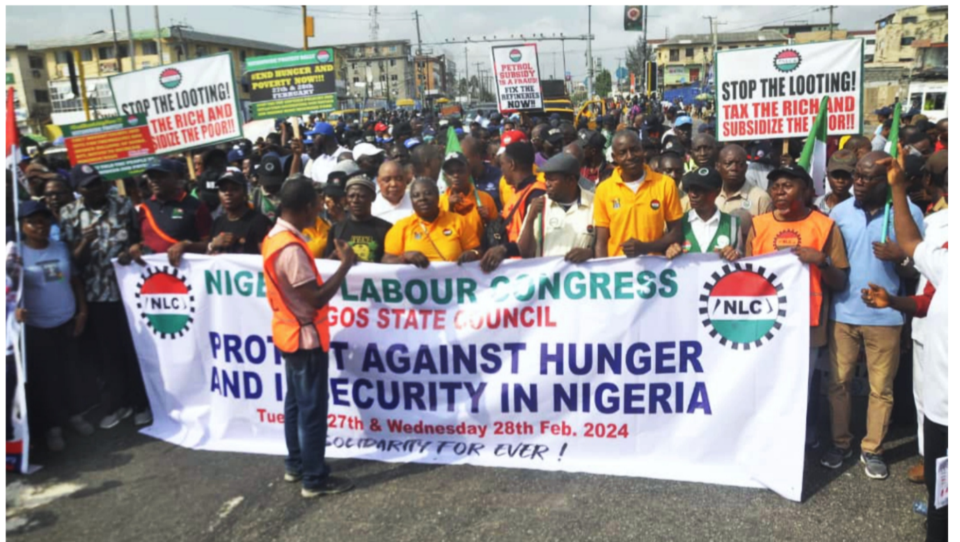
NLC protest in Lagos. February 27, 2024.