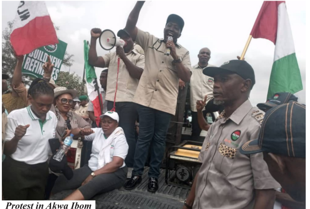
Protest in Akwa Ibom

The protest, was called by the labour unions as a way of expressing the pains