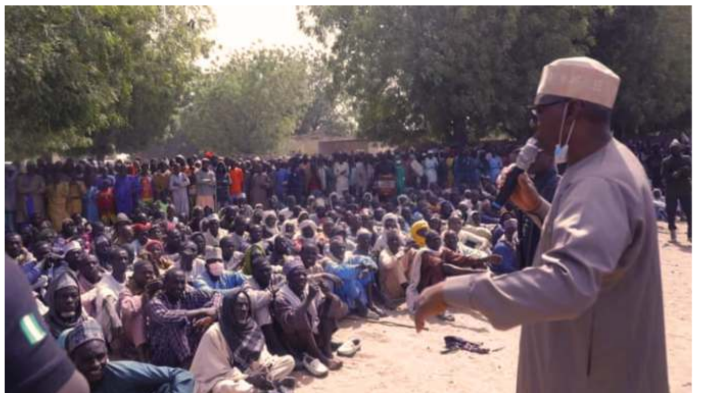
Gov Zulum addressing the IDPs from Niger Republic