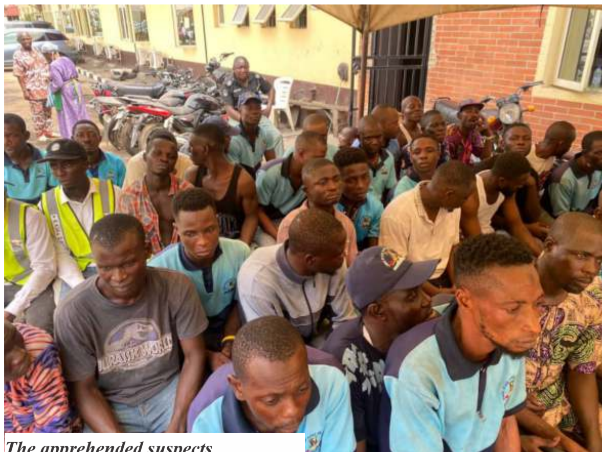
The apprehended suspects

He said the Lagos State Government remains committed to ensuring the safety and efficiency of transportation networks within the State as enshrined in the THEMES PLUS agenda of the present