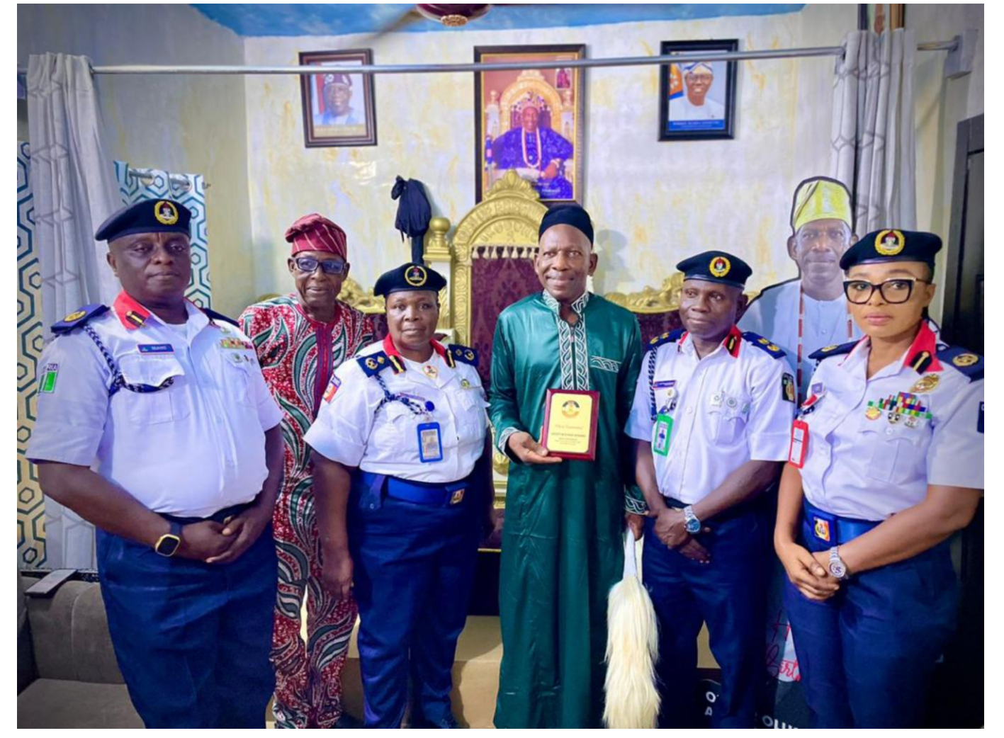
The monarch of Onigbongbo kingdom with the NSCDC Commandant and his entourage