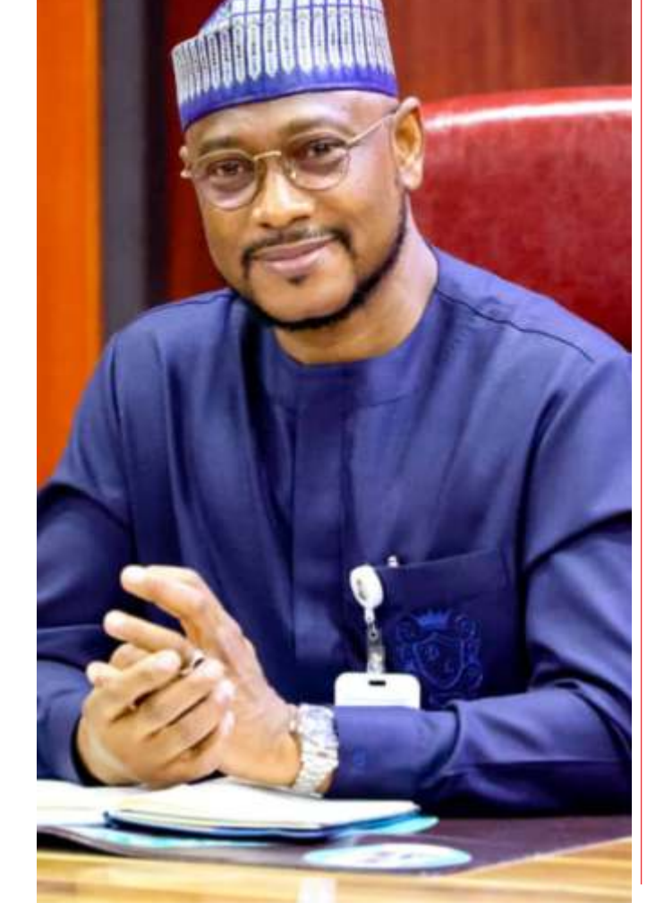
Gov Dauda Lawal

Na'Abba, a Kano-born politician, died on September 27, 2023, in Abuja at the age of 65.