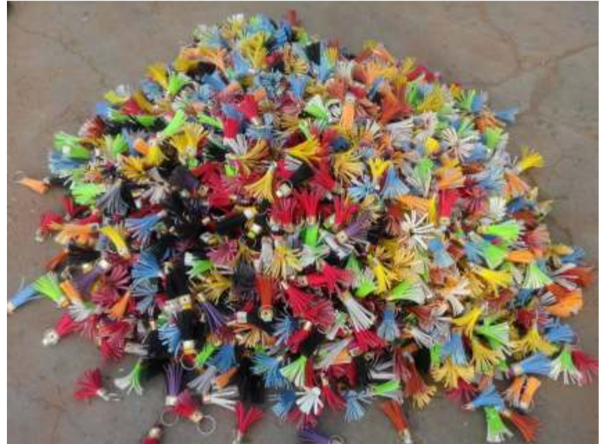
Key holders produced at Kunnawa Majema, Kano State

He called on the federal, states and local government councils to establish vocational training centres for the young generation and other categories of people to develop economic progress, especially nowadays with the growing need to switch to entrepreneurship at all levels.