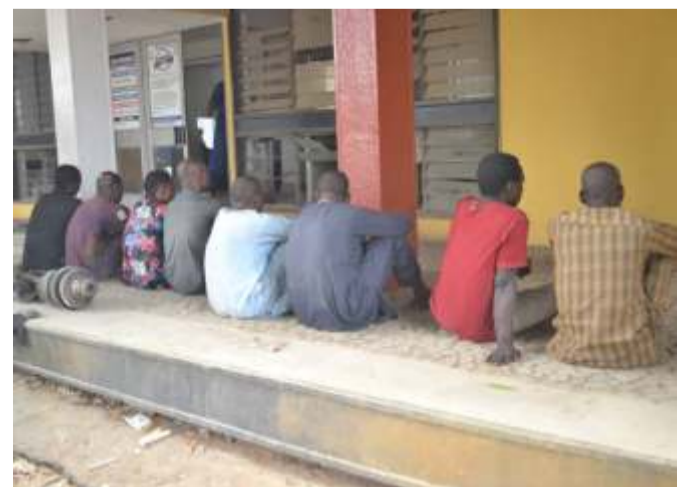
The suspects arrested by Oyo NSCDC

Commandant Padonu then urged members of the public to be vigilant and also ready to provide useful information to NSCDC and other Security agencies so as to collectively fight crime and criminality in the State. The suspects will be arraign in Court after the completion of the investigation.