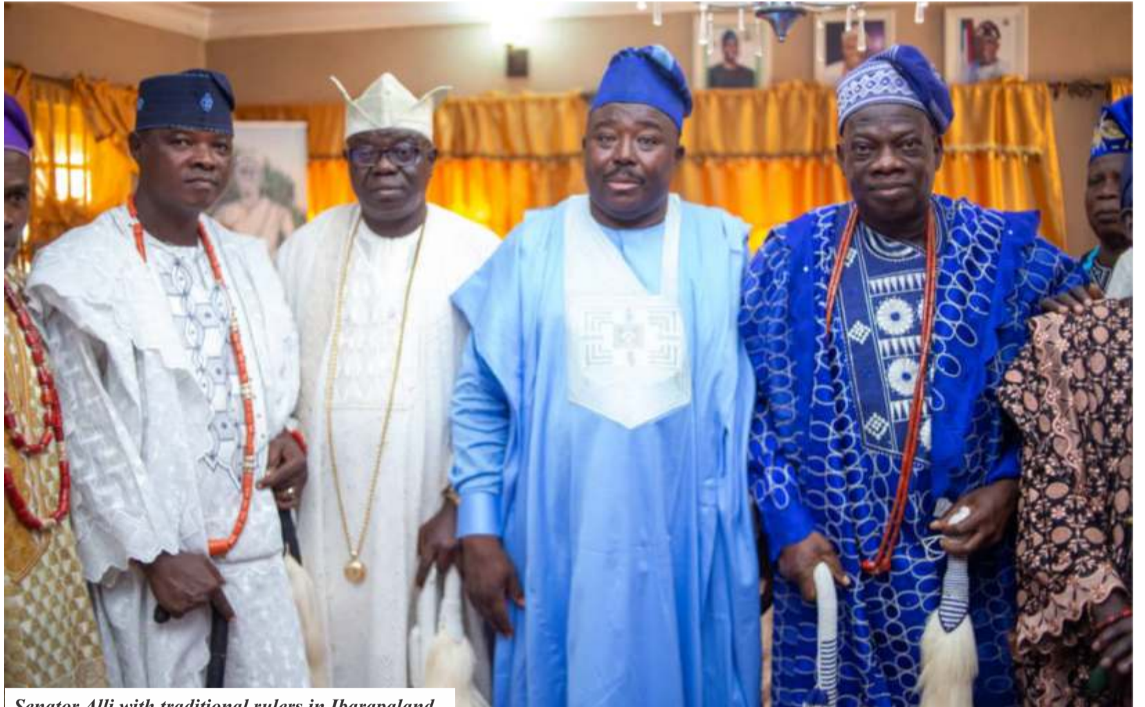
Senator Alli with traditional rulers in Ibarapaland

On infrastructural development of Ibarapaland, Senator Alli hinted that he was working to