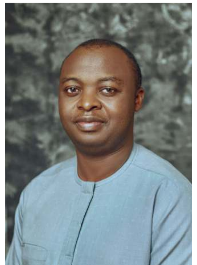
CEO Caleb Danladi Foundation

"The foundation remains dedicated to its mission of empowering, educating, and elevating lives across Nigeria and beyond", he assured.