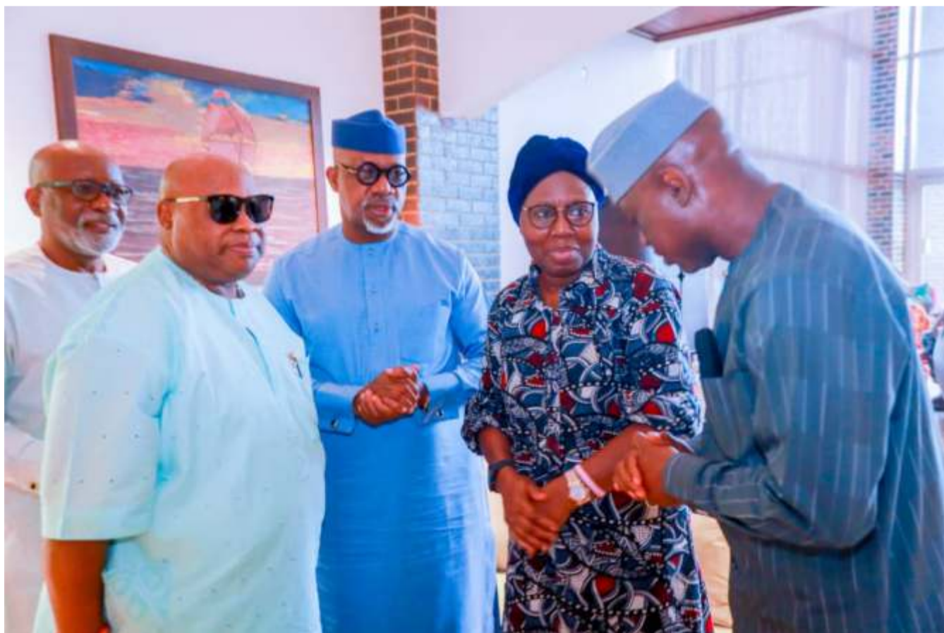
From left: Osun State Governor, Senator Ademola Adeleke, Ogun State Governor, Prince Dapo Abiodun. Widow, Mrs. Betty Akerdolu and Ekiti State Governor Biodun Oyebanji during a condolence visit to late Governor Akerdolu's Ibadan residence last Friday.

Maintaining that as an individual entrepreneur and philanthropist, he would be unfolding some employment opportunities as well as wealth-creation and capacity - building programmes to help engage Nigerian youths and women in this new year, he said, "it is all part of the effort to reduce the level of poverty and suffering amongst our people. We did some interventions during the Yuletide, we will continue to reach out and support people, as our God blesses us. And I pray and believe God that it will be a good year for all of us",