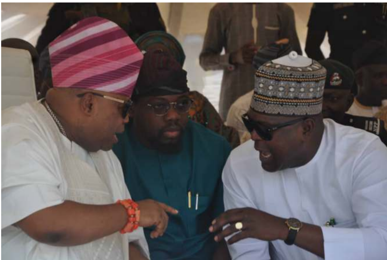
From left: Senator Representing Osun West senatorial District, Senator Lere Oyewunmi, Osun State Deputy Governor, Prince Kola Adewusi and Osun State Governor, Senator Ademola Adeleke @ the 2024 Inter-Religious Prayer to user in 2024 held @ office of the governor, Bola Ige House, Secretariat, Abere Osogbo yesterday.

Advising government to also provide equipment for graduates form these Vocational Centres for them to start on their own business, Ambassador Ajadi noted that the advice if implemented by the government will ensure that many youth are keep off the streets where they have been willing tools in the hands of criminally minded individuals in the country.