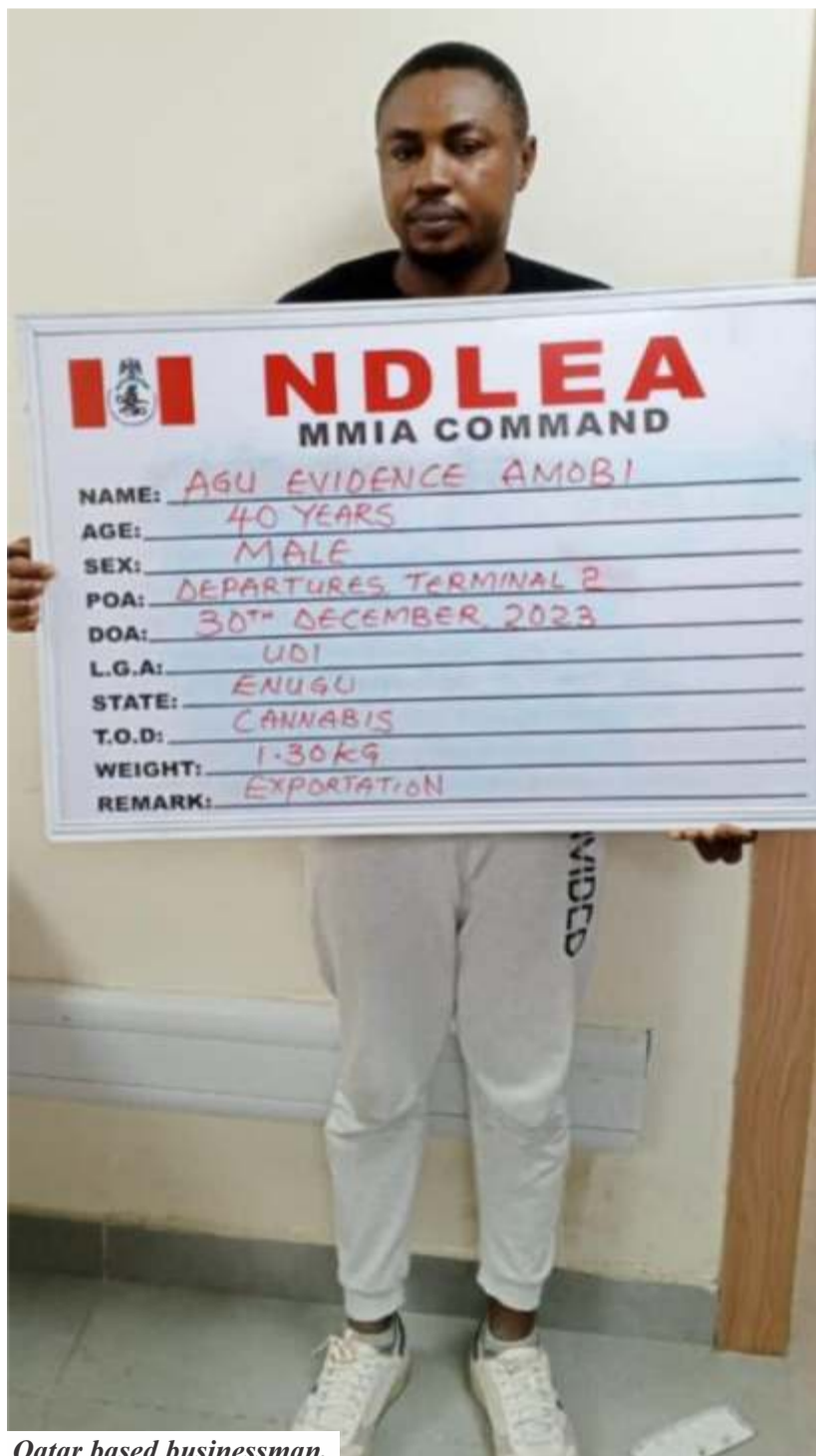
Qatar based businessman.

arrested at Unguwa Ukku area of Kano on Sunday 24th December with 49 blocks of cannabis weighing 42.6kg, Umar Abdullahi, 27, was nabbed with 27, 350 pills of opioids at Gadar Tamburawa area of the city same day.