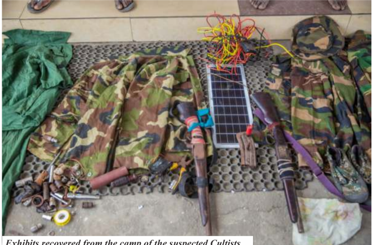
Exhibits recovered from the camp of the suspected Cultists

" Responding swiftly, the police chased the criminals out of town. However, the defiant 'General' rallied his gang and launched an attack on a community-owned tank farm in Oderereke, intending to loot its contents. It was during this sabotage attempt