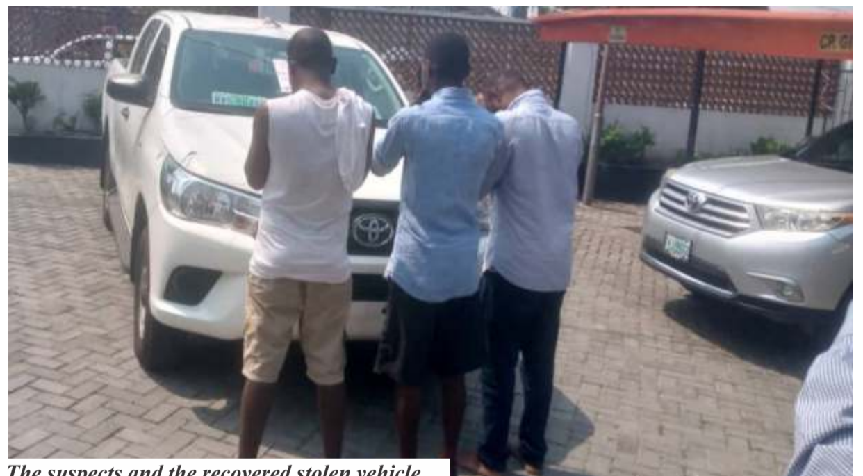
The suspects and the recovered stolen vehicle