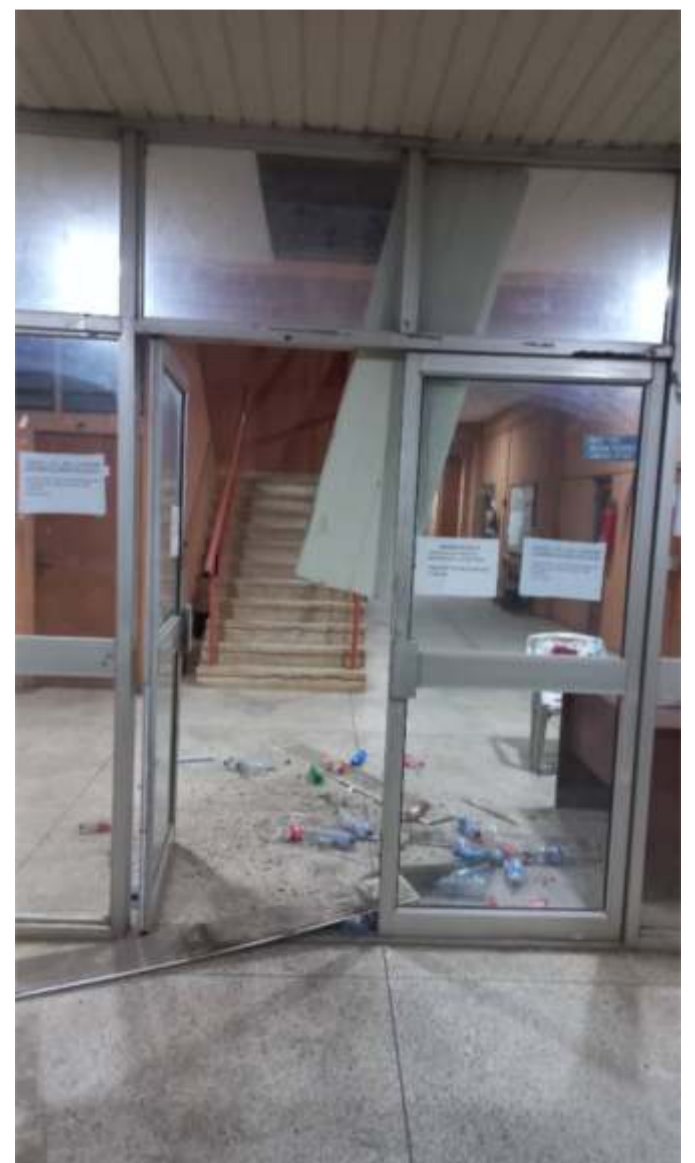
An office complex affected

this mindless spending through cronies such as New Planet Projects Limited, a company controlled by the family of Dr. Bunmi Tunji Ojo, the Minister of Interior undermines whatever little confidence Nigerians may have had in the present government, and therefore brings to the fore the urgent need for more rigorous budgetary oversights by the National Assembly, which has from day one begun to exhibit all the symptoms of a rubber stamp parliament that abdicates its oversight functions when most needed," the statement explained.