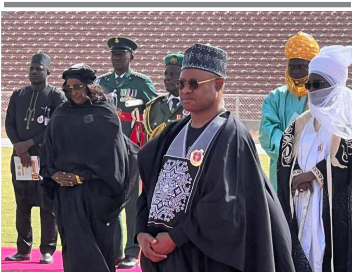
Governor Uba Sani at the wreath-laying ceremony at the Ahmadu Bello Stadium in commemoration of the 2024 Armed Forces Remembrance Day yesterday

2000 Households Captured As Lere Reps Member Shares Food Items To Constituents