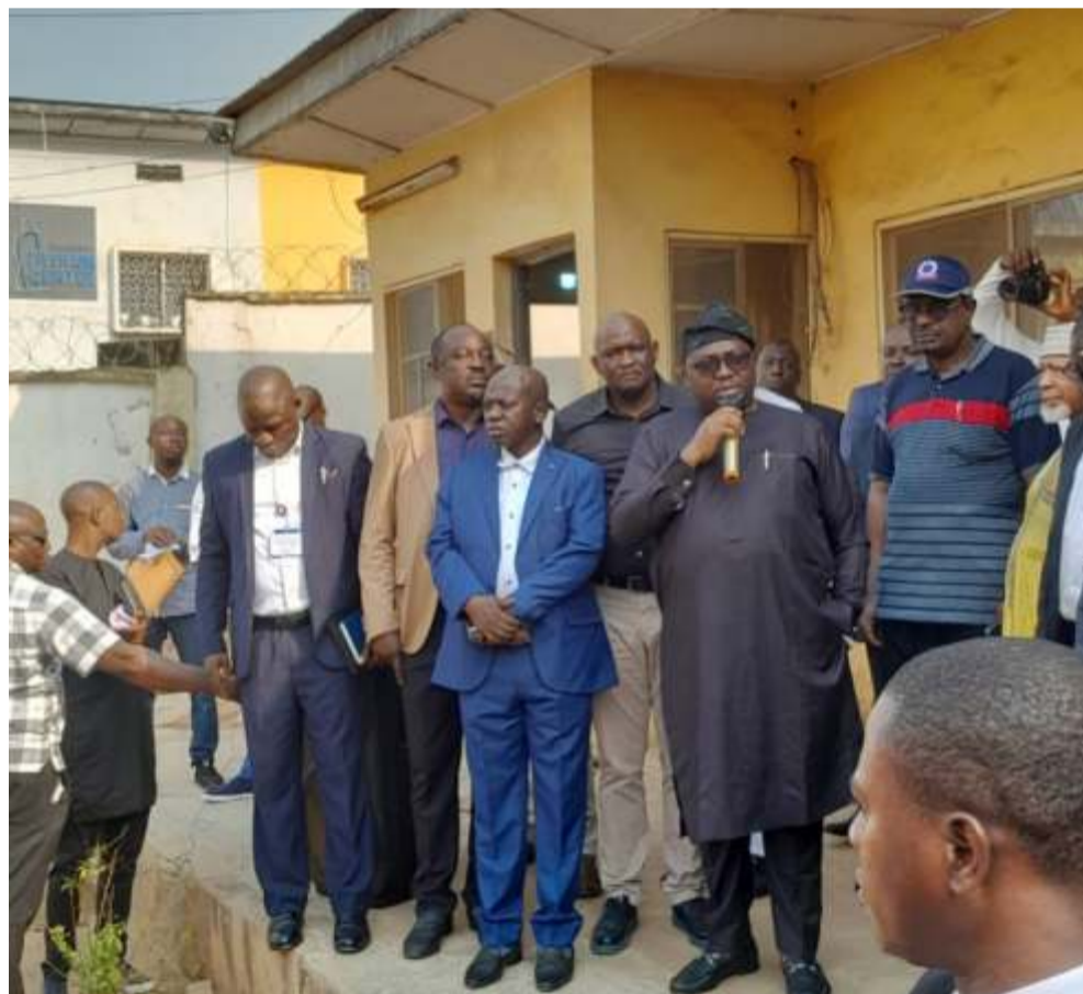
Minister of Power Chief Adebayo Adelabu addressing staff of Ayede sub Power station in Ibadan on Monday

"Some saboteurs are not happy that we are improving supply, they are