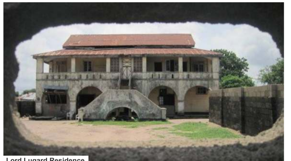
Lord Lugard Residence