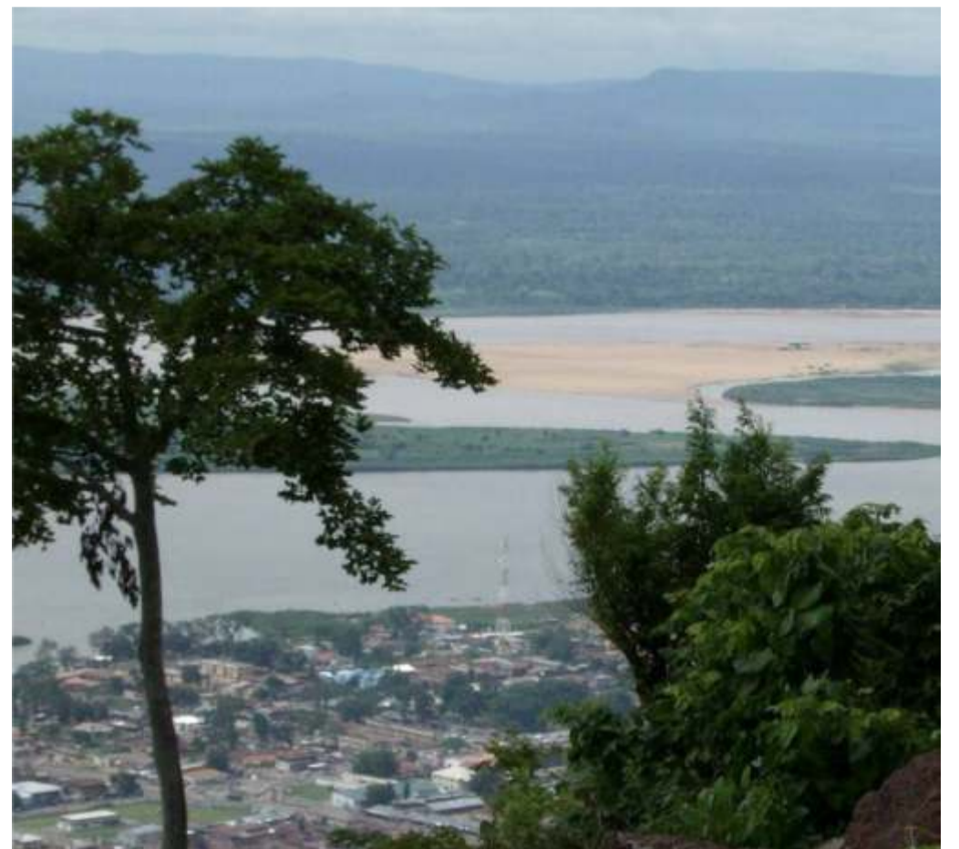
Confluence of Rivers Niger and Benue in Lokoja