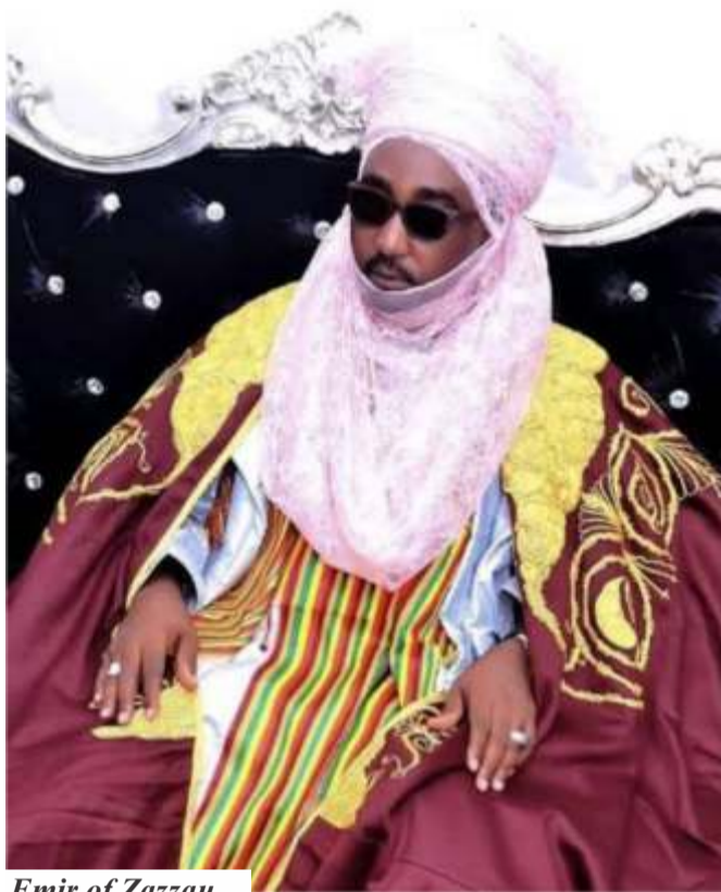
Emir of Zazzau

According to him, when youth are engaged fully, the issues of drug abuse