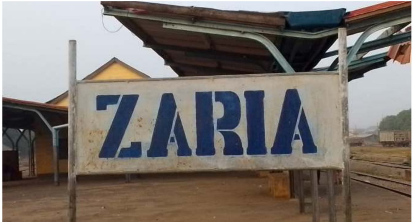
Zaria Train Station

Saturday morning. The Kano-Lagos train service is very important for conveyance of cargo to the Kaduna, Kano and Funtua dry ports. Besides this, Kauran