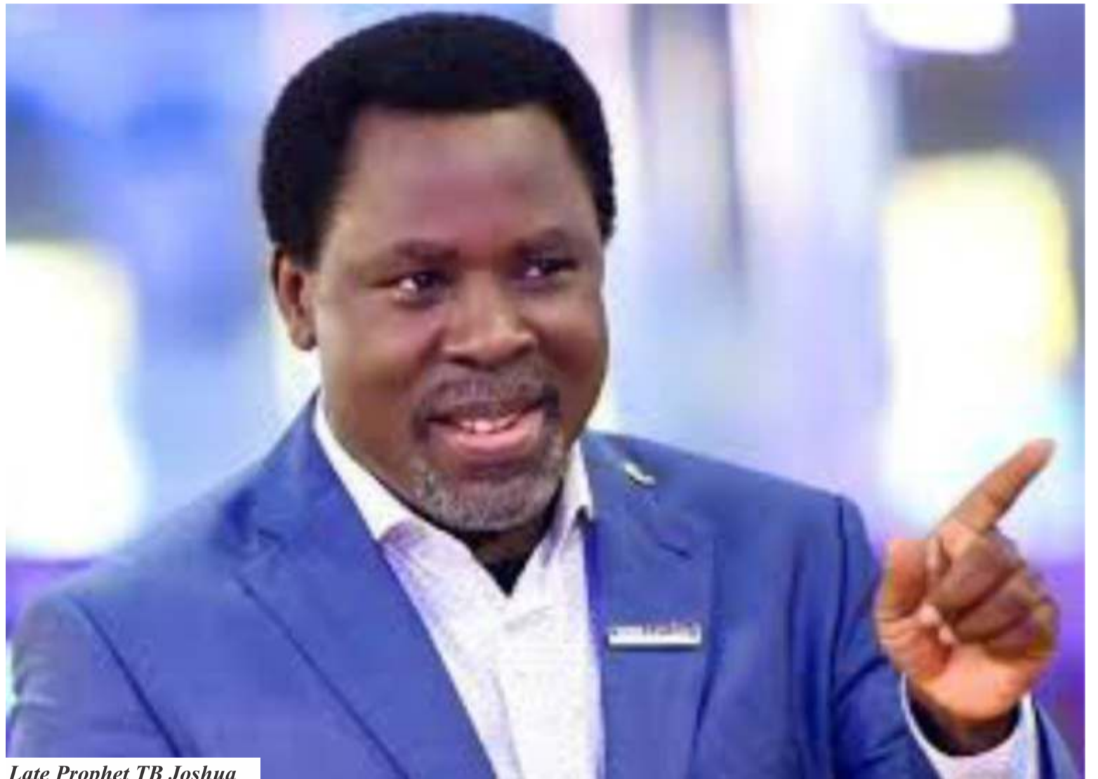
Late Prophet TB Joshua

Given a critical look at the documentary by the BBC and VOA, I was made to realize that, there was no place of fairness and other ethical issues, hence I