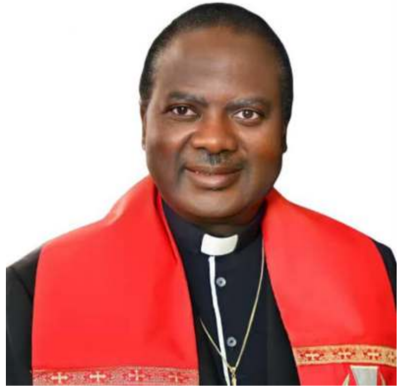
Baptist Convention President

"Consequently, discipleship is a privilege that Christians learn from Jesus Christ, it is a privilege that comes with responsibility to go and make disciples," he said.