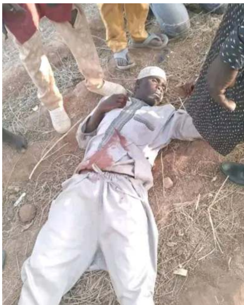
Remains of the Islamic cleric