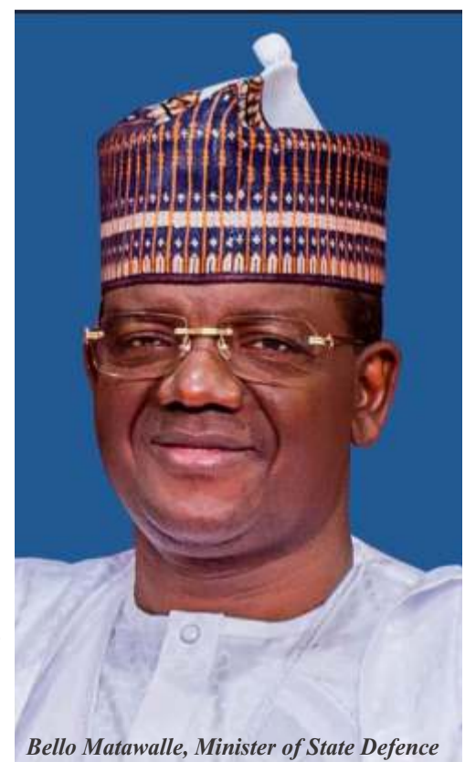
Bello Matawalle, Minister of State Defence

He added that what the present administration needs at this point in time, "is a collective effort towards rebuilding Nigeria of our dream".