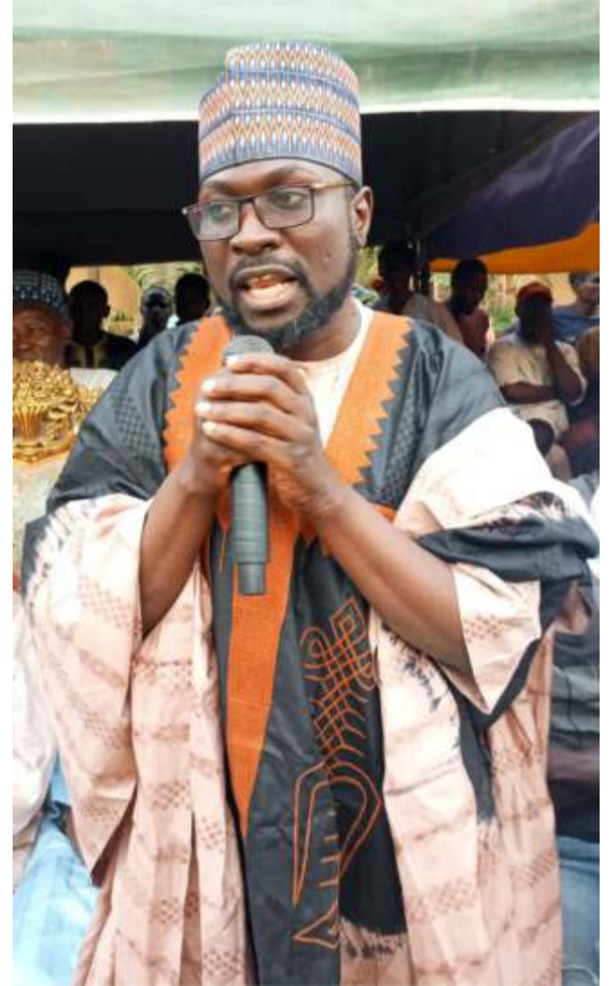
Honourable Aliyu Bello

Badaru stated that the terms of reference included ensuring the equipment for the installation of the security surveillance system meets the technical specification as well as suggesting any other measure necessary for the successful implementation of the system.