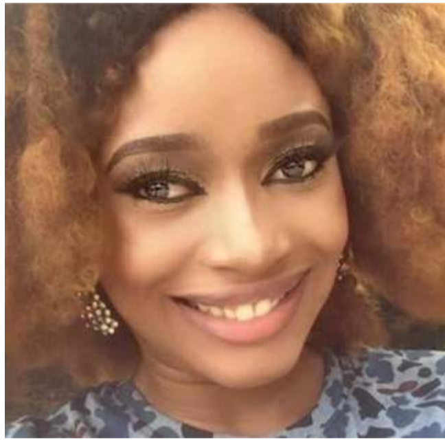
The ex beauty queen declared wanted by NDLEA