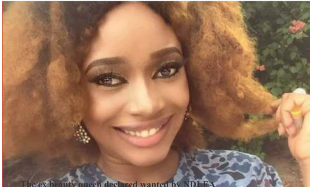
The ex beauty queen declared wanted by NDLEA