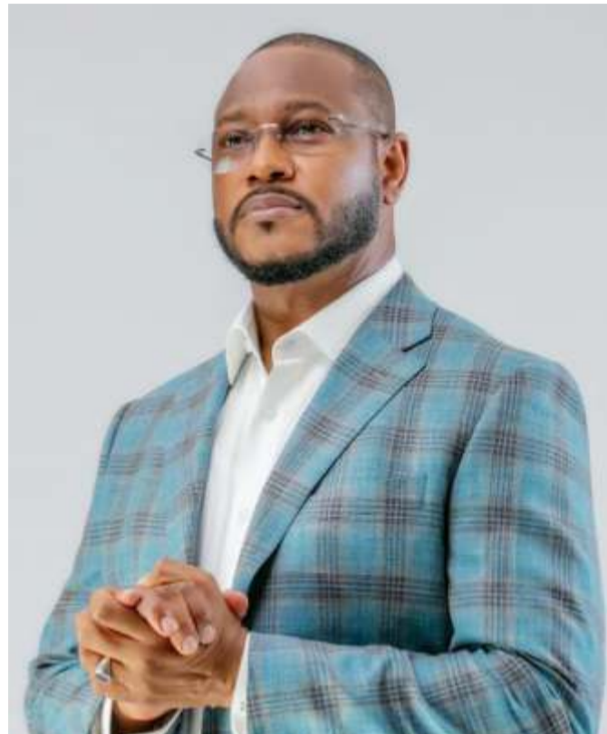
Gov Dauda Lawal, Zamfara Governor

"The payment of the 13th-month salary is just one of