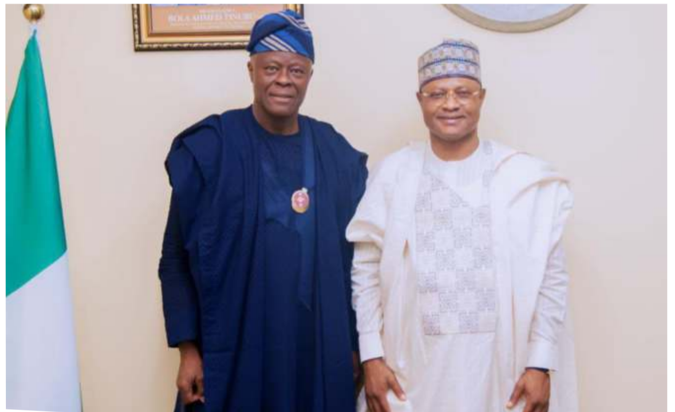
Governor Uba Sani (right) with the Minister of Finance during the visit.

"We shall work with the Honourable Minister as we ramp up the implementation of measures geared towards bringing succour to the distressed people of Tudun Biri Community," he said.