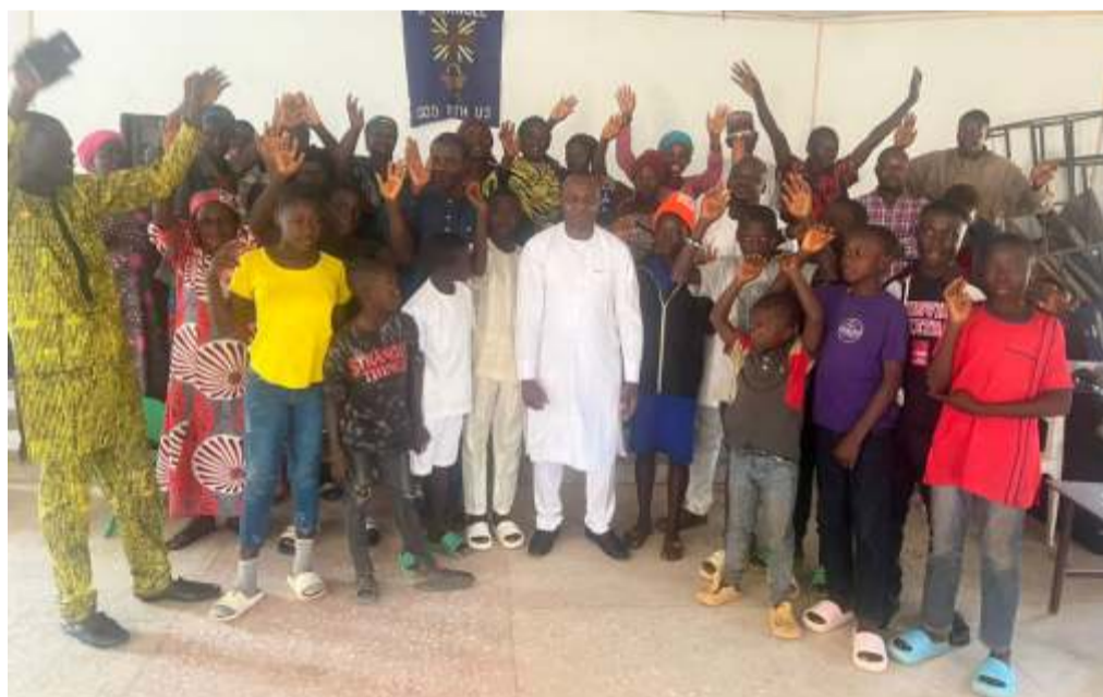
Caleb Danladi Foundation beneficiaries in Kaduna.

As the festive season unfolds, these initiatives stand as shining examples of how a foundation's commitment to uplifting lives can create a lasting positive impact on communities.