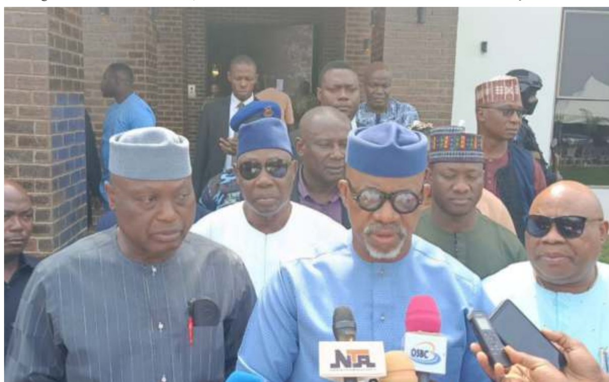
Gov Dapo Abiodun in an interview with journalists in Ibadan during South West Governors Forum visit to late Gov Akeredolu's residence in Ibadan

"Collectively, we will be partially, majorly responsible for the funeral rite in according him the farewell that he deserves. We will work with the family to give him a deserving farewell. We have spoken with the family. We will be setting up a joint committee of Southwest states to work with the family and the government of Ondo State to make sure we give him a deserving farewell".