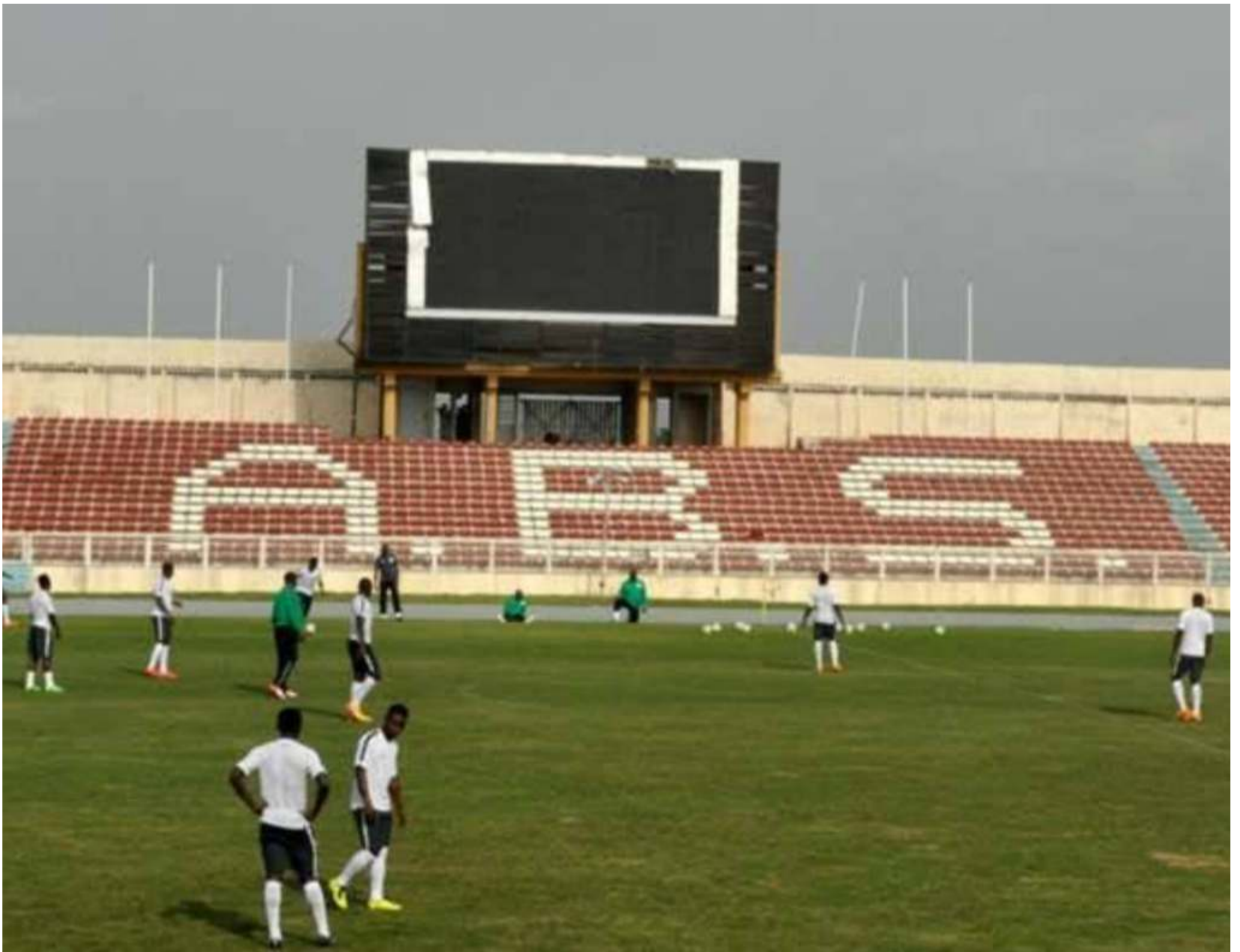
Ahmadu Bello Stadium