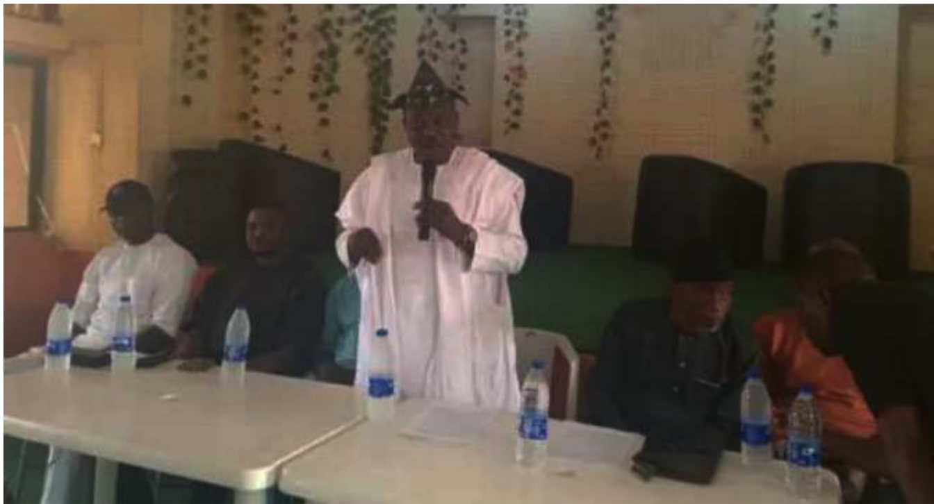
Yoruba Regional Alliance members at the Press conference in Ibadan

"Going back to the Ibadan explosion, and the unlikely explanation that licensed miners were stockpiling explosives needed for their work. What kind of mining requires you to use an incendiary device that could level a whole neighborhood? Why would such explosives be stored or kept in a residential area?"