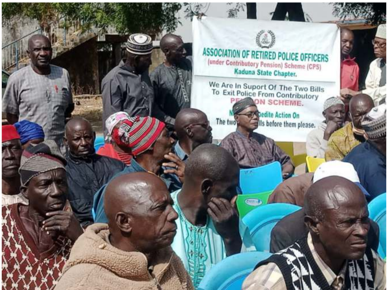
Members of the Association of Retired Police Officers during a Press Conference yesterday

Work In Synergy, Gombe Min Of Education Charges AGILE Project For Successful Projects Implementation