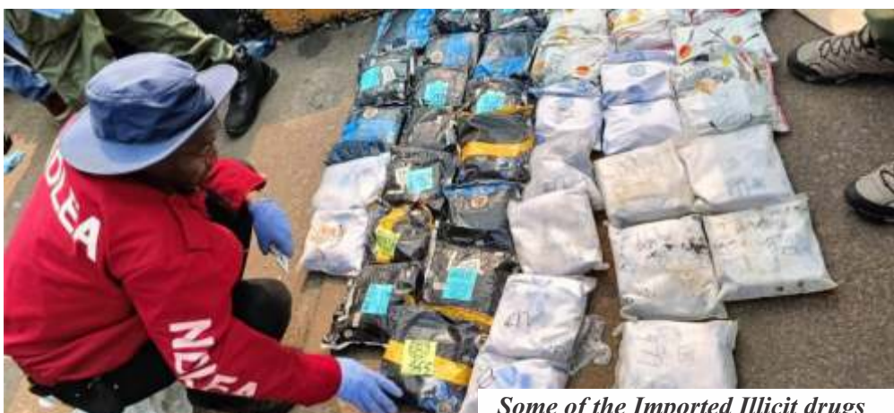
Some of the Imported Illicit drugs