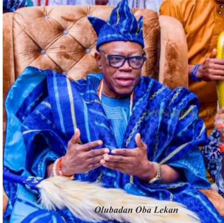
Olubadan Oba Lekan

Commiserating with the deceased families with a prayer that the Almighty God would comfort them and grant the departed peaceful repose of their souls, the Olubadan wished the injured quick recovery just as he urged the people to remain calm and obey safety precautions' directive as may be given by the security agents.