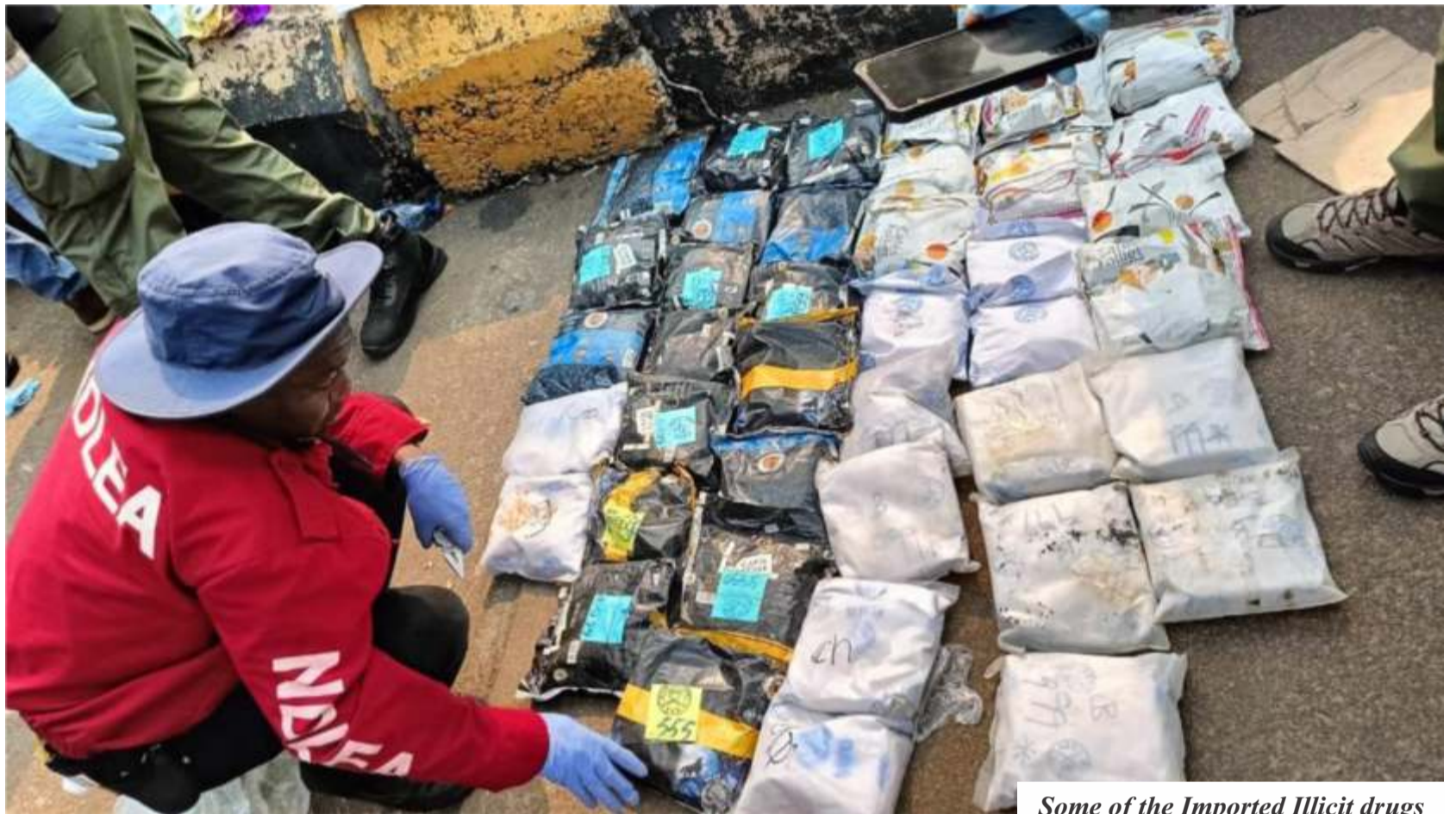
Some of the Imported Illicit drugs

Babafemi disclosed that some of the items recovered from the containers include: 1, 274 parcels of Cocaine and Colorado with a total weight of 884.09 kilogrammes; four pistols; 197 rounds of 9mm ammunition, 49 rounds of 7.62mm ammunition, 275 rounds of 5.56mm ammunition, 14 rounds of 9mm ammunition and sundry military personnel effects as well as some chemicals in kegs. With the exception of 32.5kg shipment of Colorado that came in used vehicles from Canada, the rest of the items were found in two of three containers that arrived the Tincan port from Durban, South Africa onboard a vessel marked MSC RESILIENT III and discharged on New Year eve,