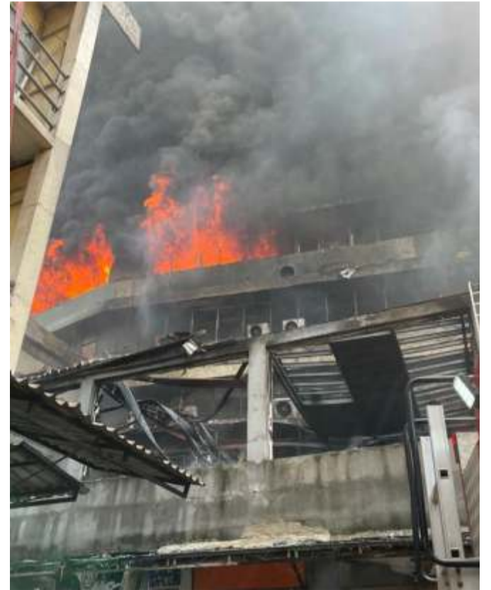
The inferno at Mandilas