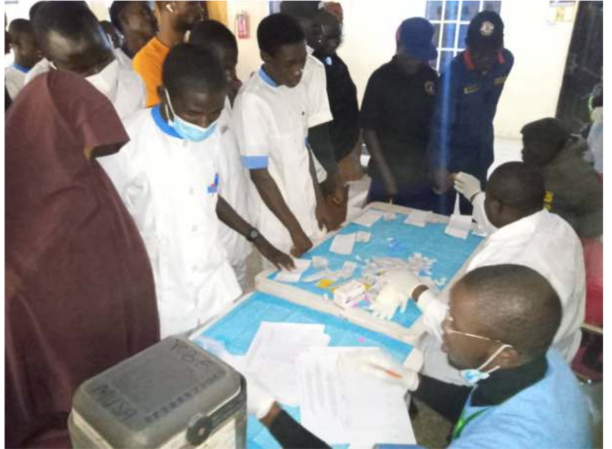
The screening and the vaccination exercises are held concurrently at Damaturu, Gashua and Potiskum Specialists Hospitals across the state and would last for three days.

According to them, "the prevalence of the disease in the state capital is minimal but also it is a salient killer. People hardly come to hospital for checkups until when they are sick", they said.