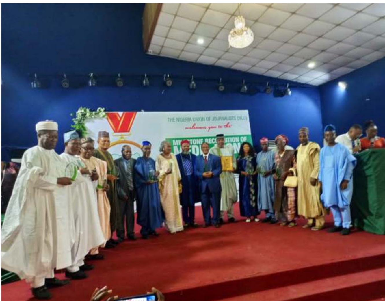
Award Recipients of NUJ Milestone Recognition of Media Icons