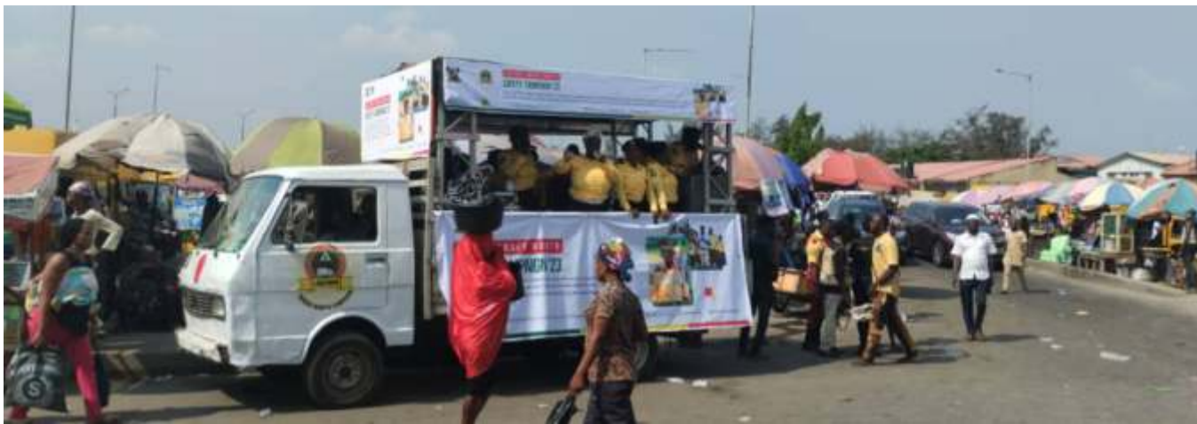
LASTMA officials in a designated van during the advocacy campaign