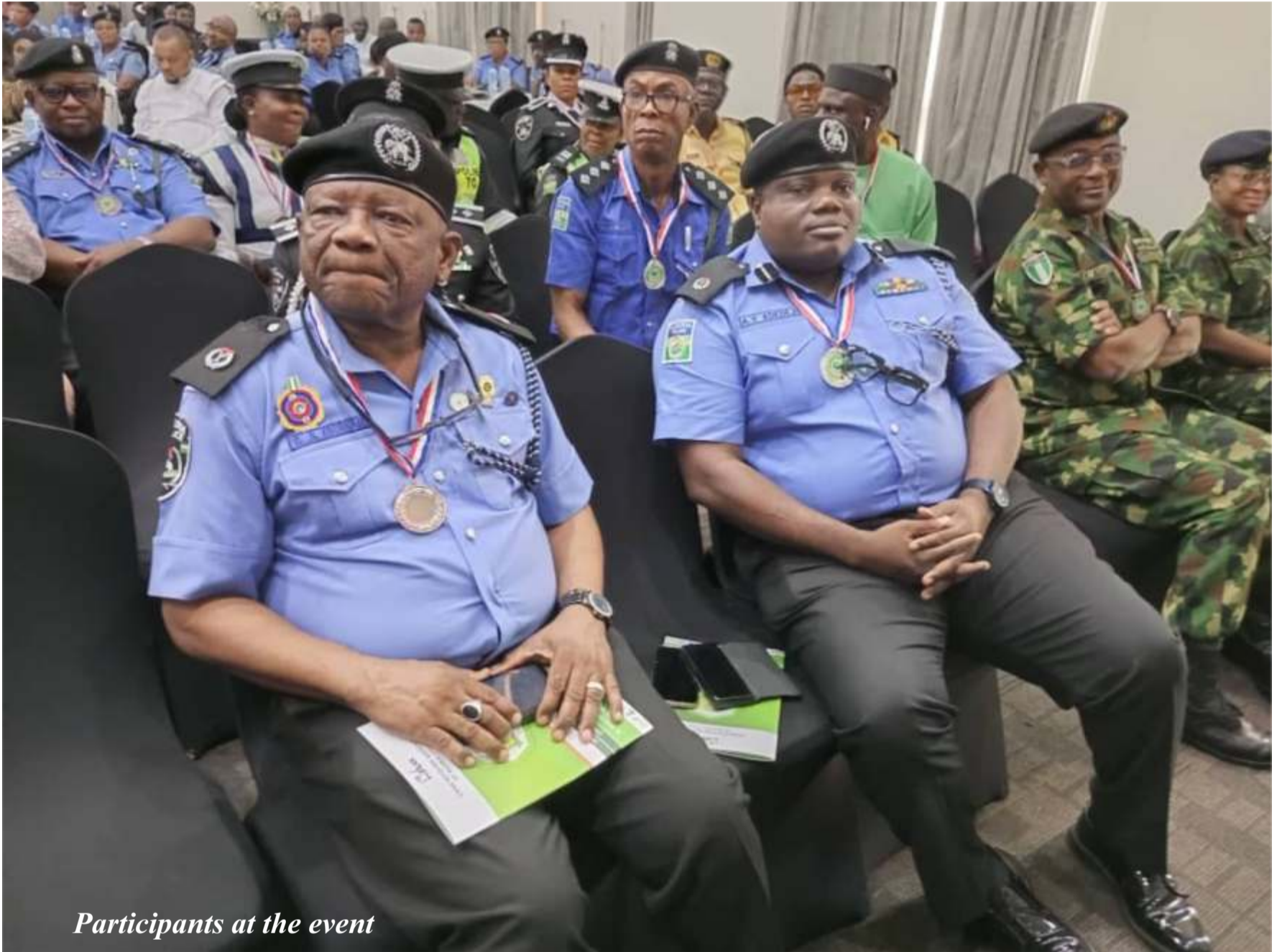
Participants at the event