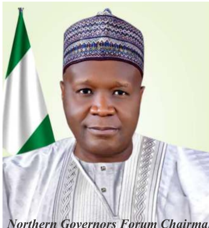
Northern Governors Forum Chairman