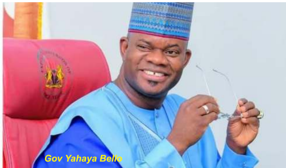
Gov Yahaya Bello

The materials include Bimodal Voter Accreditation System and result sheets for Adavi, Okene, Okehi, Ogori-Magongo, Ajaokuta,