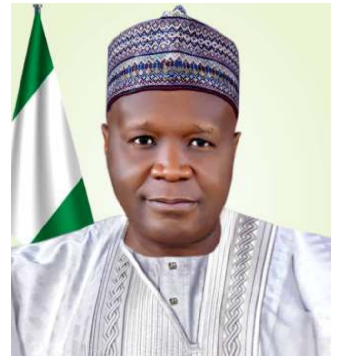
Governor Inuwa Yahaya