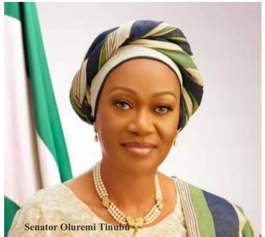
Senator Oluremi Tinubu

beneficiaries were carefully selected from the 13 local government areas across the state.