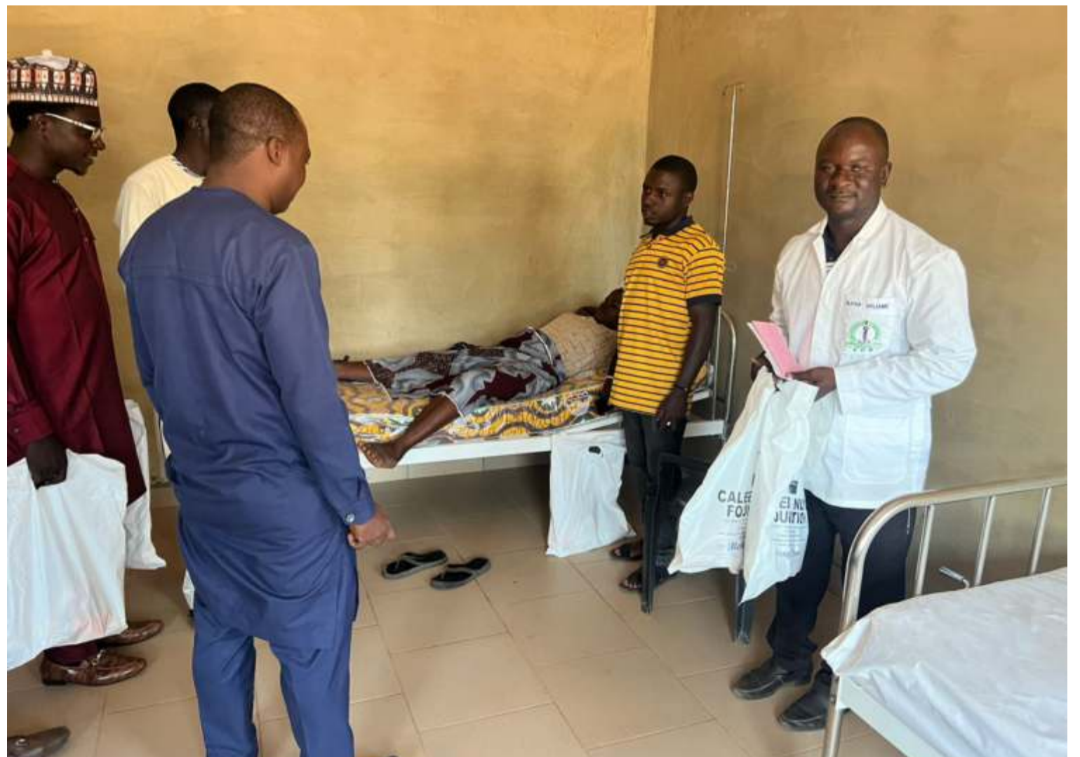
CEO Caleb Danladi Foundation visits patients, honour healthcare volunteers in Kaduna hospitals

Recognizing the dedication and selflessness of hospital community volunteers, the Caleb Danladi Foundation engaged in meaningful dialogues with these unsung heroes. The foundation expressed heartfelt appreciation for the invaluable contributions of these volunteers, acknowledging their pivotal role in