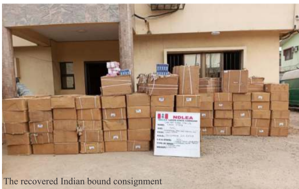
The recovered Indian bound consignment

" Not less than 70 parcels of Canadian Loud, a strong strain of cannabis, with a gross weight of 35kg were seized by operatives of the Tincan Command of NDLEA from a container, marked BEAU 4993525 coming from Toronto via