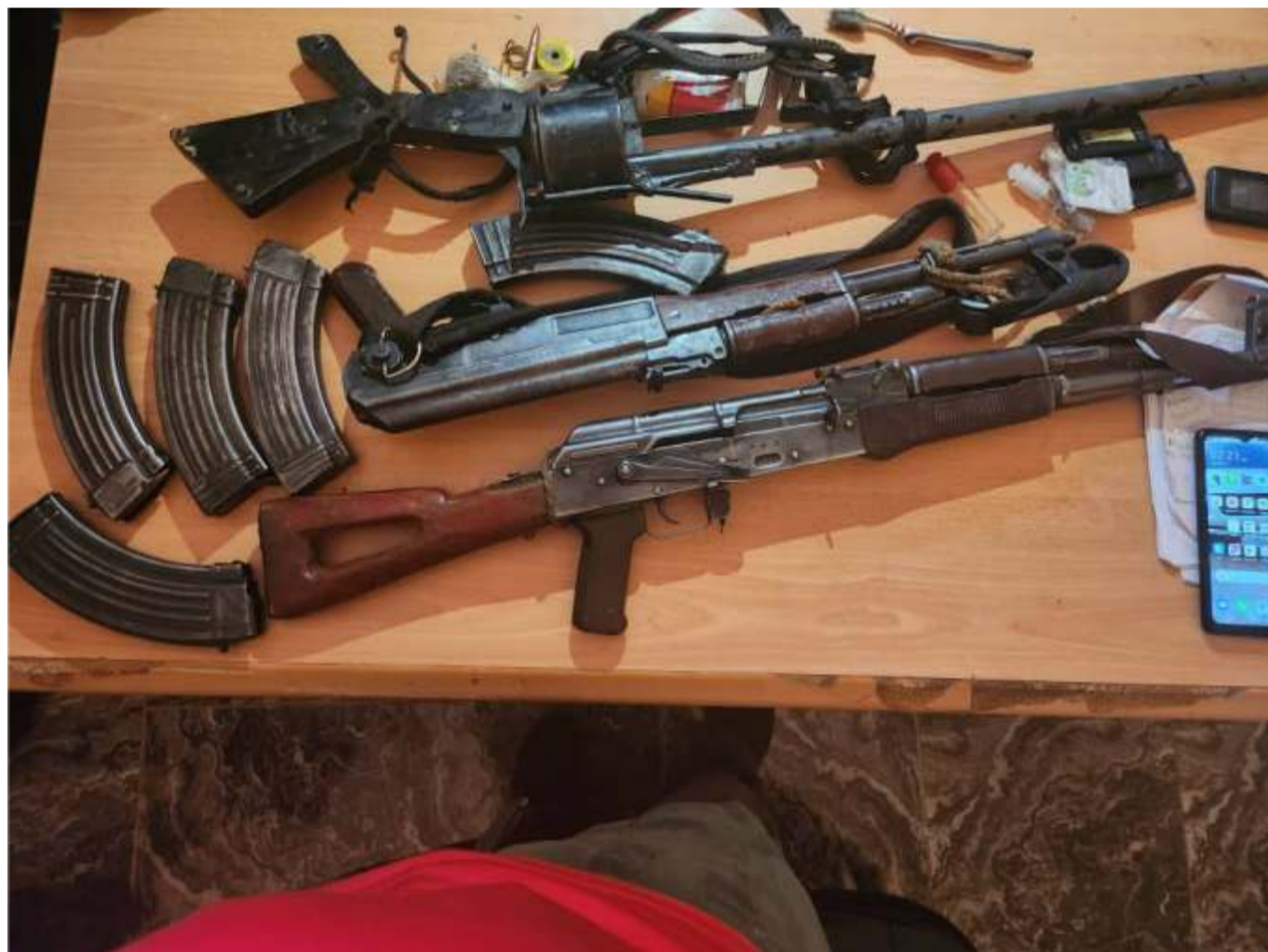
The recovered assault rifles