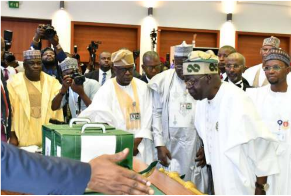
President Bola Ahmed Tinubu presenting 2024 preparation bill to joint National Assembly members at the Complex, in Abuja on Thursday.