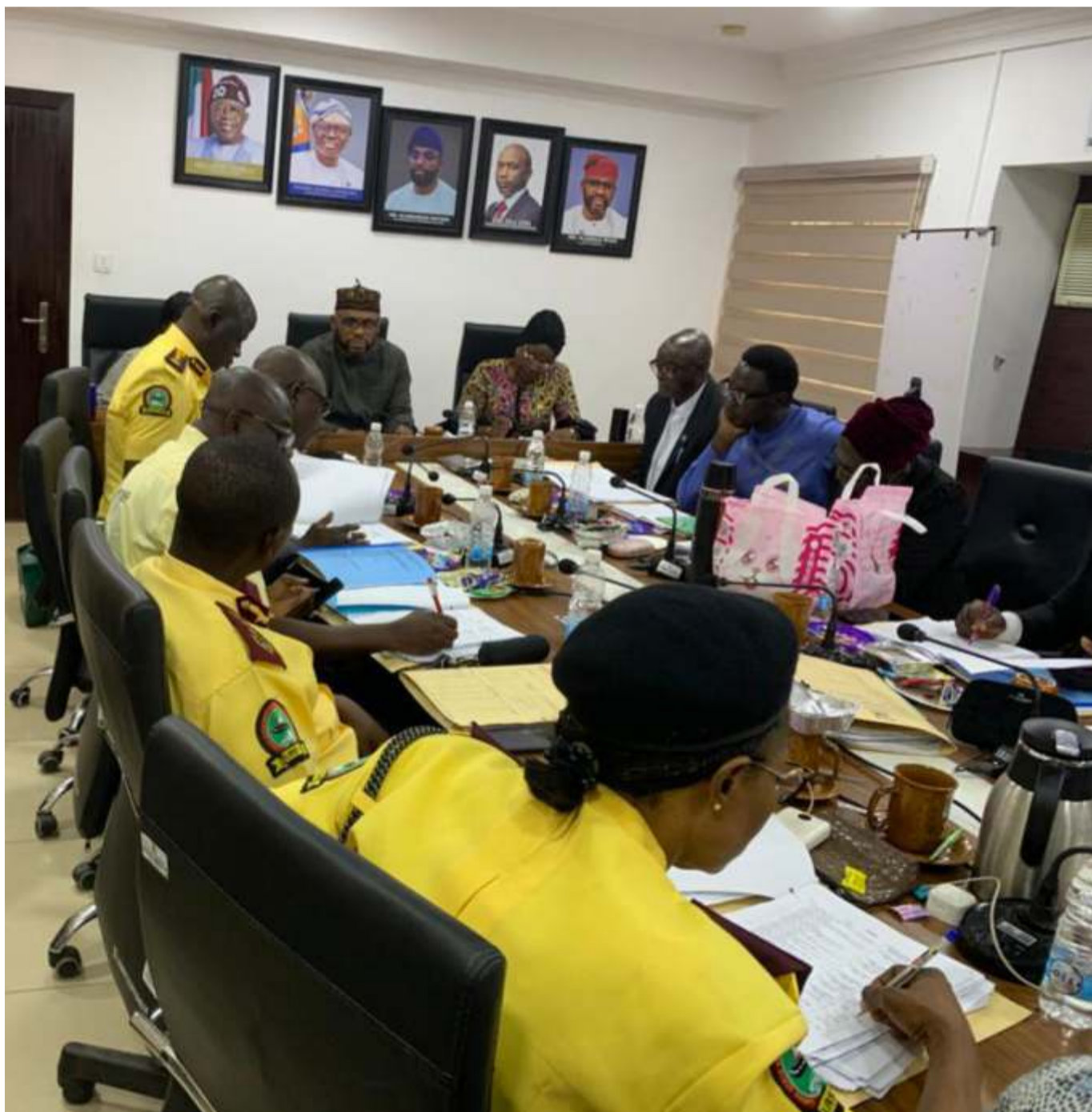
Erring officers during the trial

" I am happy that people are noticing us . I am so happy that people are really recognizing what we are doing . The Award is a very big challenge. The Award is encouraging us to do more for the society. I will continue to make traffic move. Lagos must move forward ". Lagos MOTORPOL said.