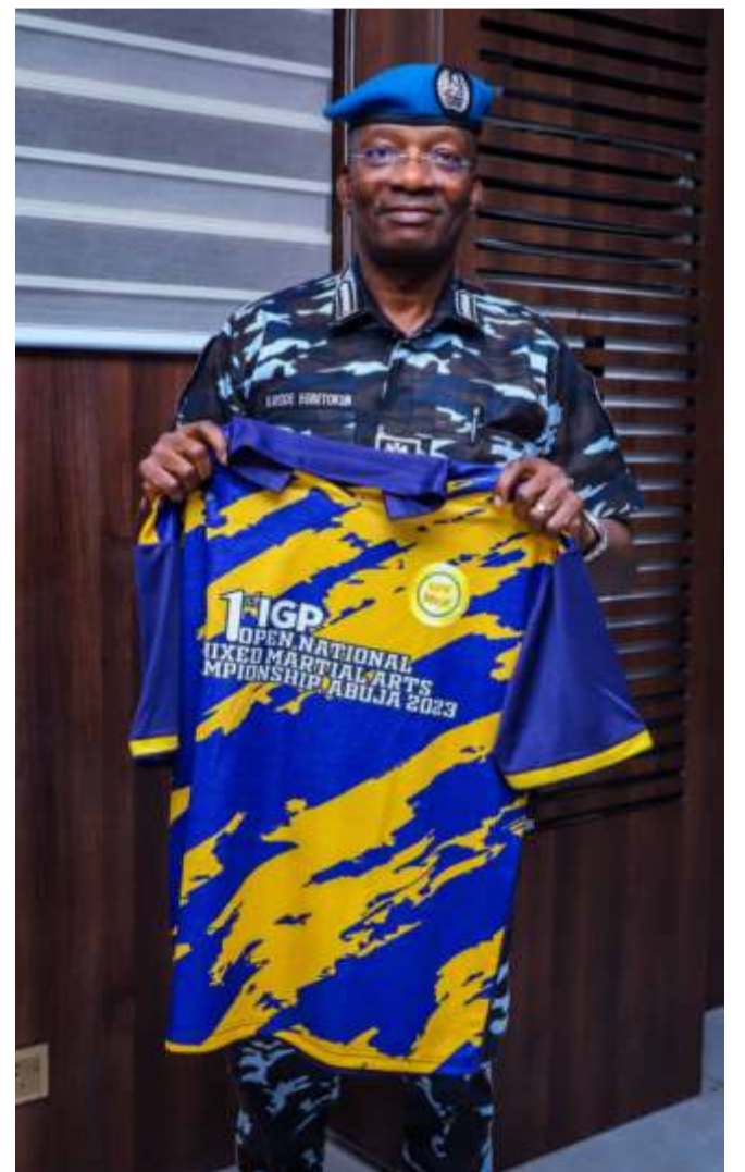
IGP Egbetokun displaying the official jersey for the event.