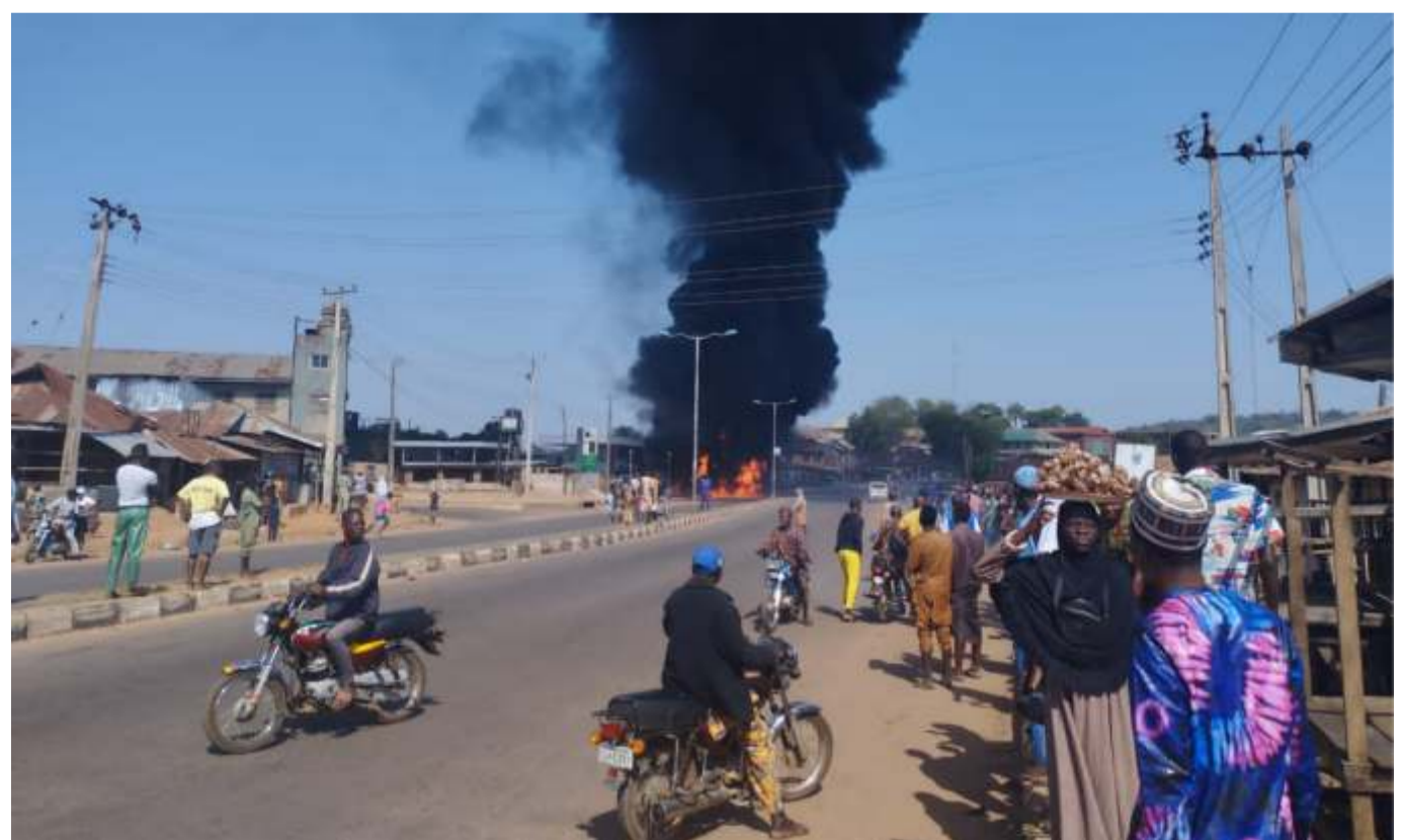
Scene of the tanker fire

According to the source, "The fire started when the consignment that just arrived was being offloaded, we thank God no life was lost and no one was injured,"