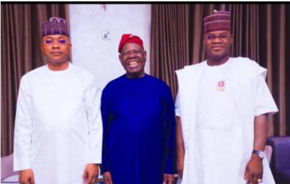
L-R: Ododo, Akande and Yahaya Bello during the visit in Abuja yesterday.

He commended Akande for his visionary leadership and uncommon wisdom in founding and nurturing the APC, now the largest political party in Africa and reiterated his commitment to fulfilling electioneering promises for the people of Kogi State.