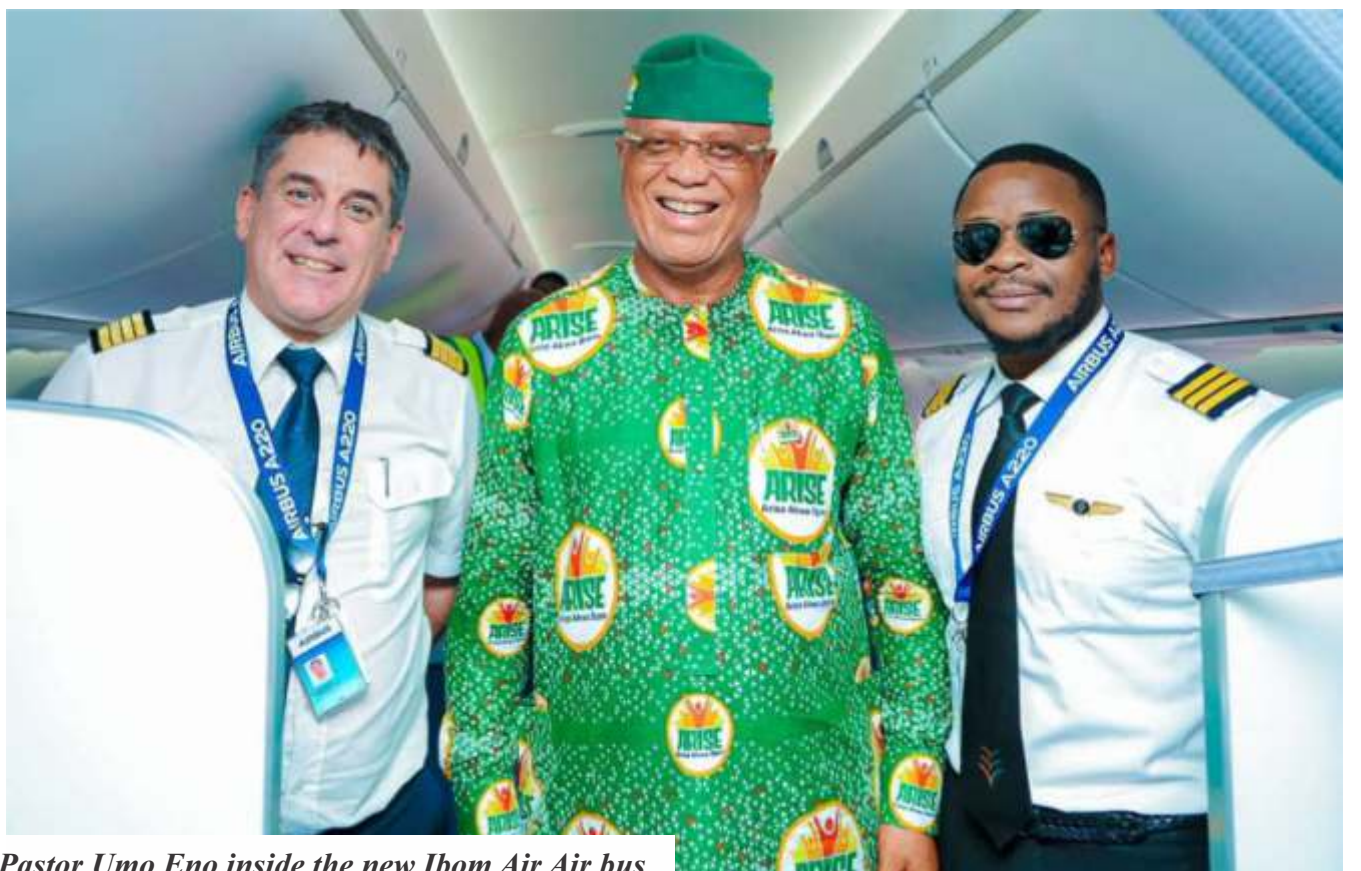
Pastor Umo Eno inside the new Ibom Air Air bus

He noted that though the cost of acquiring the Brand New Airbus A220-300 could afford five of the regular aircraft used around the country, there are numerous advantages especially, fuel economy, eco-friendly design and ability to be used for both long and short haul flights. Highpoint of the event was the dedication of the brand new Airbus A220-300 and the tape cutting ceremony.