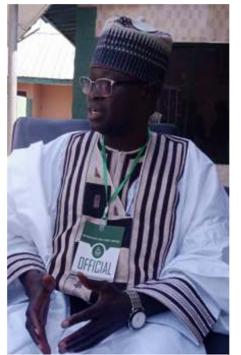
Chief Imam Offa Mosque

"Whatever they do now for the people is the legacy, not what they are looting and keeping for themselves and their families. They should prioritize the happiness of the citizens by making life easy for everyone," he said.