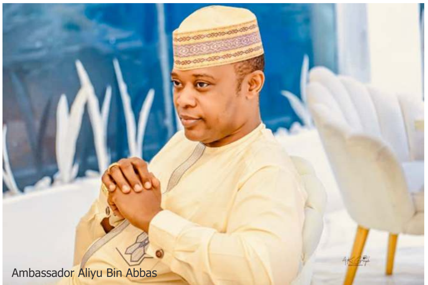
Ambassador Aliyu Bin Abbas

*Ododo'll fulfill campaign promises - Gov Bello