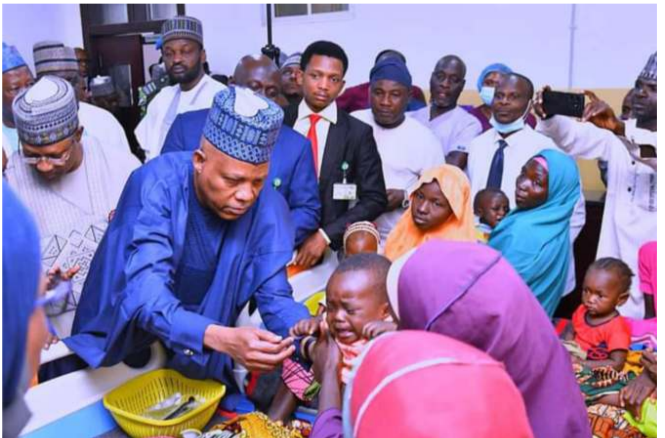
Vice President Shettima at the bedside of a patient during a visit to a hospital in Kaduna yesterday

EFCC Chairman Never Said 7 Out Of 10 Nigerian Students Are Criminals - Commission PAGE 3