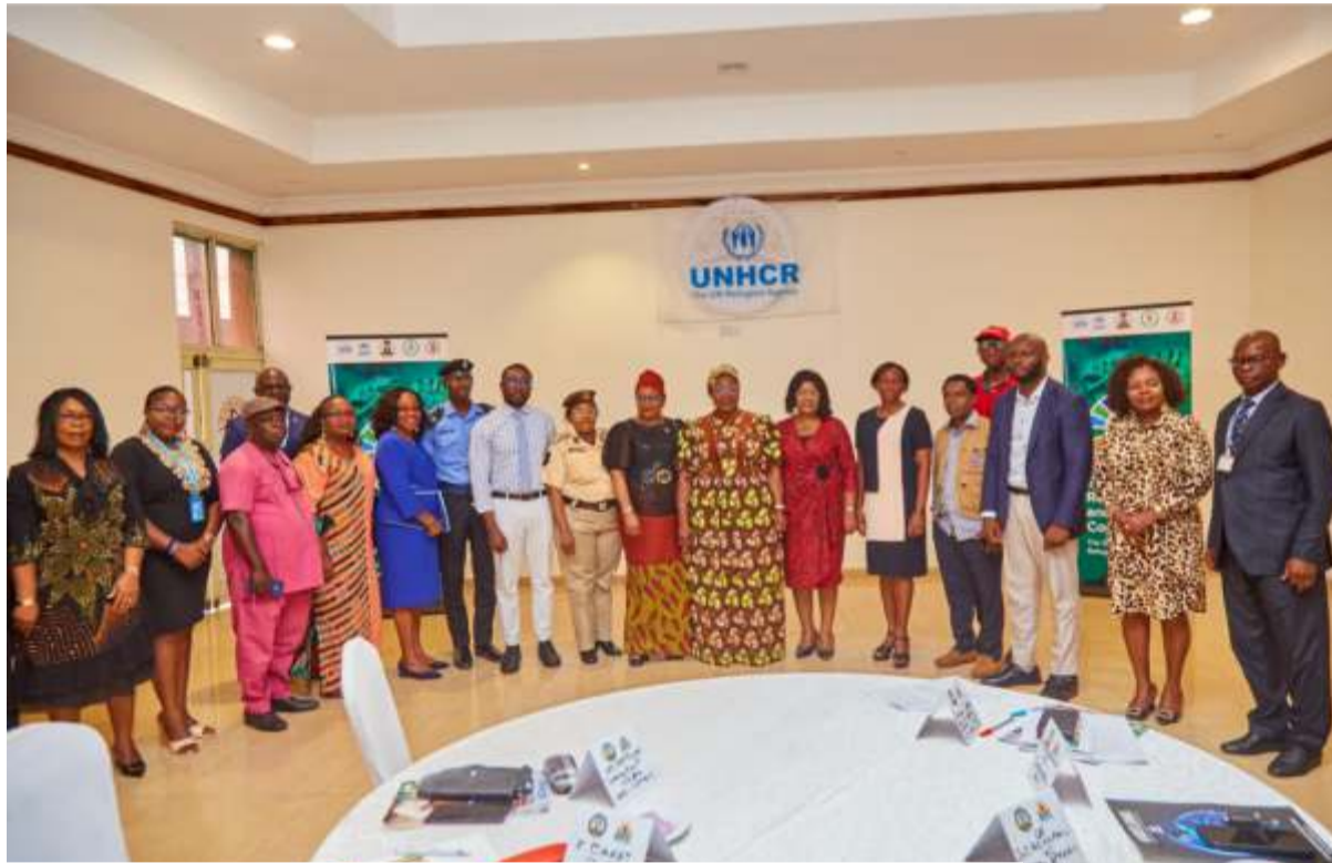
Conference of Refugees in Uyo, Akwa Ibom State

people of Akwa Ibom State have been very accommodating and hospitable to refugees and Internally Displaced Persons, because it is in our nature to love and accommodate strangers." The Deputy Governor commended the United Nations