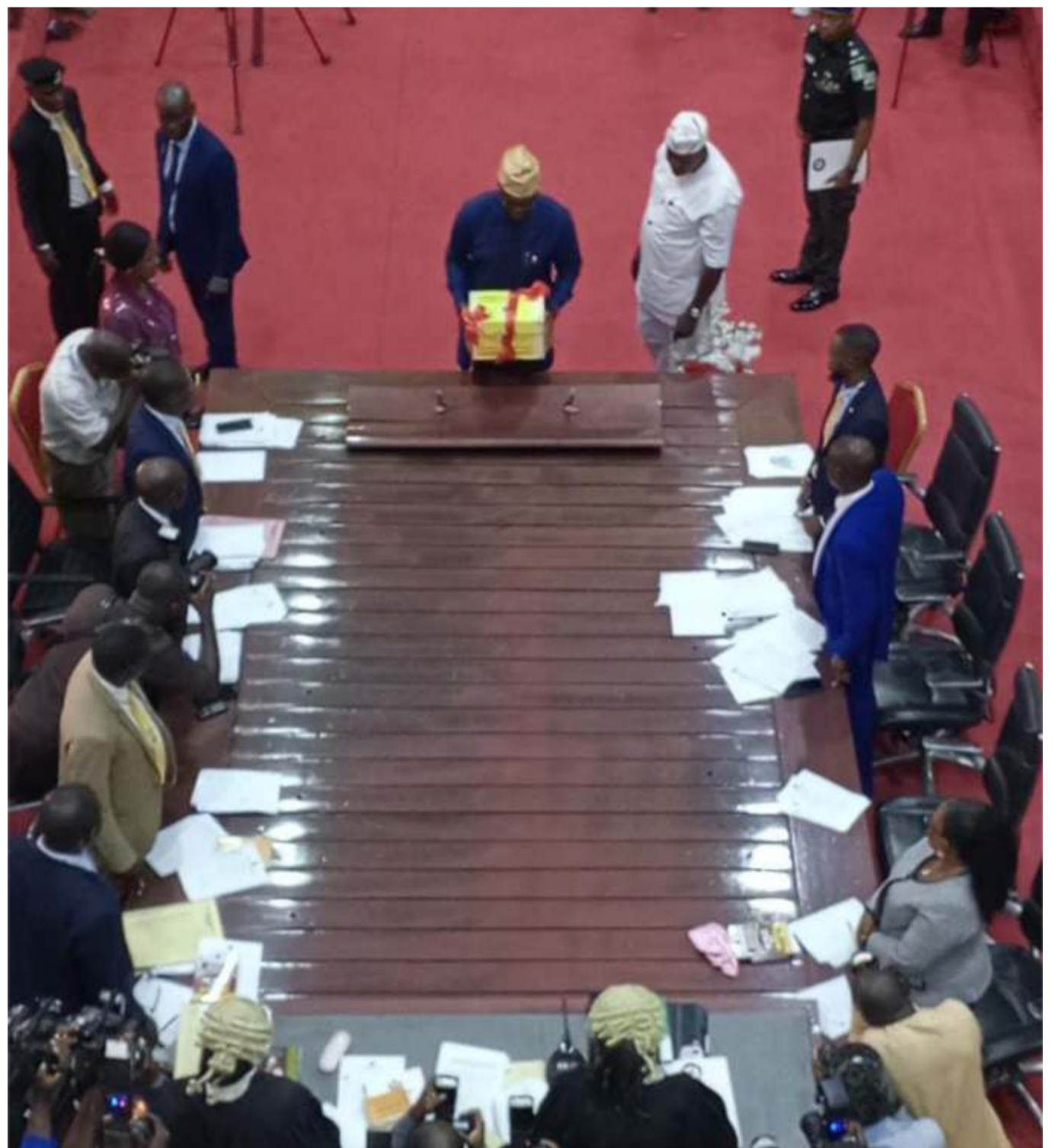
Gov Seyi Makinde presenting Oyo state 2024 budget to the House of Assembly on Tuesday.

The 2024 budget proposal presentation was witnessed by top government functionaries, traditional rulers, political office holders, notable politicians from across the state as well as other supporters of the Gov Seyi Makinde administration