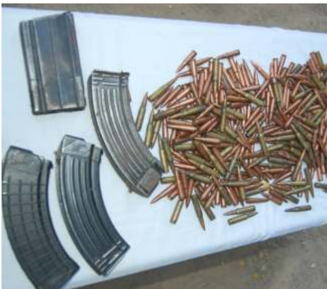
Thirteen AK- 47 magazines and Live ammunition recovered from the suspected criminals.

Consequently, Commissioner of Police, Abubakar Musa, appreciated efforts of people of the state and further called on them to continue to support the command in the ongoing fight against all forms crimes and criminalities in the state by providing crucial and timely information on criminal activities so as to enable the command take swift and decisive action to deter any form of criminal activity in the state.