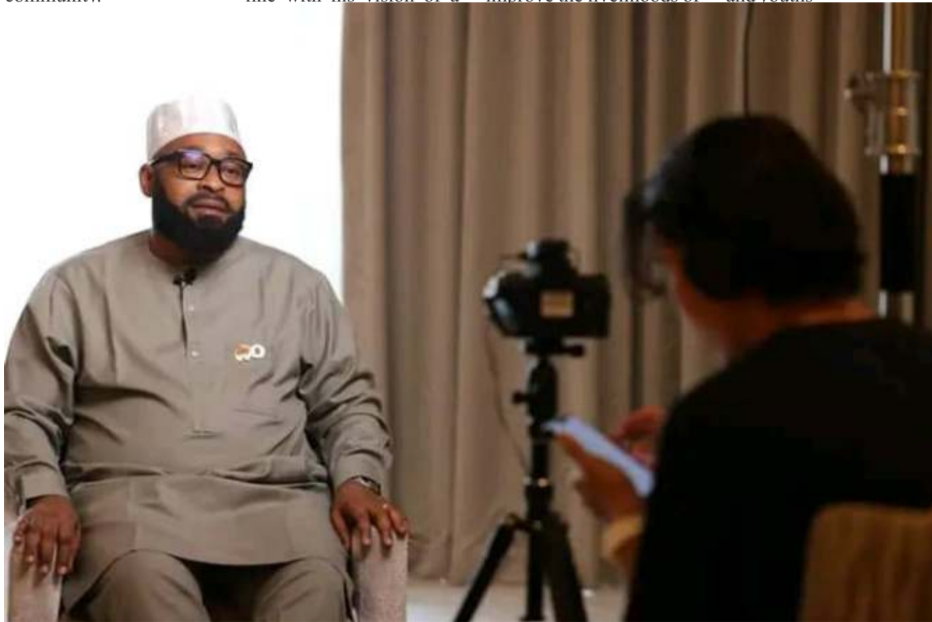
Governor Bago during the interview

advantage of the state's arable land and turn the State into an agricultural hub that will equally provide avenues for job creation among women and youths