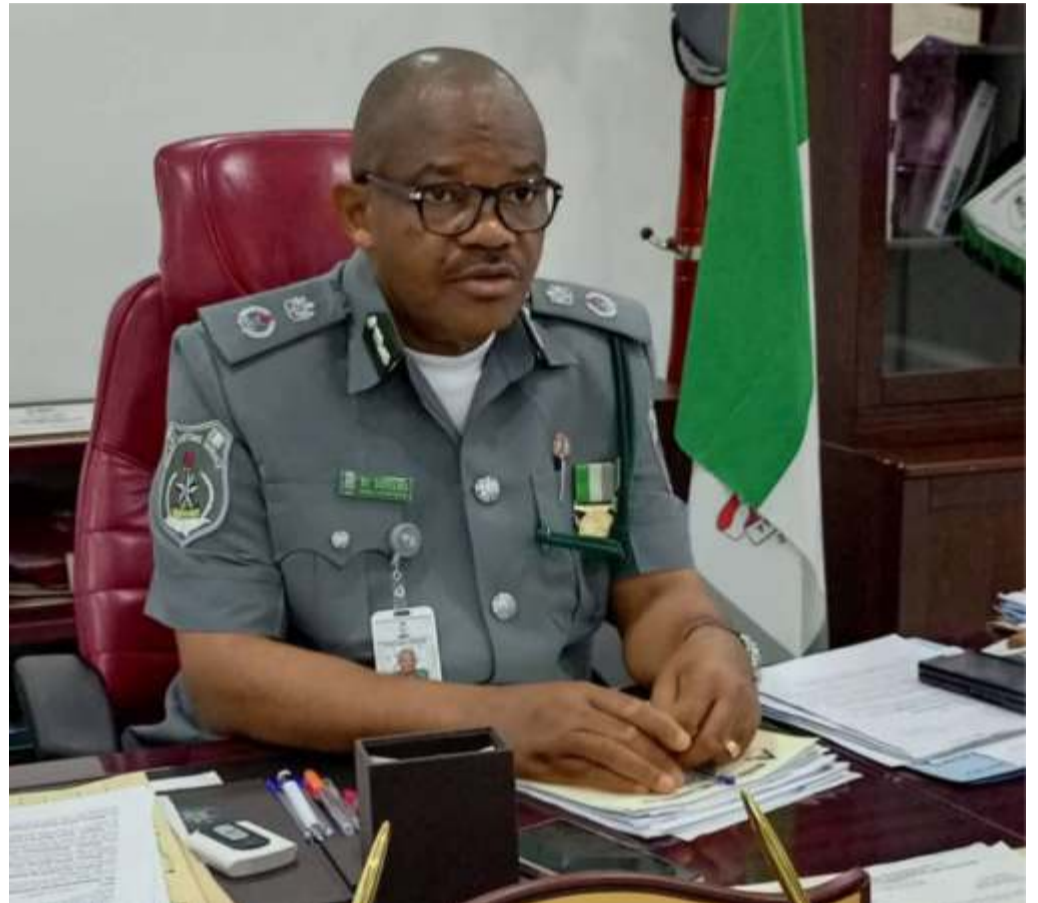
Comptroller Babajide Jaiyeoba Apapa Customs Command

According to the CAC, the recent daily and monthly revenue collection achievements should be a motivation for officers to do more to justify the confidence invested in the service by the Federal Government and meet the expectations of the Comptroller-General of Customs, Bashir Adewale Adeniyi, MFR, in the areas of maximum revenue collection, legitimate trade facilitation and suppression of smuggling. The CAC also urged members of the Apapa port community like importers, licensed customs agents,