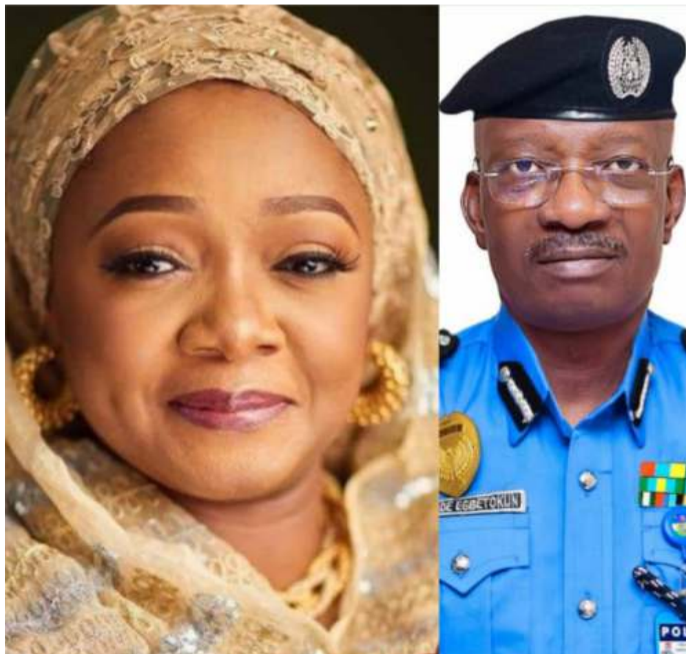
Minister of State Police Affairs (left) & IGP Egbetokun

"Her most recent approach to policing is the forum which 'aims to foster an