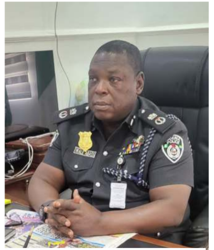
Delta State Police Commissioner