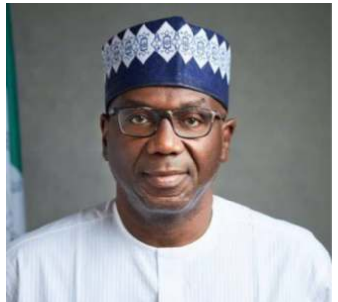
Governor, AbdulRahman AbdulRahman

He asks Allah, the Living and Everlasting, to forgive the late scholar and grant him Al-jannah Firdaus, and keep his inheritors and students on the path guidance.