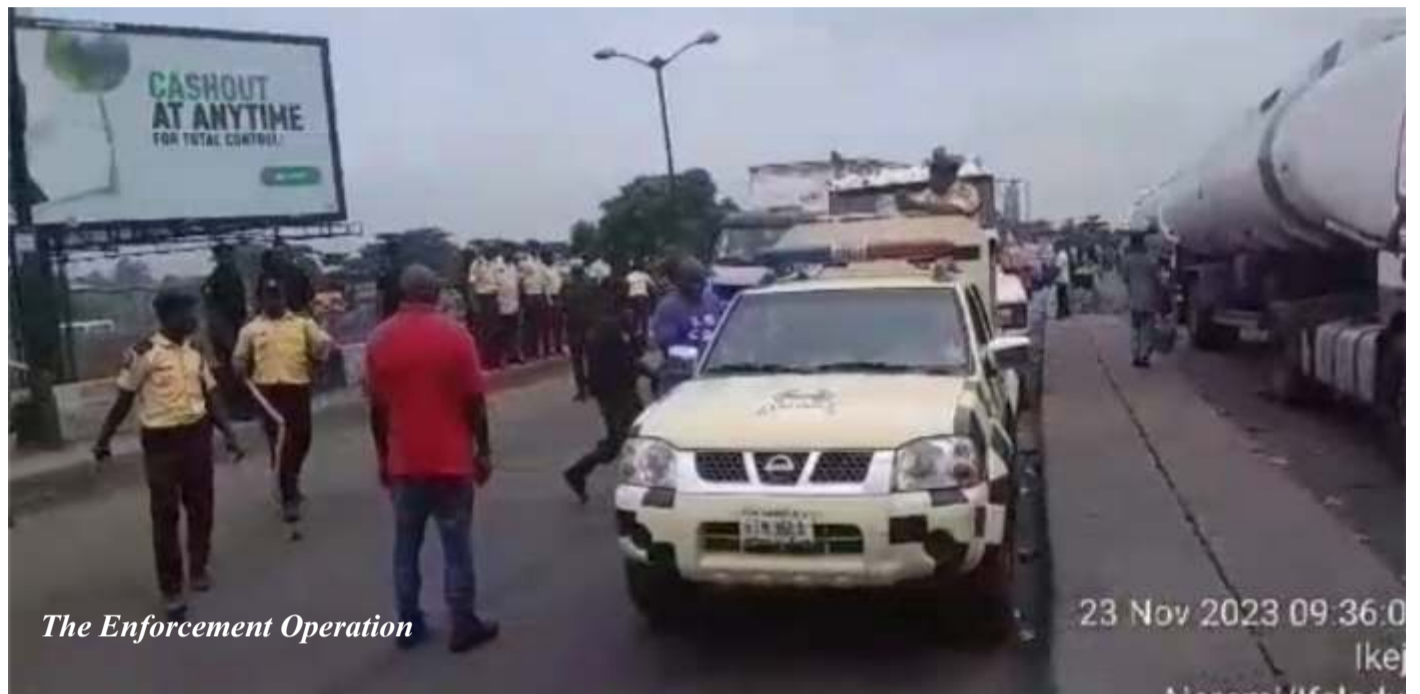
The Enforcement Operation