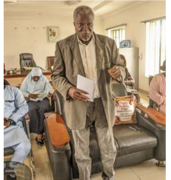
Prince Oyelade speaking during the courtesy visit.

*Says he will out-perform his first term legacy