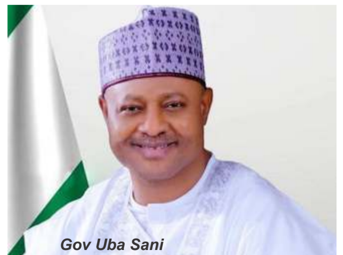
Gov Uba Sani

leading opposition party with the aim to fraudulently extorting the Federal Government. "They approached the Minister of Women Affairs and created a false impression of disharmony and crisis in Kagarko LGA. "The minister, without verifying their bogus claims and in the absence of officials from Kagarko Local Government and the Kaduna State Government, made official pronouncements, and went to the ridiculous extent of promising parcels of land and even seedlings to the conspirators. "The Kaduna State Government is disappointed and shocked by the ill-advised actions of the Minister of Women Affairs, Uju Kennedy-Ohanenye, who with her experience as a public servant and knowledge as an Attorney at Law, should have applied caution and professionalism by contacting the Kaduna State Government to get the accurate information on the situation in those communities," it said. It added that in line with the strategic vision of President Bola Ahmed Tinubu, the Kaduna State Government, led by Governor Uba Sani is assiduously working in partnership with Federal security agencies and other Federal Government ministries to promote peace, stability and socio-economic development of Kaduna State and will not allow any ill-conceived actions by external influences to jeopardize these efforts.