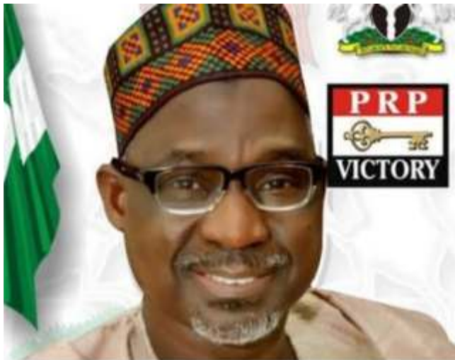
PRP National Chairman

PRP Expresses Dismay Over "Ongoing Genocidal Carnage" In Gaza