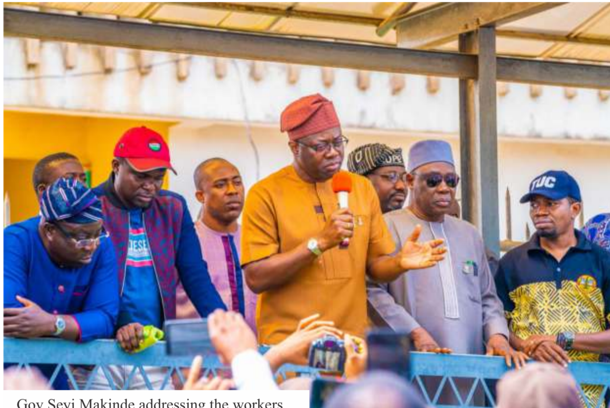
Gov Seyi Makinde addressing the workers

"So, what we agreed when we met was, I said yes, there is the