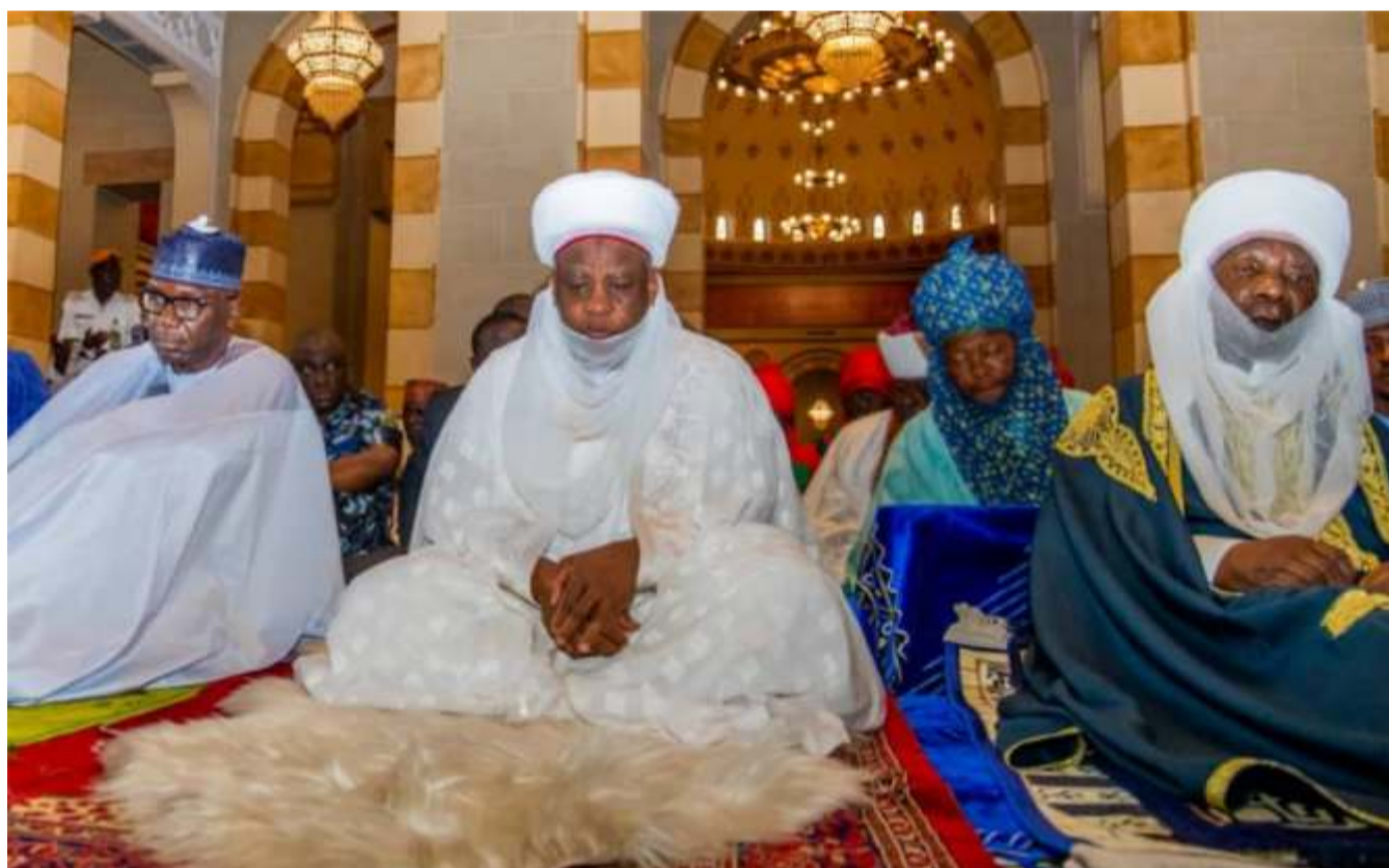
L-R: Kwara State Governor/Chairman, Nigeria Governors' Forum (NGF) Chairman, AbdulRahman AbdulRazaq; Sultan of Sokoto, Sa'ad Abubakar III and the Emir of Ilorin, Dr. Ibrahim Sulu-Gambari; at Jum'ah service in Ilorin, the state capital,

The National Chairman recalled that Nigeria. did what was expected against apartheid in South Africa and should repeat the same against apartheid in Palestine.