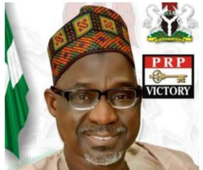
PRP National Chairman

"At the moment, our company produces premium varieties of rice from farmed paddy, which are branded and distributed nationwide as Sulltan Rice, Happy Home Rice and Rice Berry respectively," he said.