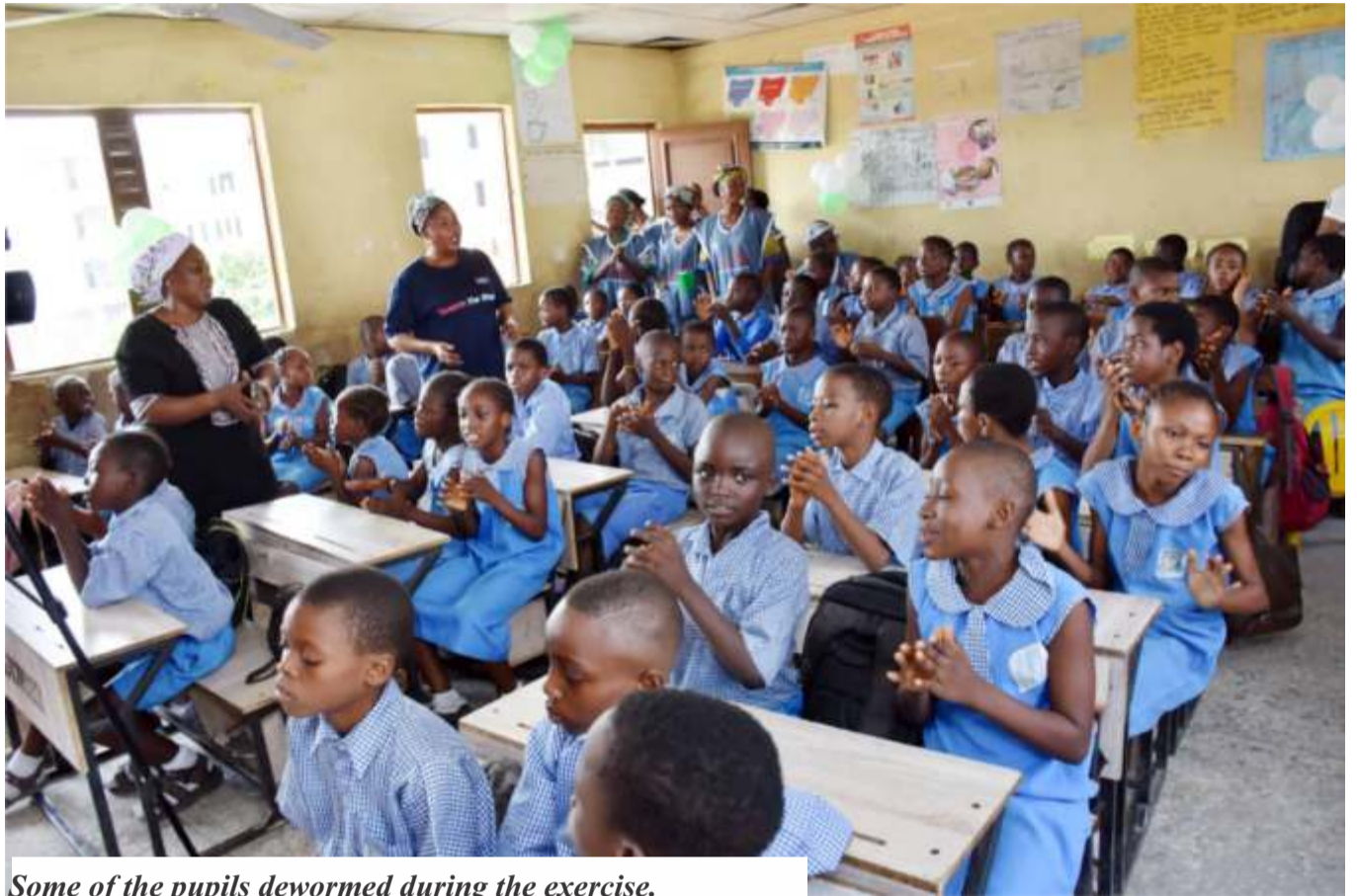
Some of the pupils dewormed during the exercise.

While urging residents in the affected LGAs to take advantage