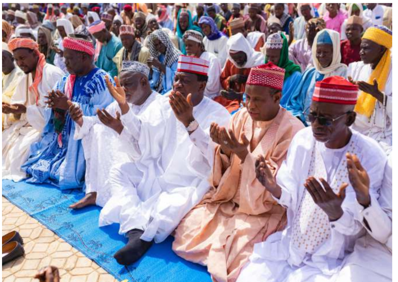
Muslims here offering prayers for leaders in the country