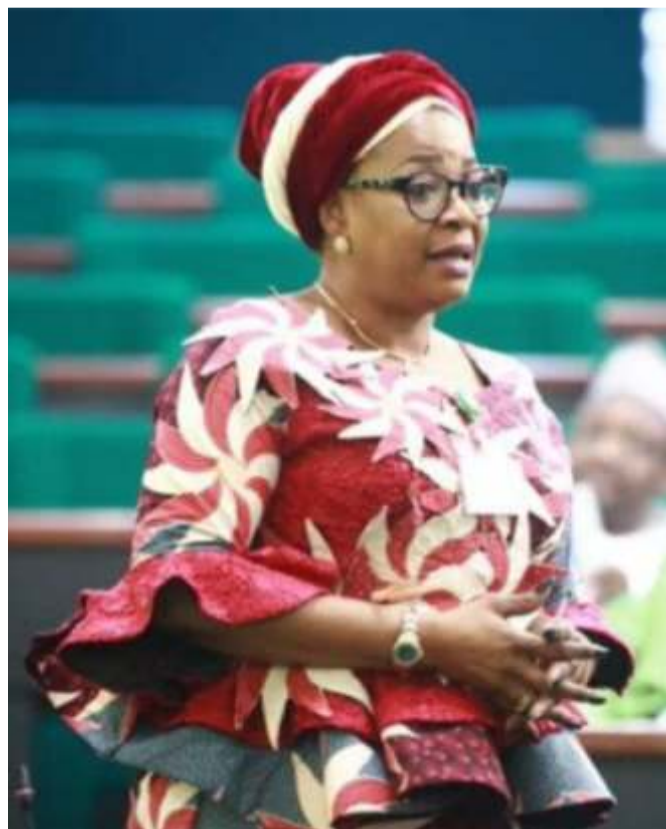
Hon Tolulope Akande-Sadipe

He said the ministry for defence would not condone any act capable of disrupting the peace and tranquillity of the country.