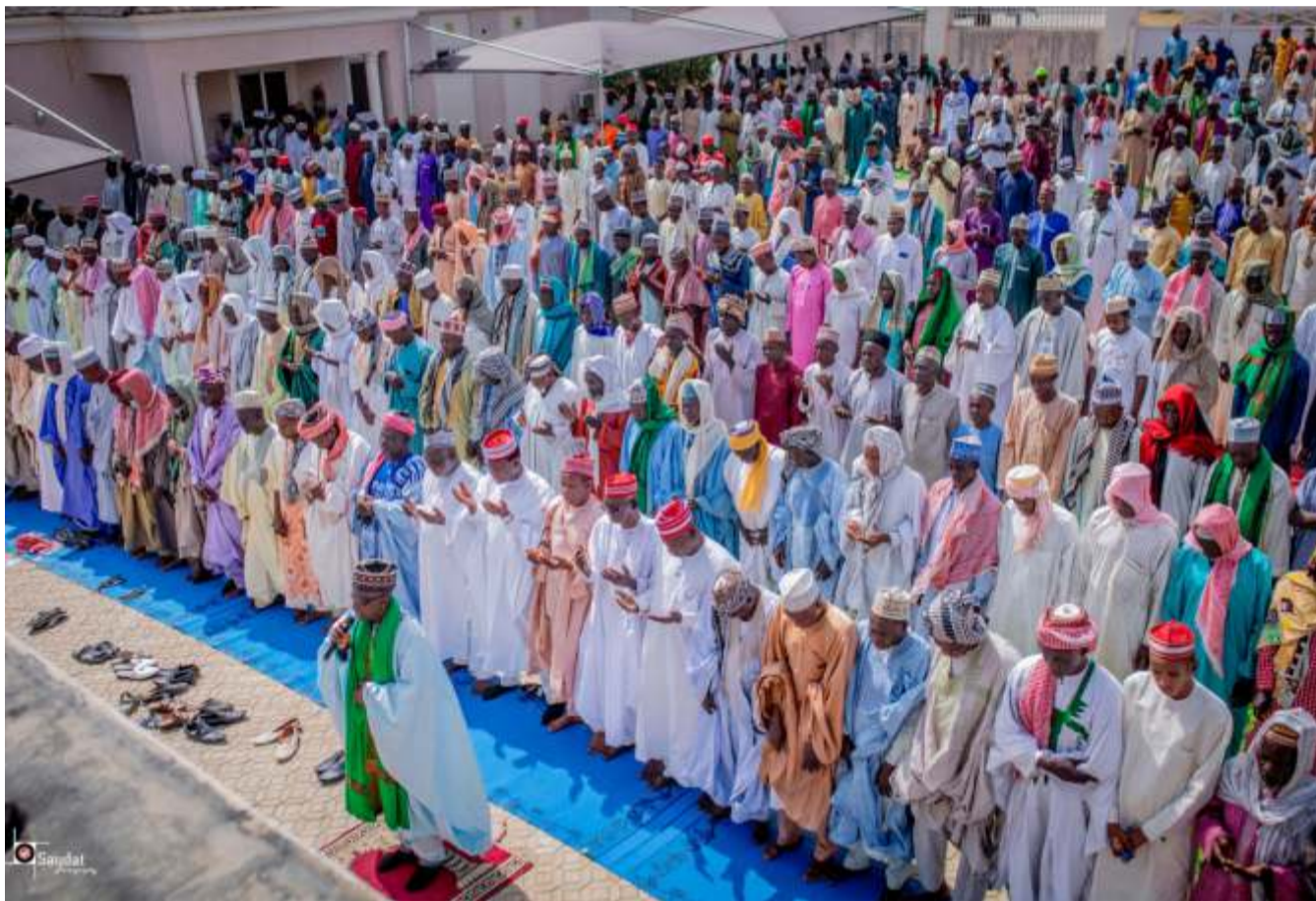
Prayer session for our leaders by Muslims