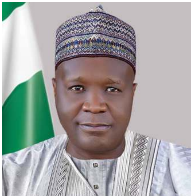
Governor Inuwa Yahaya

Governor Inuwa Yahaya remains committed to ensuring that the findings and recommendations of the Visitation Panels are meticulously and appropriately addressed towards implementing impactful reforms that will foster conducive academic environments.