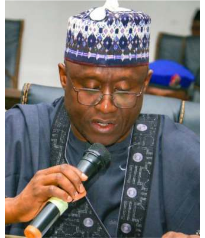
Hon. Sadiq Mamman Lagos