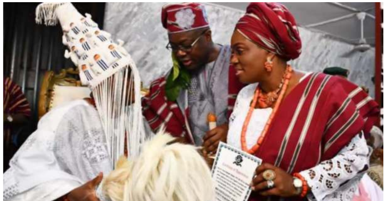
Gov Seyi Makinde, Osemawe of Ondo and the Gov's wife

"Of course, this is only possible when the traditional system is integrated into the state structure. So, I am also making a case for this integration. If these systems work well, why do we need additional bureaucracy for a federal-operated local government architecture? Each state can now determine what local authorities they want to