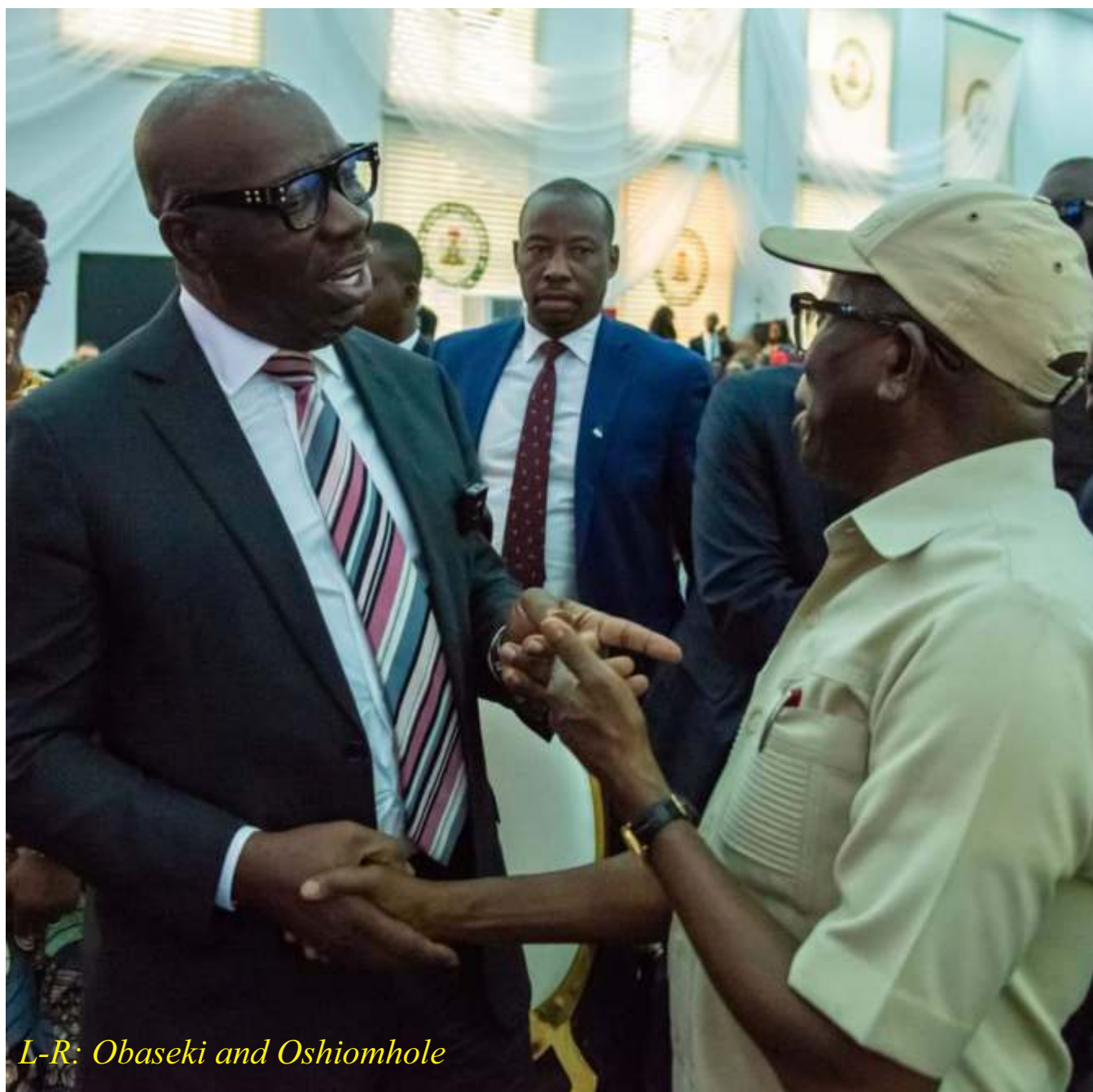
L-R: Obaseki and Oshiomhole

New Nigerian observed that CHRAN in a way to spur up citizens' patriotism to service, conferred Excellence Awards on some deserving individuals, public and private entities in Akwa Ibom for their contribution to the development of the state and humanity