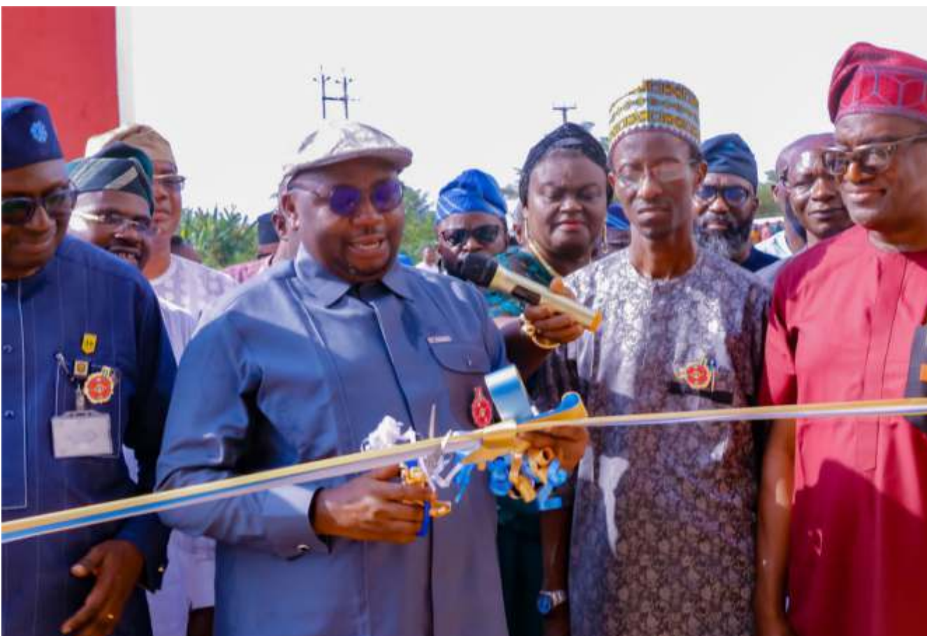
Minister of Power, Chief Adebayo Adelabu commissioning one of the projects

He said the President deserves commendation for deepening democracy and the electoral process in Nigeria, considering some successes recorded in the Imo governorship election and gubernatorial polls in Kogi and Bayelsa states.