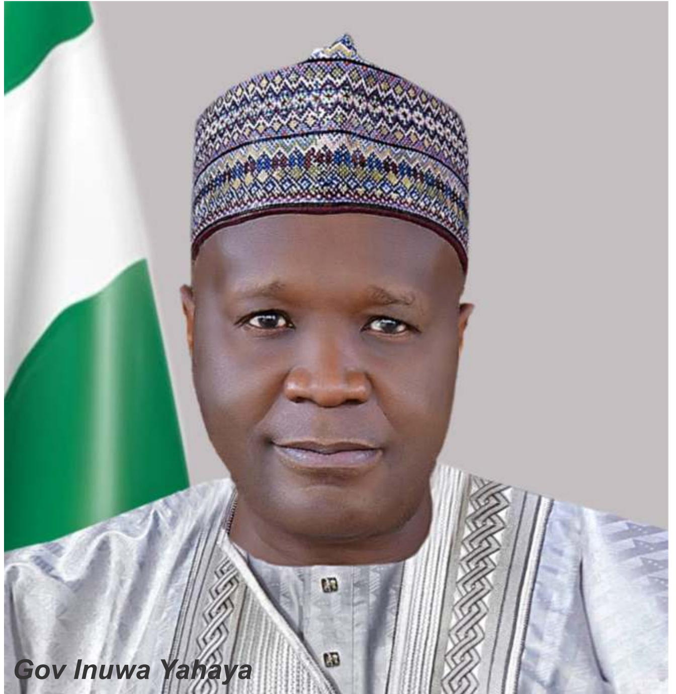
Gov Inuwa Yahaya

The administration of Governor Muhammadu Inuwa Yahaya had before