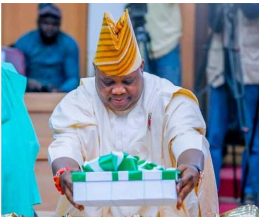
Osun State Governor, Senator Ademola Adeleke presenting 2024 Budget to the House of Assembly Osun State on Thursday.

While felicitating the new appointees, the Governor tasked them on exemplary service to the government and people of the state.