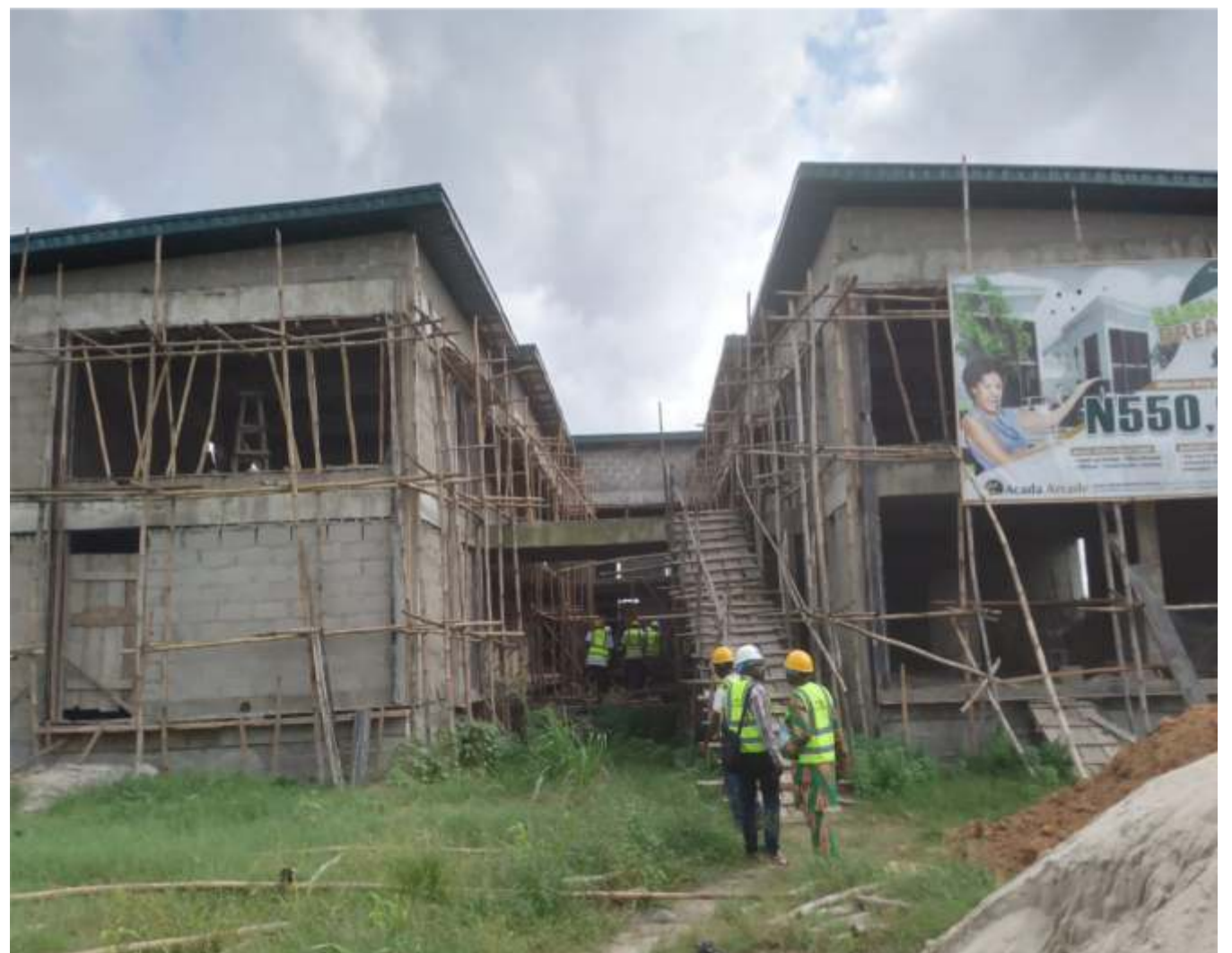
The ongoing construction of the complex.

"The smallest shop which is 11sqm is N6.6 million on the ground floor, while it is N6,050,000 on the first floor.