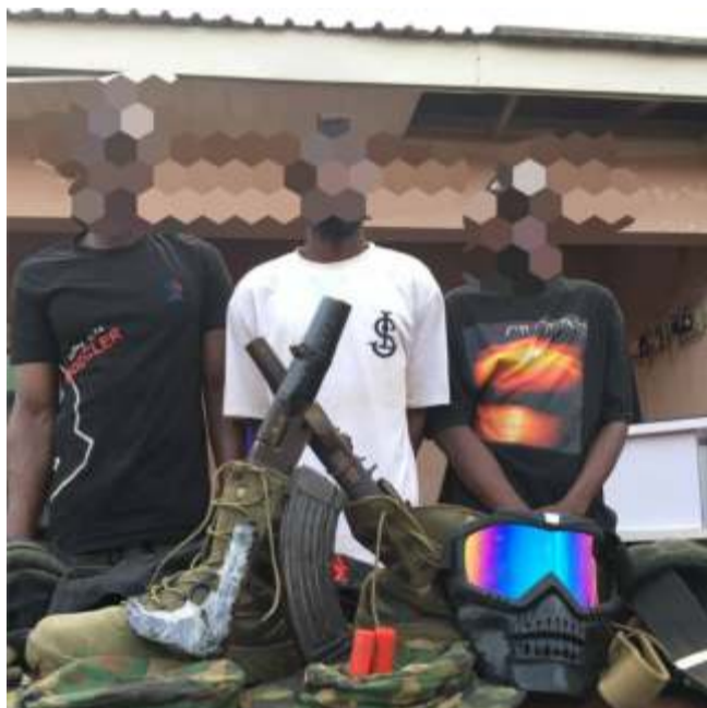
Some of the suspects and items recovered

"In another development, members of Crack Squad received information about a cult activity at Ogwashi-Uku, Ubulu-Uku Road. Upon arrival, the members of Crack