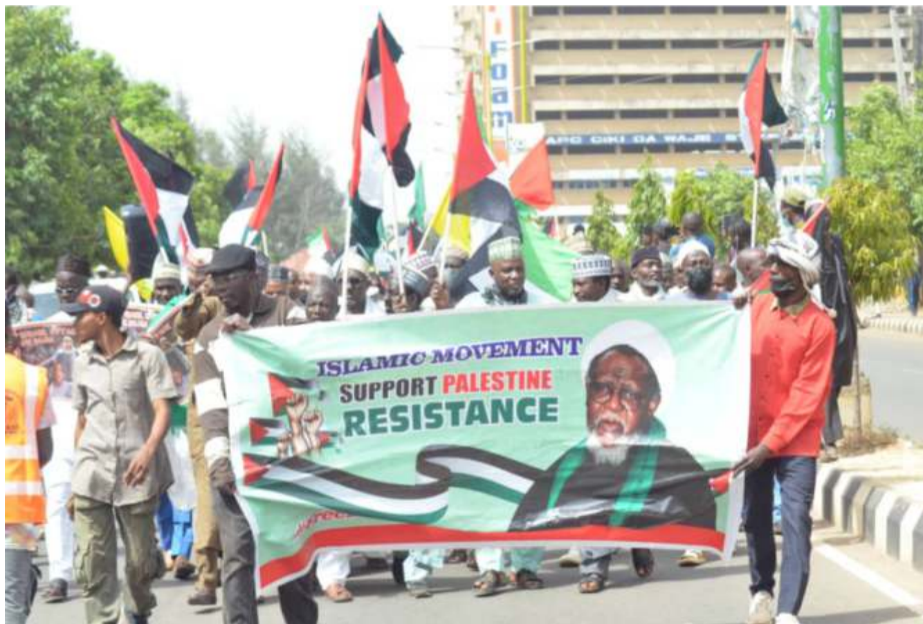
The Shiites during the protest in Kaduna yesterday.