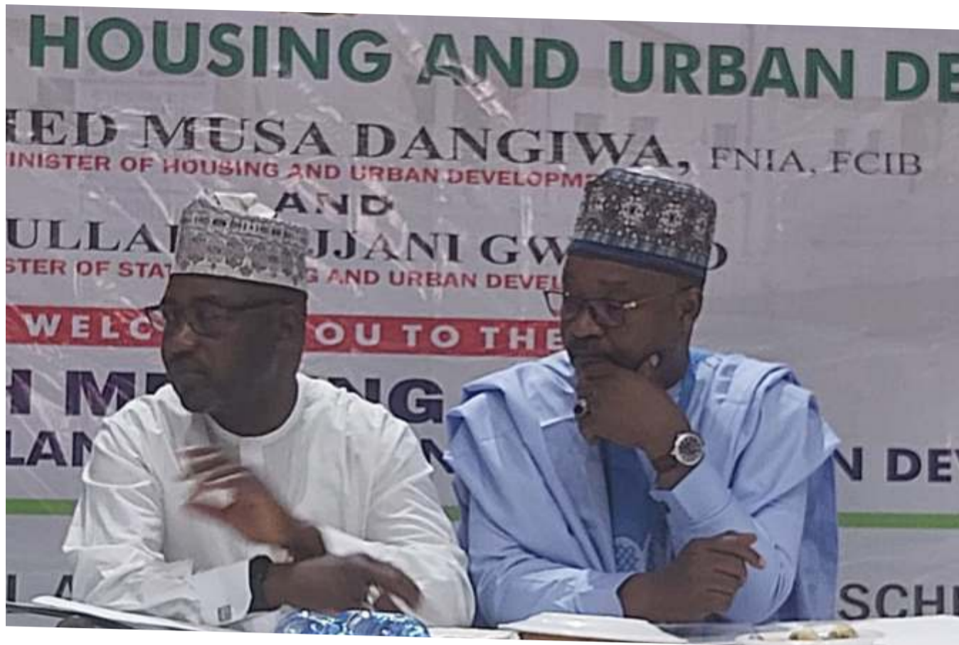
Some dignitaries at the 12th meeting of National Council of Housing and Urban Development in Kaduna.