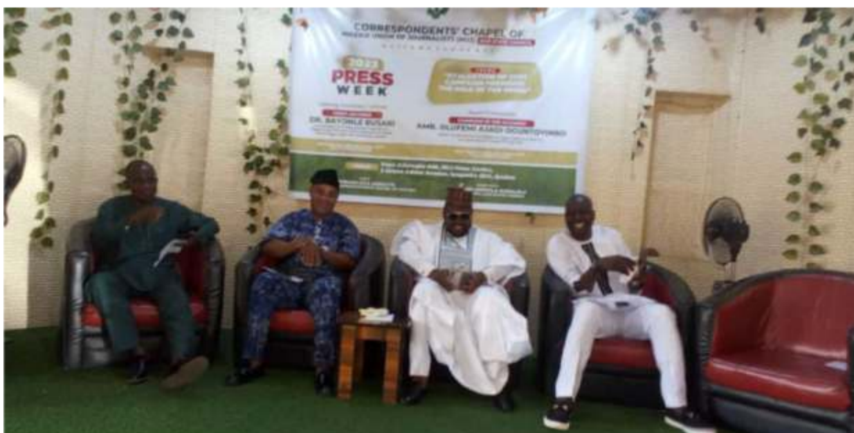
Dignitaries at the Correspondents Chapel Press Week