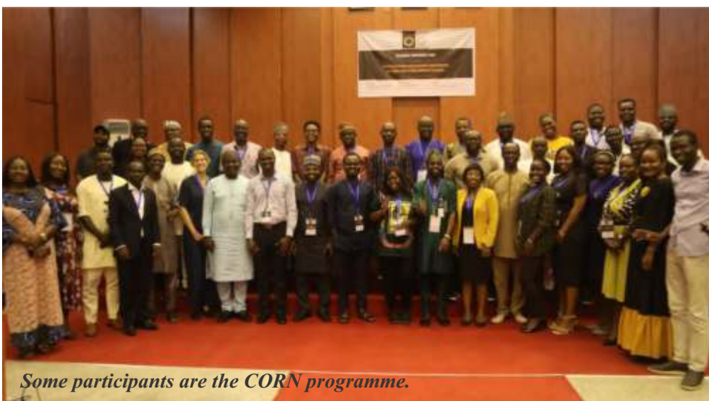
Some participants are the CORN programme.

During the conference, UNICEF Country Representative in Nigeria, Cristine Munduate admonished that “we must address the pressing issue of economic uncertainty in fragile and conflict affected societies and support the government to define social protection measures relevant to the needs of the citizens, the financial hardships faced by families in such regions exacerbate the already daunting challenges”