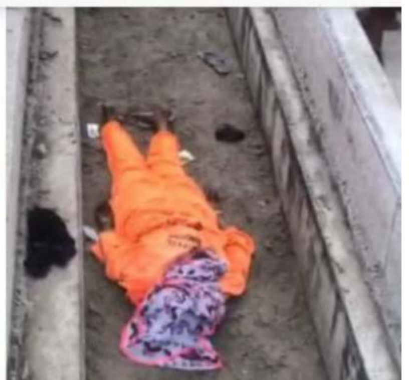
One of the deceased sweepers and the car that knocked them.

involved as widely speculated, as the vehicle and occupants involved in the chase were clearly not in Taskforce uniform. "It is a very sad and most importantly avoidable incident today that has led to loss of lives. For us as an Agency, we have a very firm believe that traffic offense is not a criminal offense, therefore it is better for a traffic offender to escape from the scene of the offense than to create a madness on the road that