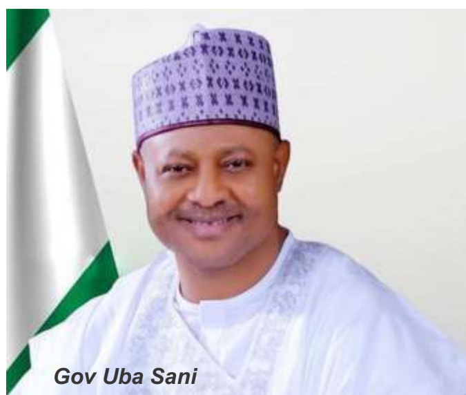
Gov Uba Sani

According to him when works are completed at the new barrack, it will be able to accommodate all the officers in the Command.