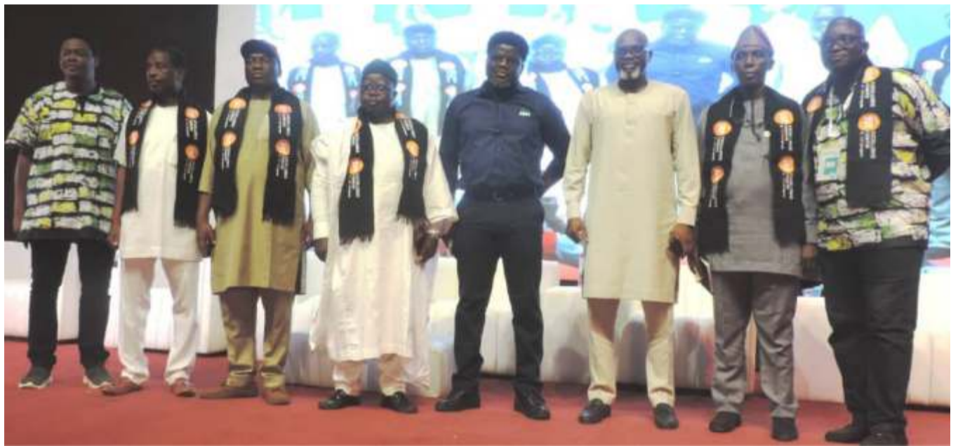
Some PAN members at the show.