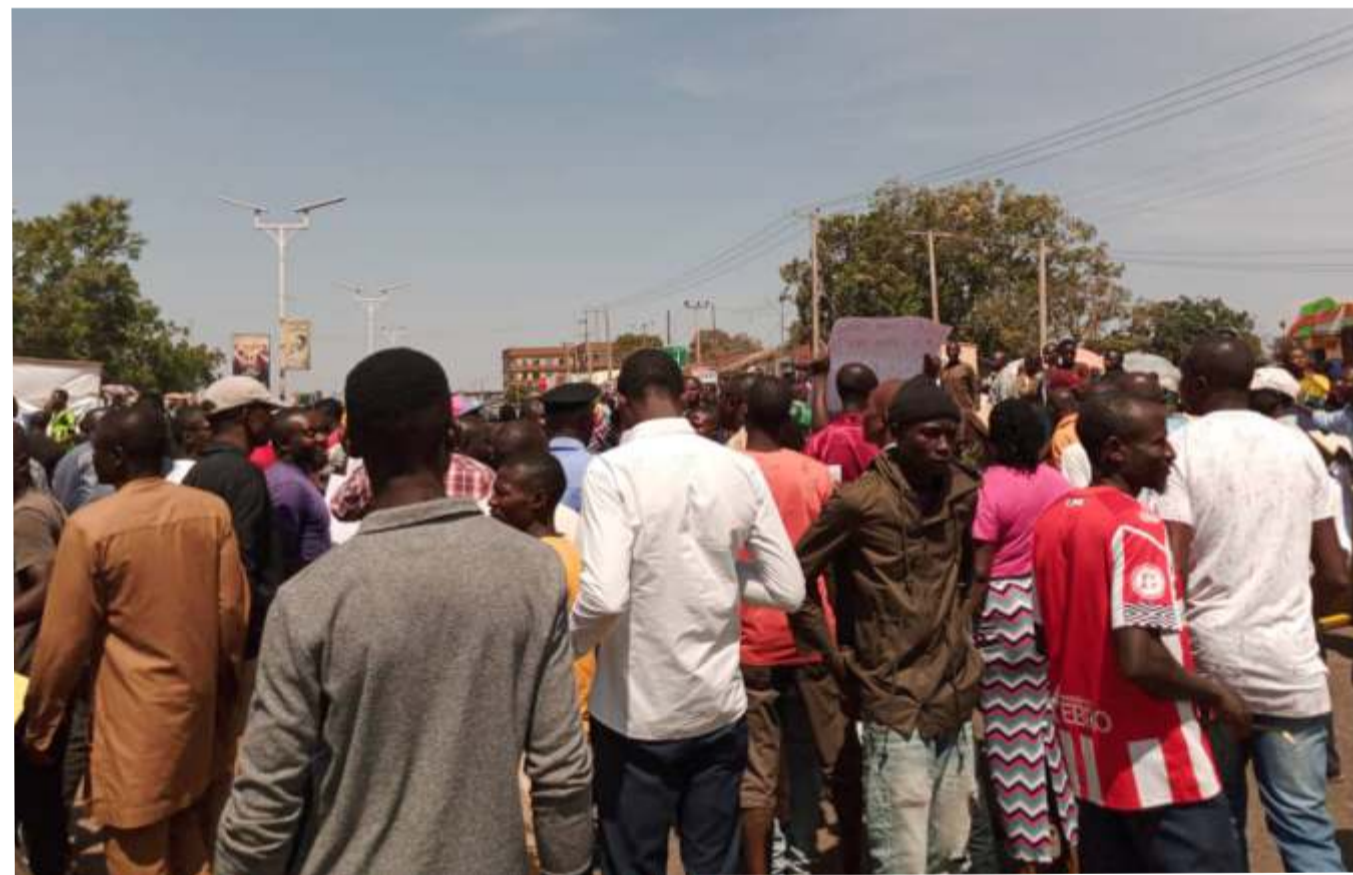
The protesting Plateau citizens in Jos.

*Insist pre election matters were thrown out in other cases