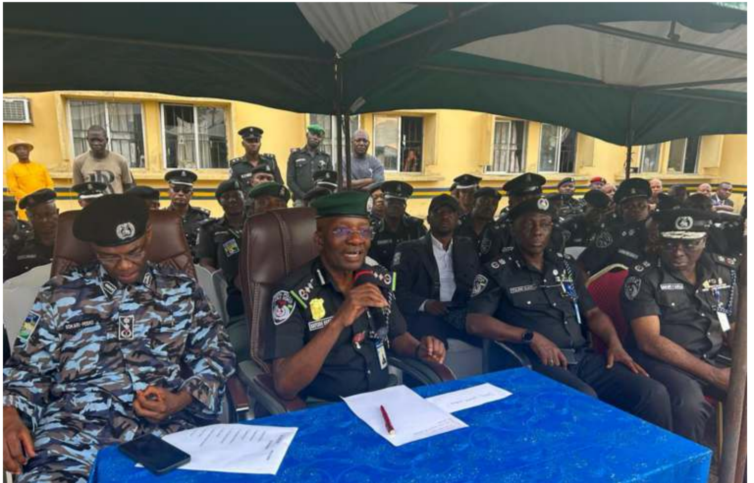
IGP Egbetokun addressing officers and men over the guber elections in Imo, Kogi and Bayelsa states.