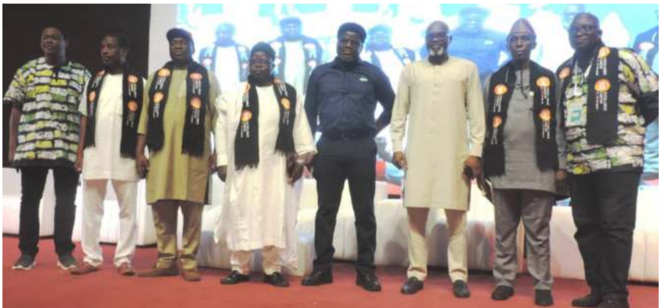
Members of Poultry Association of Nigeria (PAN) at the 12th edition of the Nigeria Poultry Show in Abeokuta yesterday, with the theme, "Mitigating the challenges of the Poultry Industry"