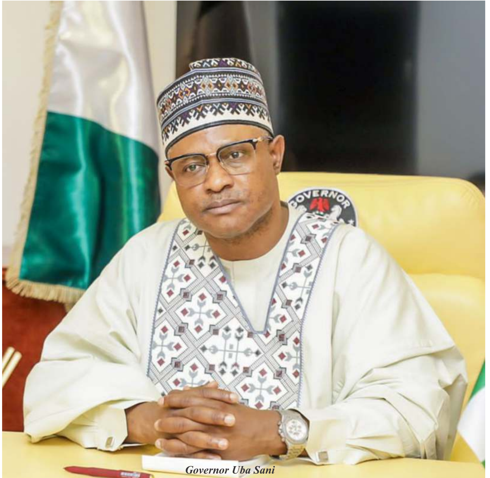
Governor Uba Sani

The highest revenue performance was from Government Share of FAAC, with N78.0 billion out of the budgeted N94.1 billion realized, a performance of 82%. The performance breakdown of which are Statutory Allocation with 61.3% and Share of VAT with 105.5% respectively. However, Independent Revenue fell short of expectation in the same period, with 44%