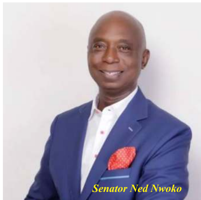
Senator Ned Nwoko

The journey ahead, characterized by hard work and unwavering dedication, is paved with the overwhelming support and best wishes of the entire Delta North constituency. A brighter future for Delta North and the PDP lies on the horizon, as Hon Ochor expressed with optimism.