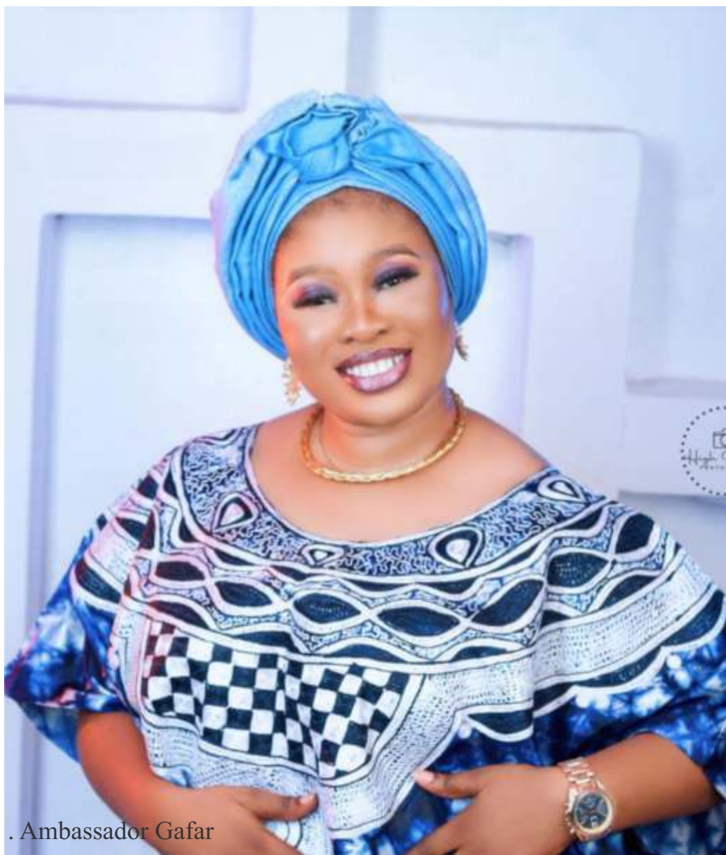
. Ambassador Gafar

She maintained that the Forum has a well developed comprehensive programme that focuses on empowerment and food security to address the specific needs and challenges of its over 1.7 million members across the length and