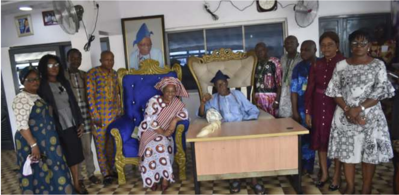
Oba Lekan Balogun receiving the NECO Zonal Director and her team yesterday.