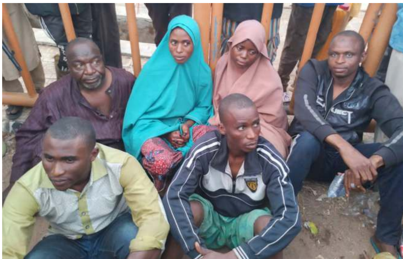
The rescued victims

The CP warned kidnappers to repent from their atrocious activities or leave Plateau State before the Police apprehend them.