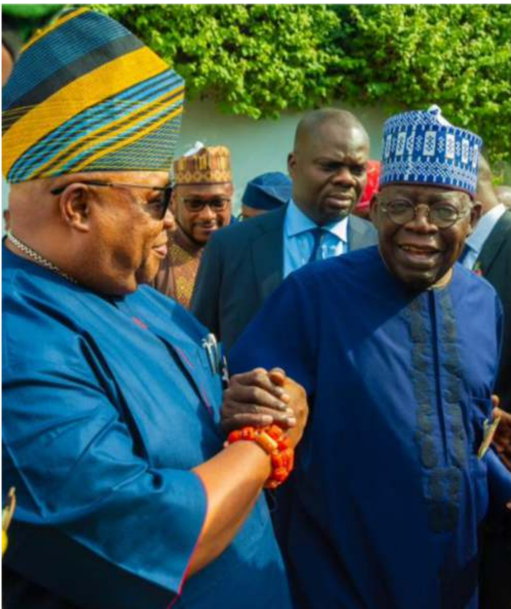
President Bola Ahmed Tinubu and Osun State Governor, Senator Ademola @ the Police Council Meeting held in Abuja.

■ Allege deductions ongoing for three months ■ SSANU PRO declines comments ■ KASU PRO says staff should wait for pay slip to know why PAGE 2