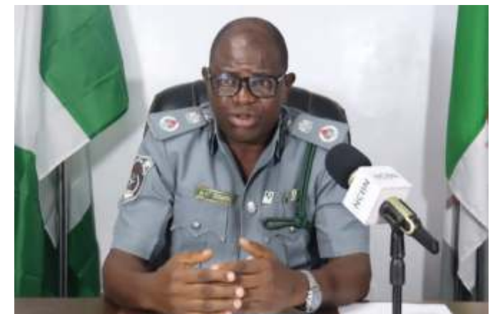
Comptroller Oresanya Lilypond Customs Command