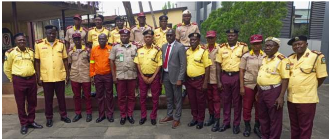
Officials of OYSTRMA and LASTMA during the visit.

The Plateau State Natural Medicine day was hosted by the Plateau State Ministry of Science, Technology and Innovation.