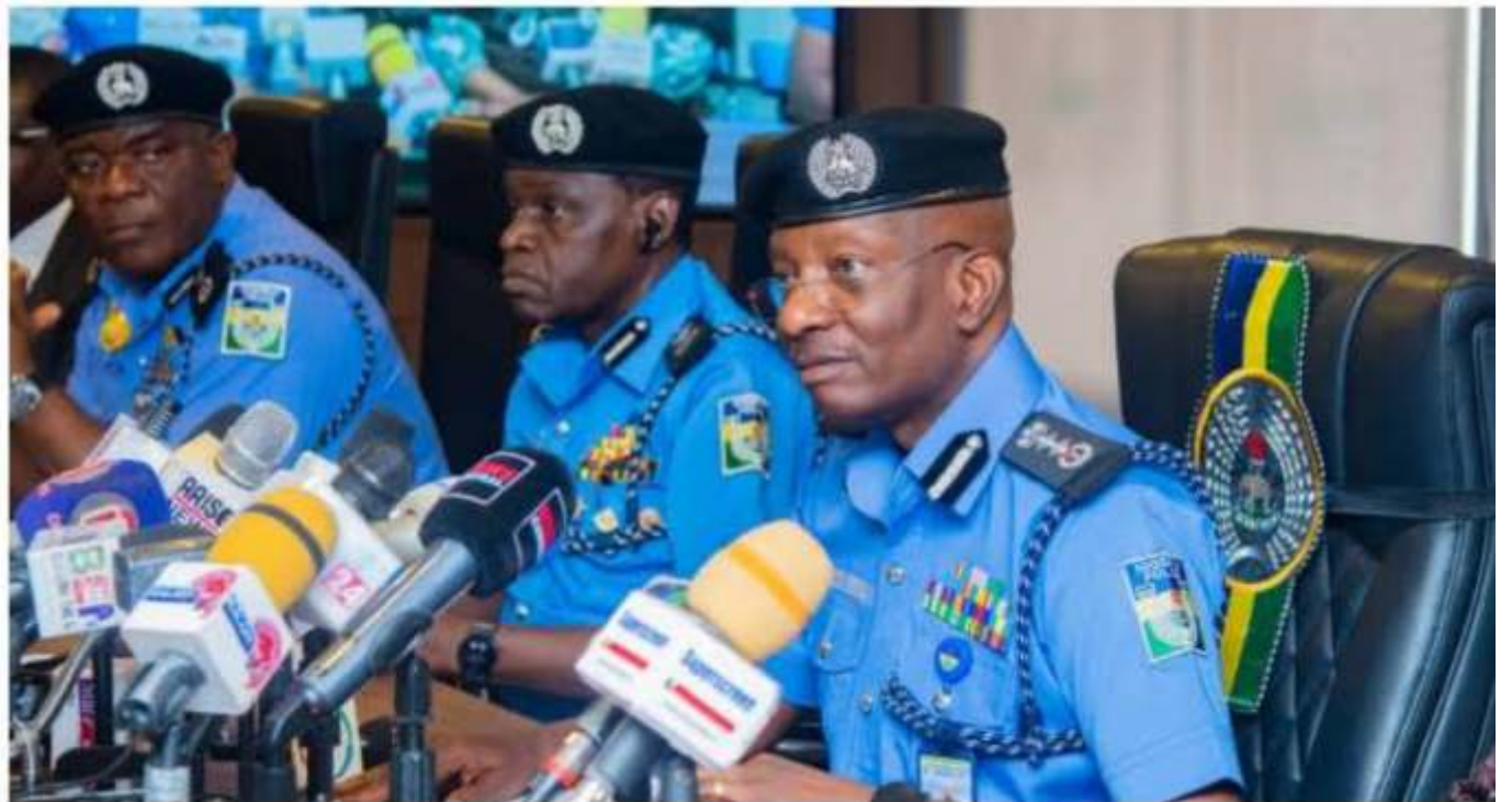
IGP Egbetokun addressing the stakeholders.