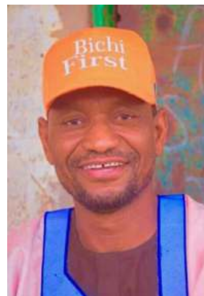
Bichi Council boss