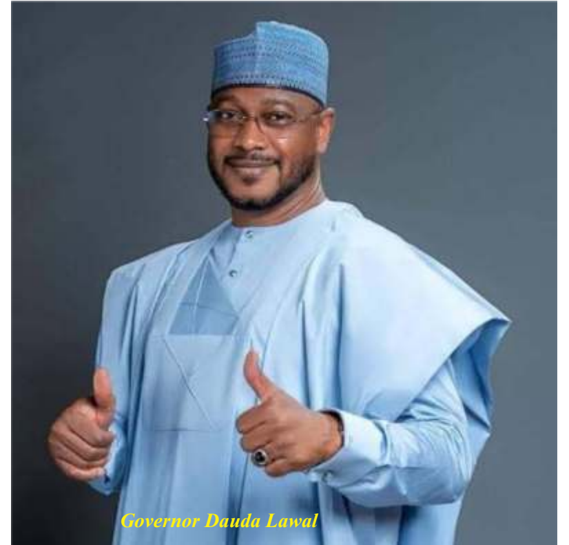
Governor Dauda Lawal

One of the many tests a great leader undergoes is the TEST OF INSIGHT. God will test your ability to accurately discern before He commits the destinies of people into your hands. For me, Dauda is an endorsement of God for the people of Zamfara. He is working and putting every single part of the system in place. The ability in him is so glaring that even the opposition with