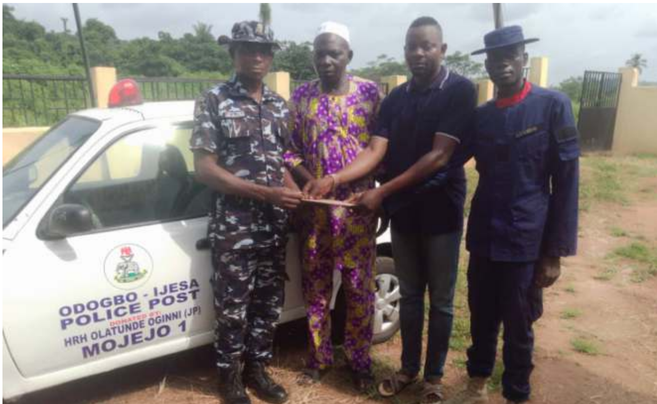
Photo Representative of Oba Oginni handing over the keys of the patrol Vehicle.