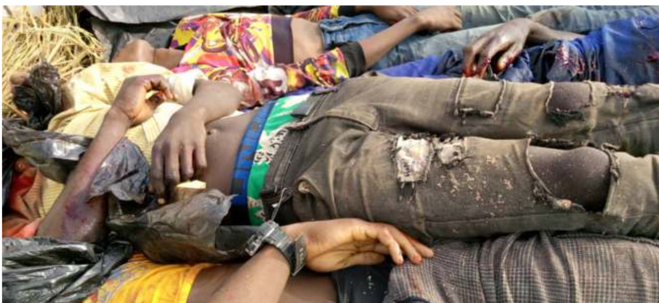
Some of the passengers affected in the accident

The group however, asked Zamfara elders, ulamas, and other political leaders to urgently call the governor to order and seek intervention in bringing all the two warring leaders together for harmony, peace, and progress of Zamfara and Nigeria as a whole.