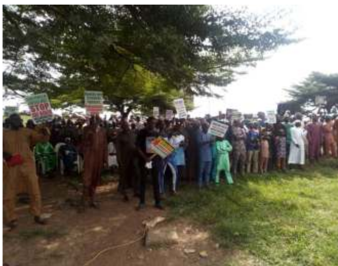
The protesting Muslim groups

He urged "anyone with useful information related to this incident or any other criminal activity to come forward and assist in the ongoing efforts to maintain law and order in the state."