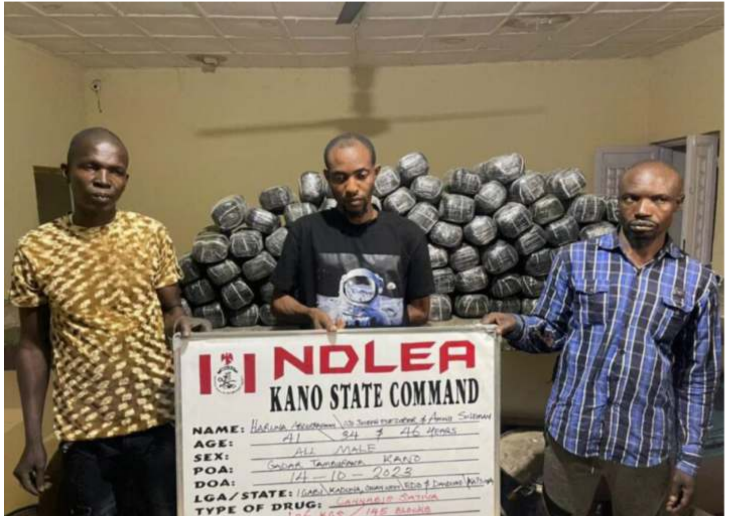
The ex-convict and two others arrested with him.

" While operatives of the Zone J Command of the Agency seized 478kgs of cannabis in a forest in