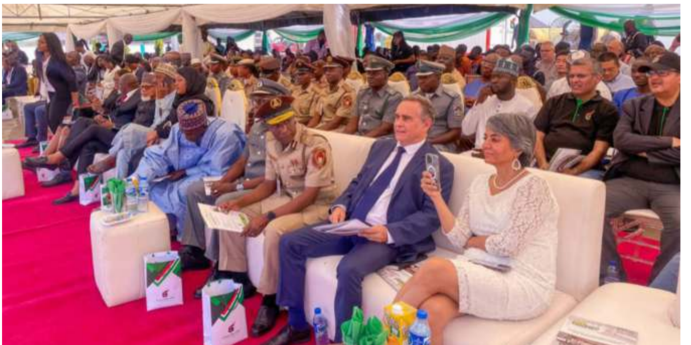
Dignitaries at the launching of the LCNG plant in Kakau, Kaduna yesterday.