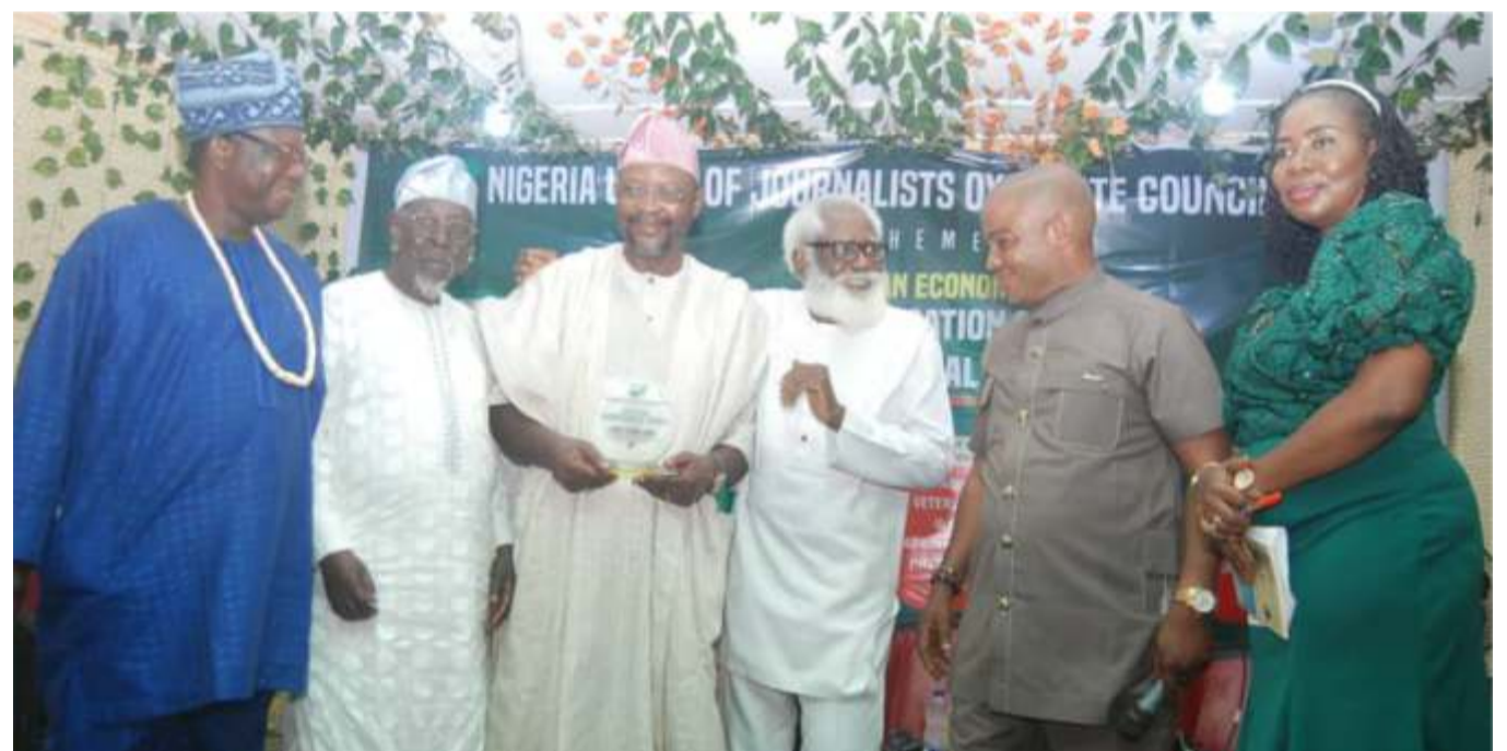
Guests at the Veterans Day