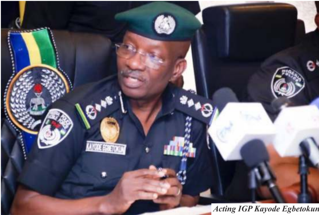
Acting IGP Kayode Egbetokun