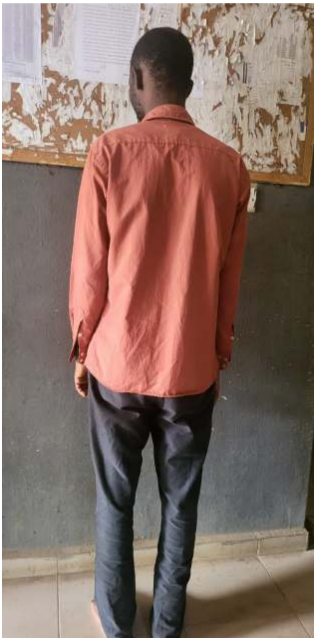
The suspected school proprietor

"Though the Area Command Agbor had concluded their