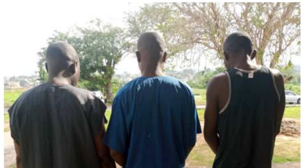
The arrested clergyman and other suspects

"The Oyo State Police Command wishes to clear the air as regards the