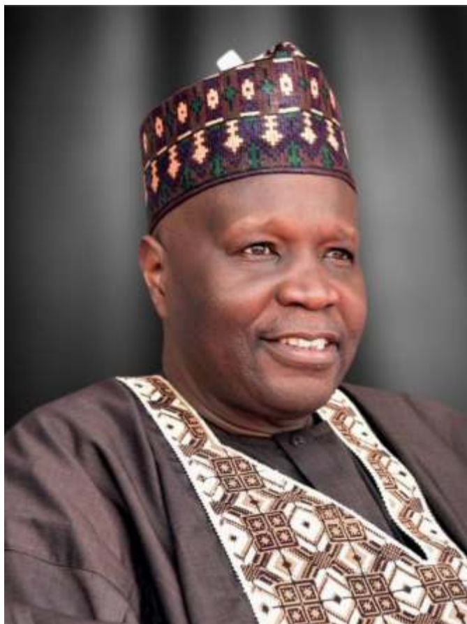
Governor Inuwa Yahaya