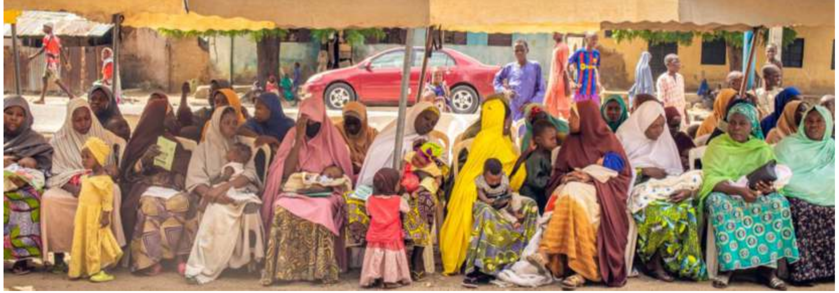
Mothers with eligible children at the flag-off