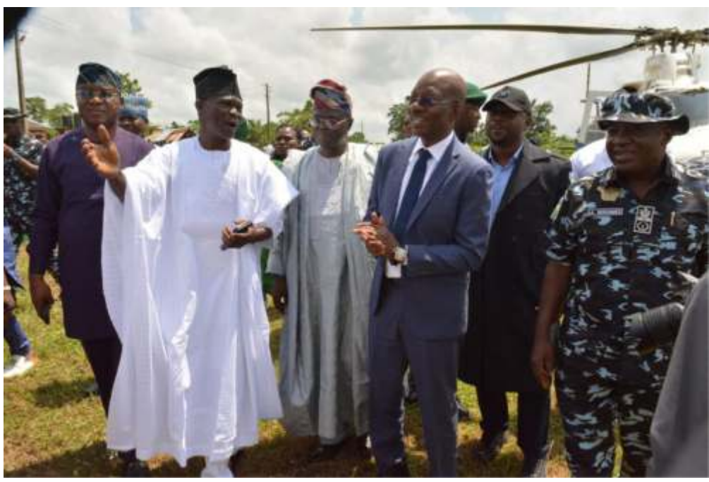
IGP Egbetokun in group photograph with monarchs of Yewaland.