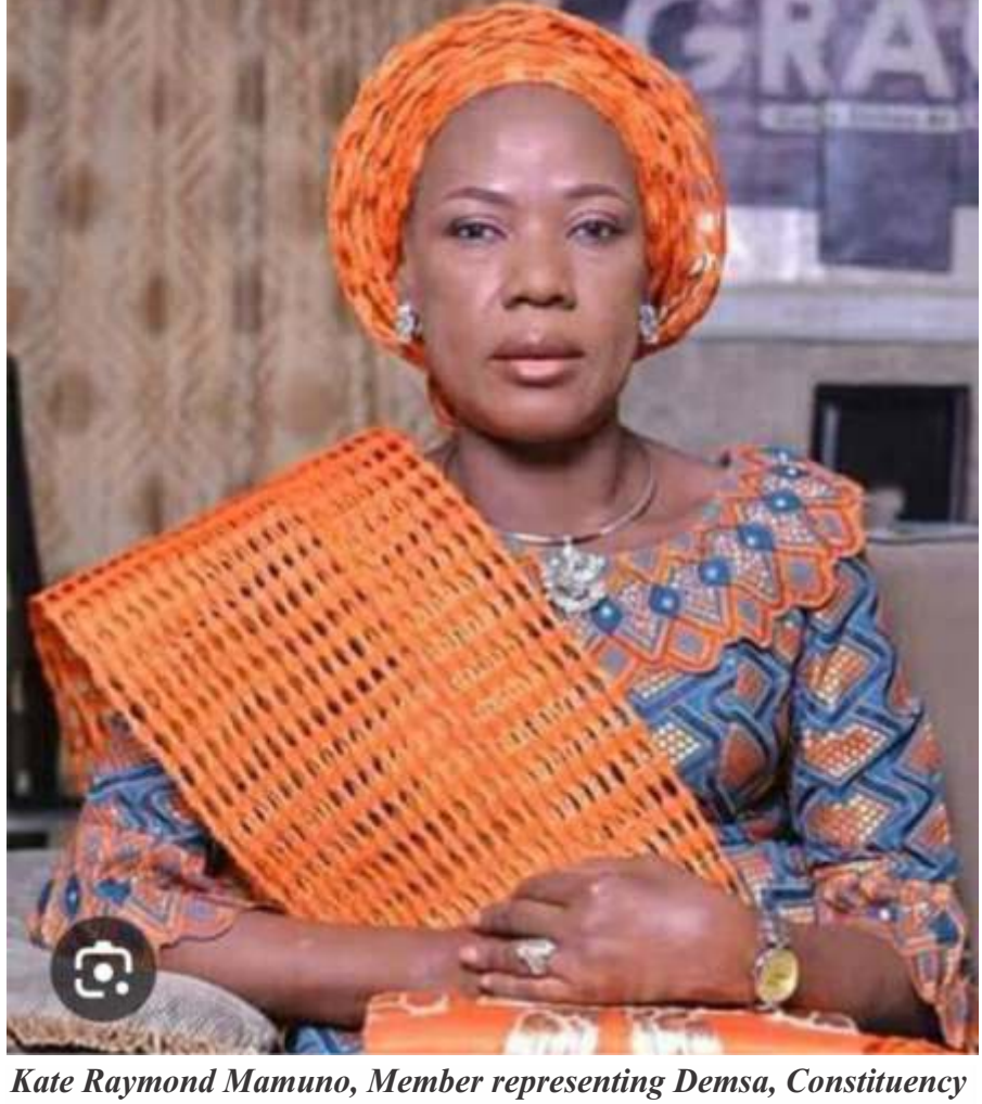
Adamawa House of Assembly.

Commenting on the challenges encountered by most women in politics, she said funding has always been a major problem limiting women participation, while culture and religion beliefs are supporting factors.