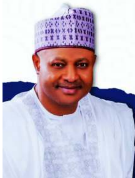
Senator Uba Sani Governor, Kaduna State

Happy International Day of the Girl Child