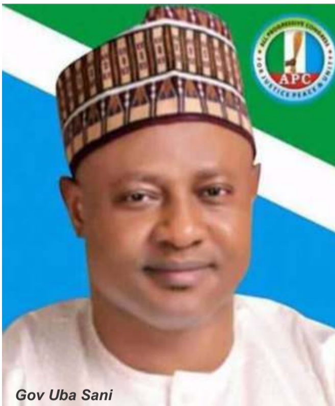
Gov Uba Sani