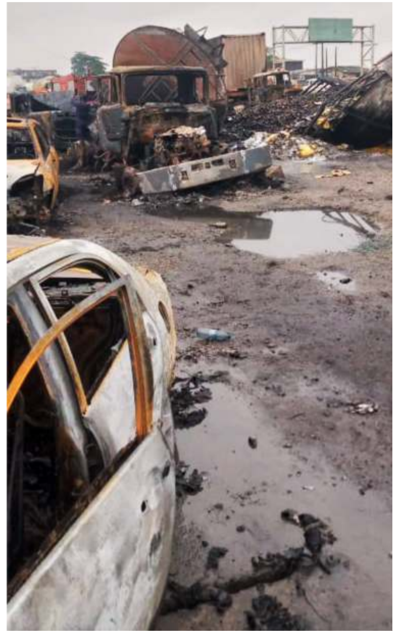
Burnt vehicles at the Iganmu fuel tanker explosion inferno.