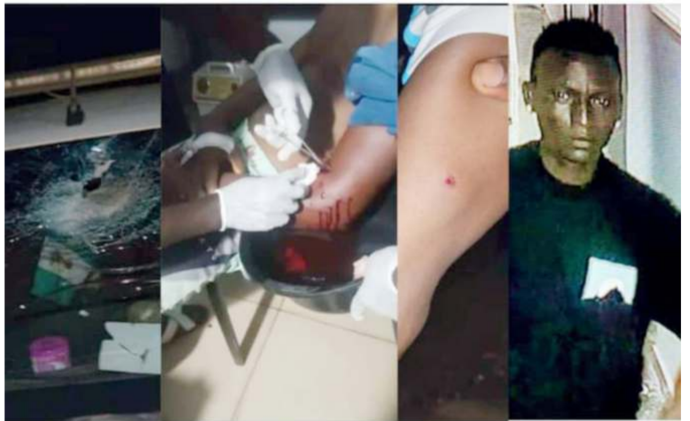
One of those injured during the attack at Bullion Hotel undergoing treatment.

"The poser that will be calling for an answer is, how can someone who was attacked in his own apartment be facing the case of attempted murder? There was no arrest warrant to back up the illegal arrest made by the police officers and the physical assault meted out on the staff and the hotel's guests,".