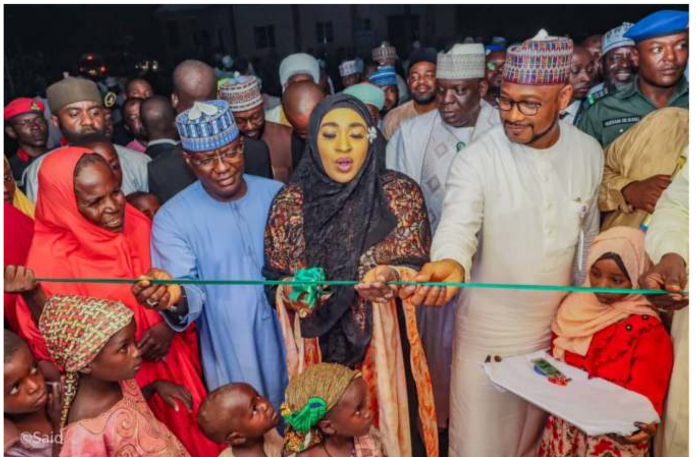
Governor Dauda Lawal, giving a helping hand to the Honourable Minister of Humanitarian Affairs and Poverty Alleviation, Dr Betta Edu, at the official opening and handing over of 40 fully completed and functional houses as a refugee resettlement city project in Zamfara recently

"The beneficiaries of these houses would also benefit from the Federal Government's monthly cash transfer to cushion the effect of fuel subsidy removal," she said.