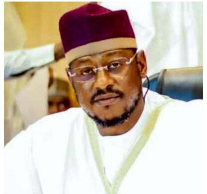
Governor Dikko Umar Radda

The Customs Boss reiterated the NCS's commitment to its mission and the safety and well-being of all Nigerians. He applauded the Nigeria Customs Service in Ogun State for their dedication and successful operations, contributing to building a safer and stronger Nigeria.