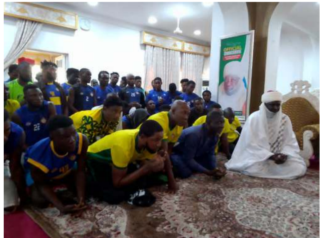
Kwara United players during visit to Emir of Ilorin's palace.