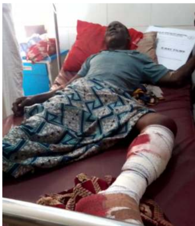
One of the wounded victims.