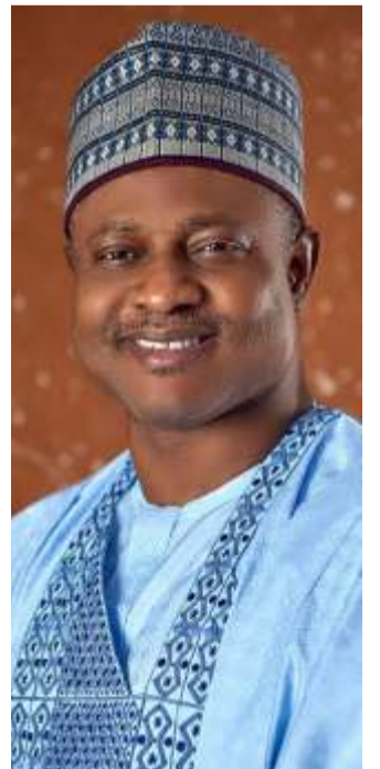
Gov Uba Sani

He asked for their support, prayers and protection against any form of intimidation or maltreatment towards teachers, especially in the line of duty.