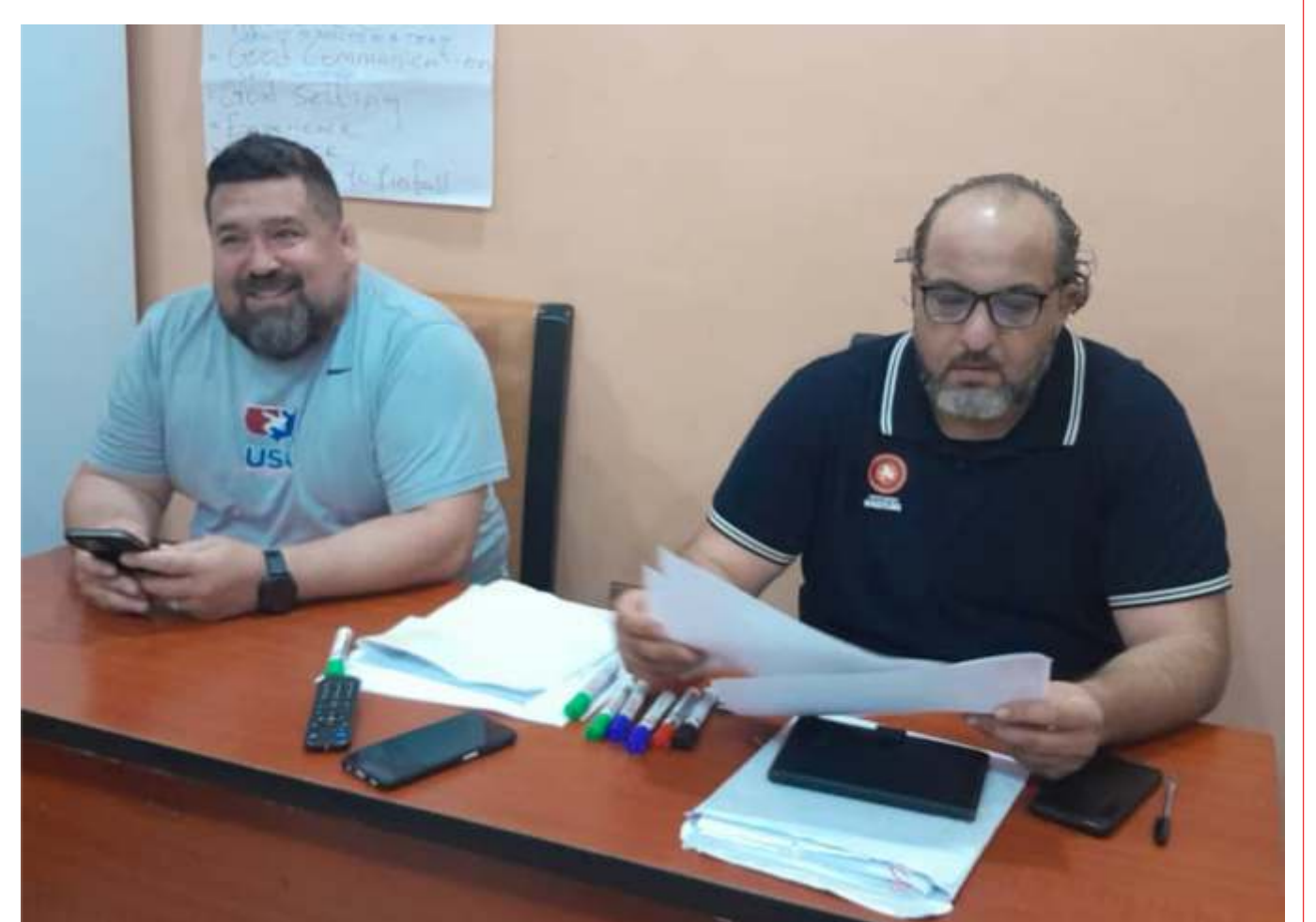
The wrestling instructor (right).

The world and Olympic champion, asserted that the training will have a lasting impact on the coaches, which will in turn, reflect on the athletes.