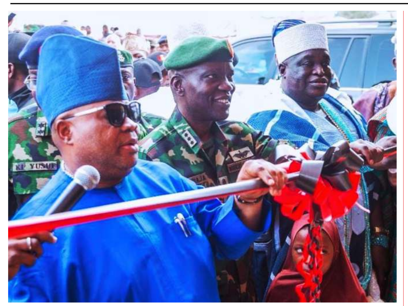
Osun State Governor, Senator Ademola Adeleke commissioning the civil - military school project Alusekere Ede, Osun State with him from right are Chief of Army Staff, Gen. Taoheed Lagbaja and Timi of Edeland, Oba Munirudeen Adesola Lawal @ the occasion.