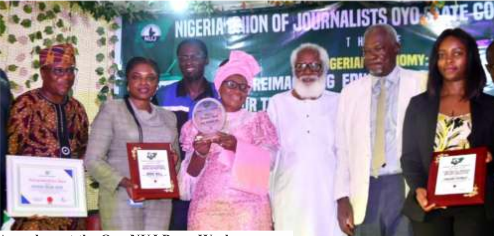
Awardees at the Oyo NUJ Press Week

Nigerian has access to accurate and unbiased information.Moreover, we acknowledge that the media