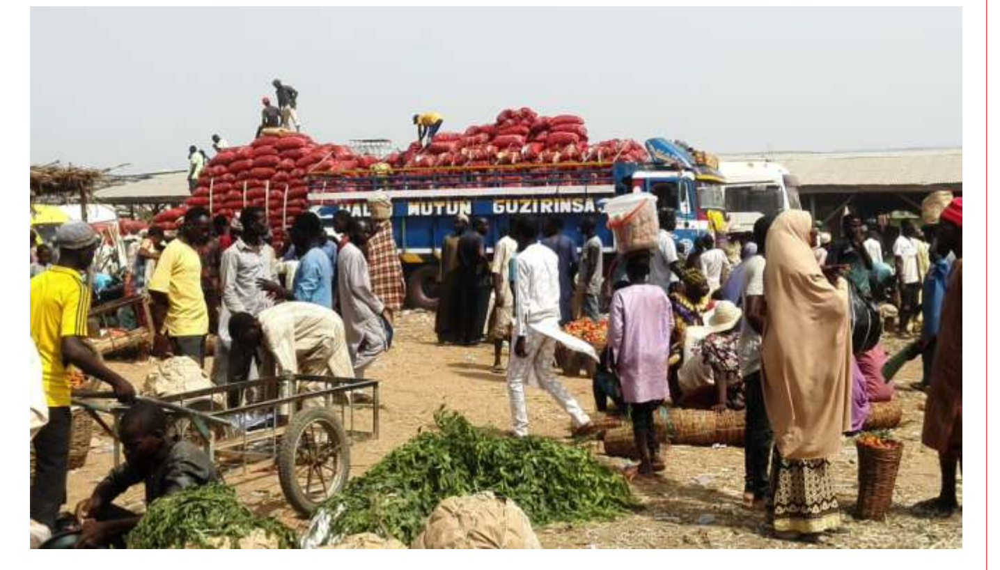
Loading of onions for transportation to other parts of the country at Badume Market.

He commended Bichi Local Government Council, under the leadership of Dr. Yusuf Mohammed Sabo for being vigilant at Badume Market, which indicates that the local council leadership is making efforts at promoting the economy and providing good avenue for seasonal businesses to progress.