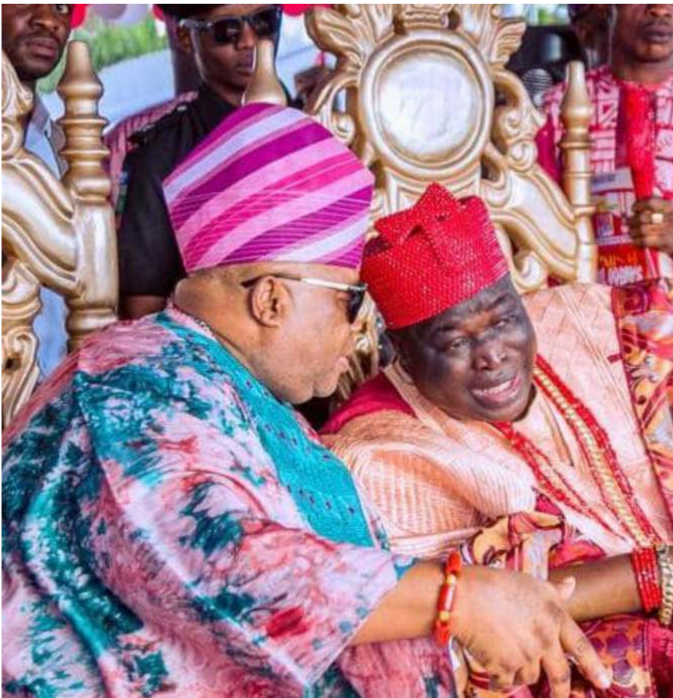
Osun State Governor, Senator Ademola Adeleke and Timi of edeland, Oba Munirudeen Adesola Lawal, Laminisa 1 @ the 2023 Sango Timi Festival held @ Timi Palace, Ede, Osun State.

According to the ES, when she received the State Advocacy Working Group on FP, on Wednesday, the new approach will make it easy for the government. She promised to write Planning and Budget Commission to break down the cash backing into N20m monthly installments, urging FHANI to continue its advocacy to the commission and ministry of finance.