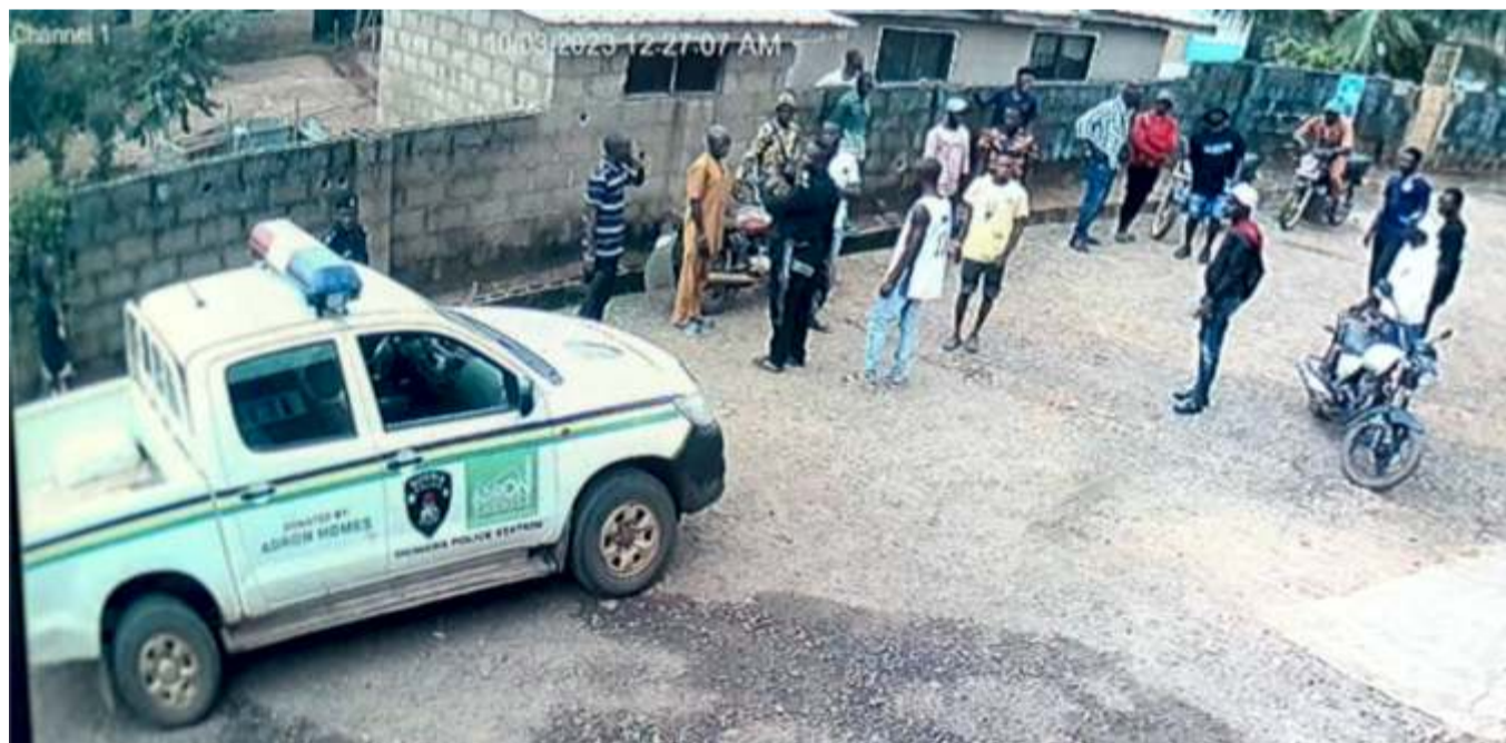
Scene of the attack outside Bullion Hotel

"NAPTIP shall continue working tirelessly to ensure a safer and better society," affirmed the Director General."