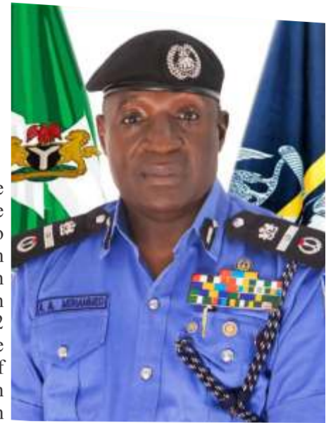
AIG Ali Muhammed

well while criminals are warned to relocate from Lagos and Ogun States which form the Zone 2 Command else the long arm of the law will catch up with them soonest