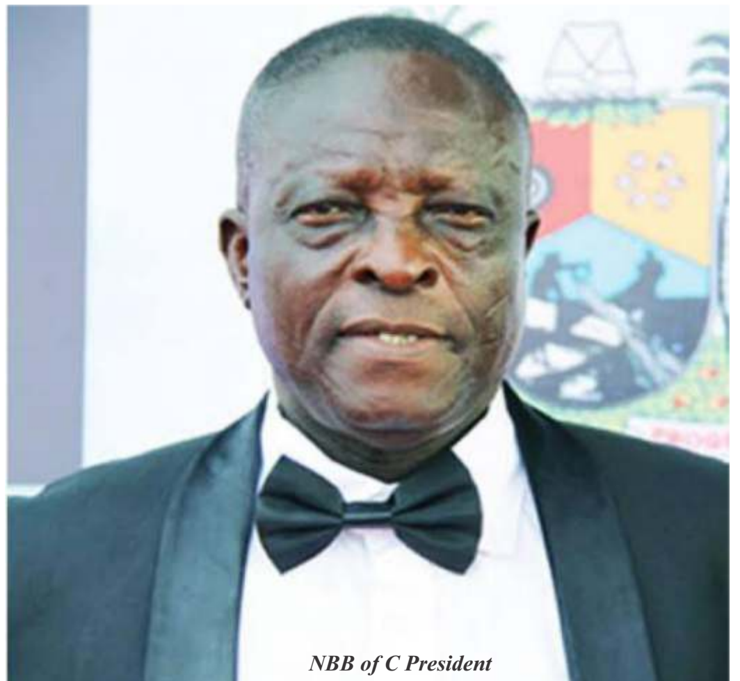
NBB of C President

"This has shown that the board is not biased and has the interest of the game at heart and we want to appeal to coaches to always follow due process in registering their grievances instead of resorting to self help or instigating their fans which is not good for the game", they chorused.