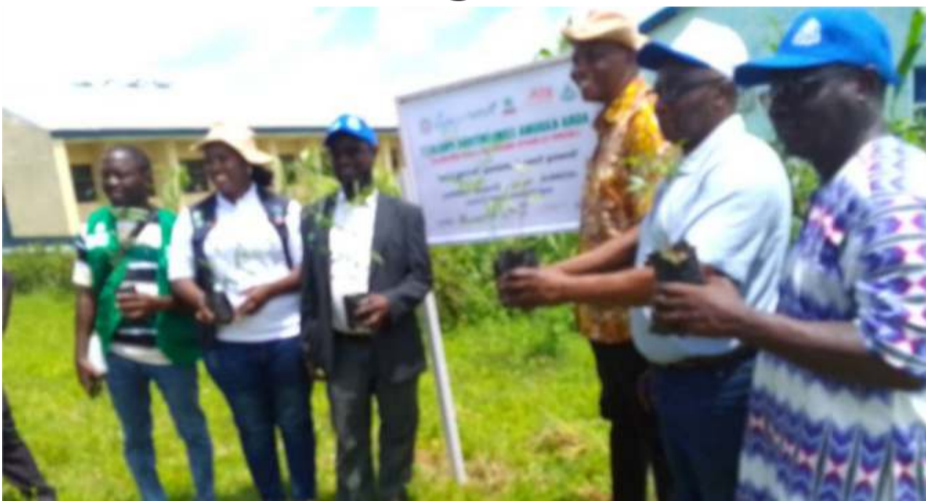
AGRA team at one of the sites in Kudan LGA,. Kaduna State yesterday