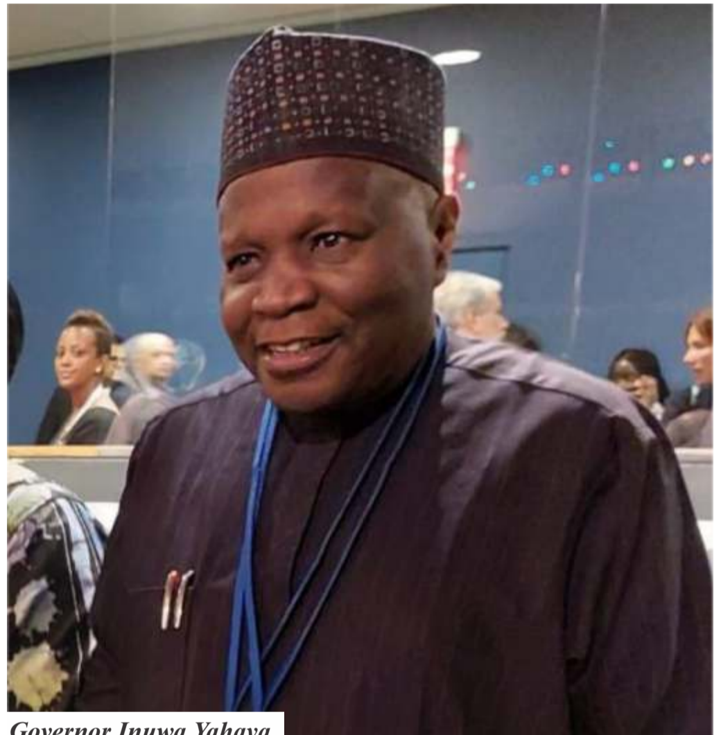
Governor Inuwa Yahaya

boundary with the remaining five states of the Northeast.