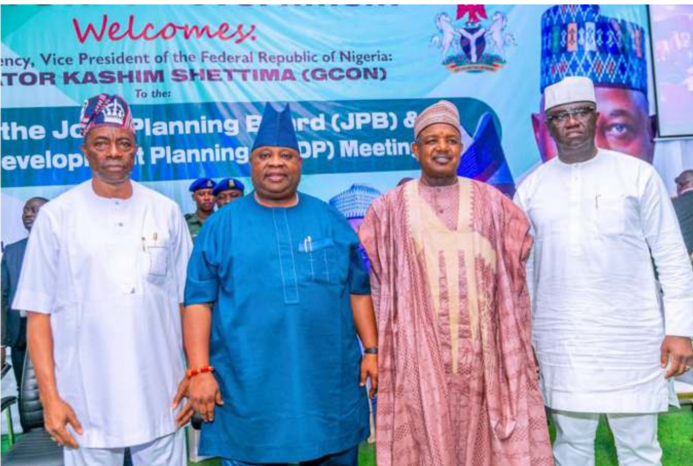
From left: Osun State Deputy Governor, Prince Kola Adewusi; Osun State Governor, Senator Ademola Adeleke; Minister of Budget and Economic Planning, Senator Abubakar Atiku Bagudu and former Minister of Budget and Economic Planning, Hon. Clement Agba @ the 22nd ceremony of National Council on Planning Development (NCPD) held at the Secretariat Osogbo.