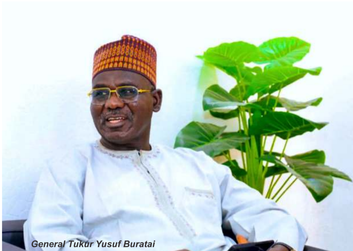
General Tukur Yusuf Buratai

In recognition of his outstanding service, General Buratai has received numerous honours and awards, including the Commander of the Order of the