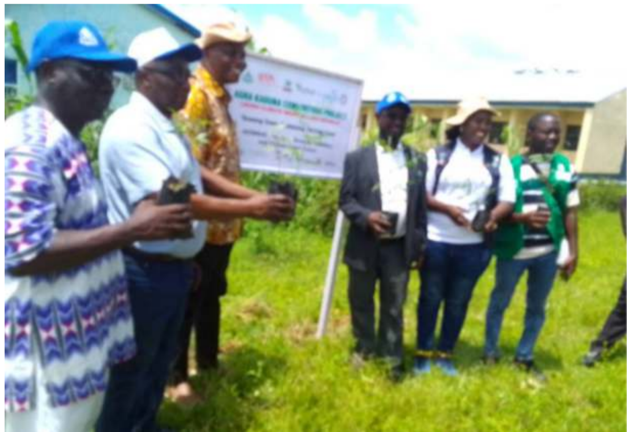
AGRA team at one of the sites in Kudan LGA., Kaduna State yesterday

During the event demonstration farm site was visited at NAERLS and Likoro and commissioning of Climate Smart Learning site at Likoro in Kudan Local Government Area.